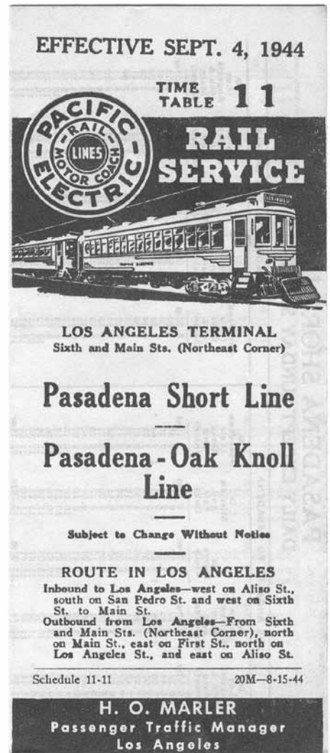
Above, a 1944 timetable from the Pasadena Short Line and Oak Knoll Lines, which operated until 1950 & 1951. At left is a 1950 transfer from the Los Angeles Transit Lines, which was absorbed by the Los Angeles Metropolitan Transit Authority in 1958. Below is a transfer for service on the Newport extension of the Long Beach Line, on which service ended by 1950. All from the author's collection.

For several years, the Pacific Electric Railway continued to operate freight trains for its parent Southern Pacific, using diesels as motive power. The company was finally merged into the SP on August 13, 1965. Today, some former Pacific Electric lines remain in service on Southern Pacific successor Union Pacific, but the days of interurban electric cars scooting past on a seven minute headway are only a memory. Small pieces of memorabilia, such as timetables and transfer tickets are all that remain. In the following pages, enjoy a brief trip back to the days when you could still transfer to the Pacific Electric Railway.