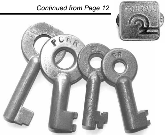
On January 1, 1983, Conrail handed over the keys to its commuter operations to the regional transportation agencies that had previously been subsidizing them.

Today, private companies compete for the contracts to operate commuter trains in locations such as Boston, Washington, and Baltimore. With the realization by government policy makers that public transit must receive adequate funding and equipment investments, commuter rail service has become a profit center instead of a drain on the balance sheet. It is interesting to speculate what might have happened if this "commuter rail