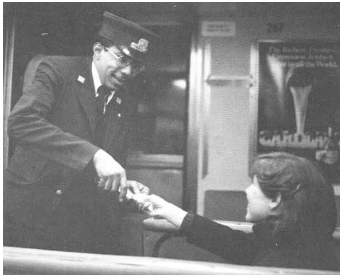
In its 1981 Annual Report, Conrail included this photo of a friendly trainman assisting suburban Philadelphia passengers, while noting that the company would soon be relieved of the obligation to provide this service.

However, the transition was not without its rough spots for the new operators. In March of 1983, SEPTA train crews went on strike, in protest of the agency's attempt to place them under the transit motormen's labor agreement. All of the new commuter railroads faced the challenge of adapting their operations to a