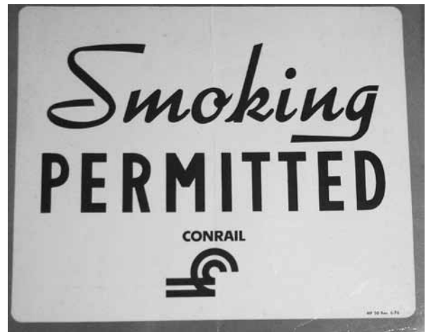
You won't see this message in a coach today! Blue letters contrasted with a red "No Smoking" on the sign's reverse, changing the car's status when turned.

Public timetables were immediately distributed under the new company's name, with the early "ConRail" logo appearing on the first editions of several forms in 1976. The "wheel on rail" logo replaced it on subsequent printings, but the various timetable styles of the predecessor railroads generally remained in place. For several months, the ghost of the Penn Central