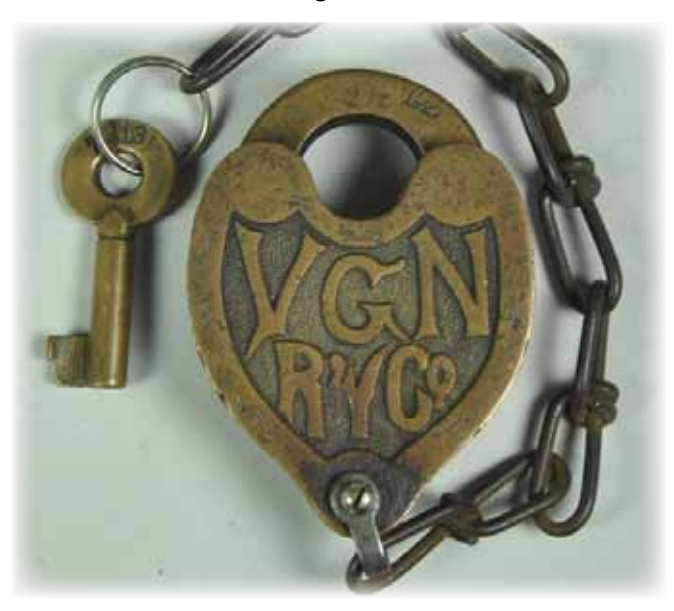
This Virginian Ry brass heart lock & key brought $1150, one of several locks that pushed the $1000 mark.

Memorabilia from the Virginian Ry proved to be popular, with tall globe lanterns selling for between $400 and $700, and short globes bringing $300-400. A Virginian "Adams" lantern with a clear cast globe was one of the higher-priced items at $1495, although a Danville & Western lantern was not far behind at $1265. Both were overshadowed by a Richmond & Danville lantern with a clear etched globe, that sold for $1610. Several Virginian brass heart lock and key