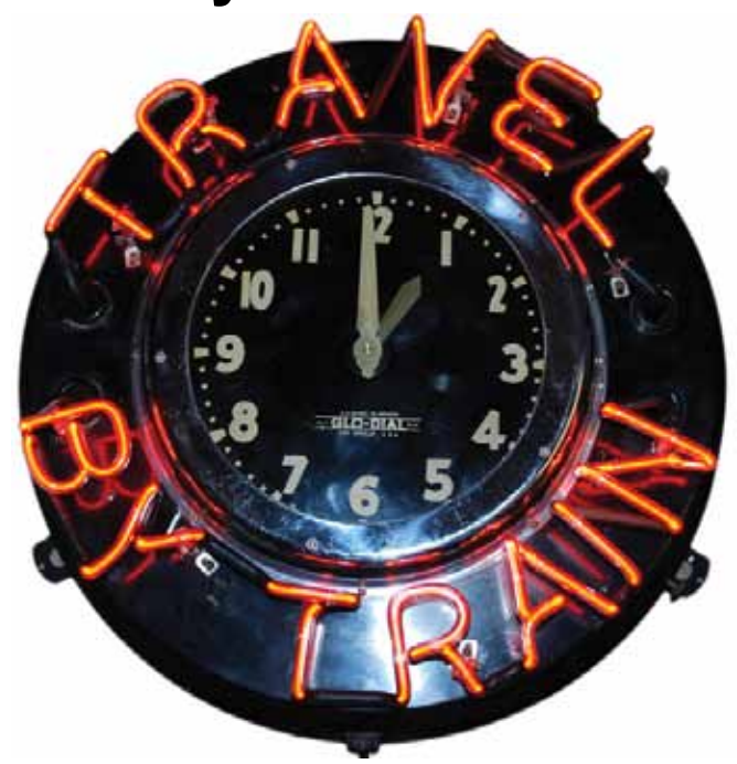
A fully restored and operational Glo-Dial "Travel By Train" twenty-two inch neon sign and clock brought $3850