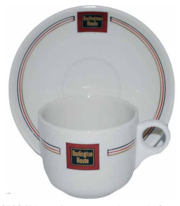
A CB&Q "Aristocrat" pattern cup and saucer by Syracuse China with 1957 & 1965 date codes sold for $600.