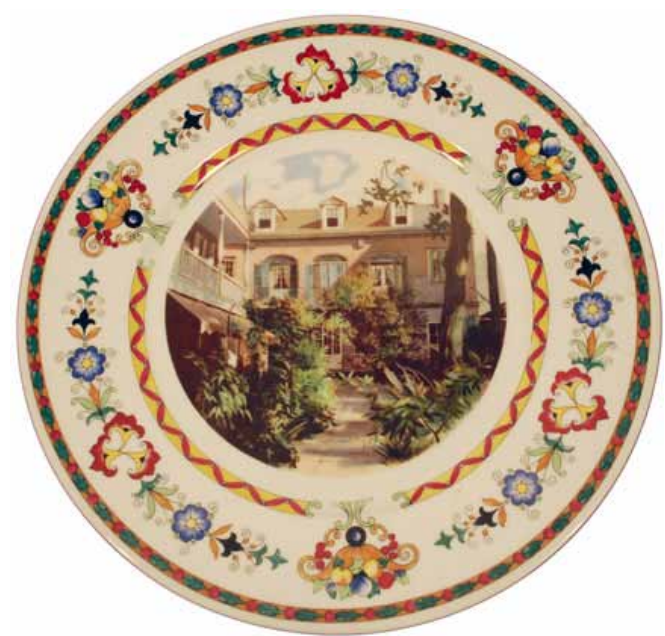
A rare Illinois Central "French Quarter" pattern service plate produced by Bauscher went to the higher bidder for $940.

A complete online catalog with photos and prices realized for this auction (and previous auctions) is available on the Railroad Memories web site at www.railroadmemories.com.