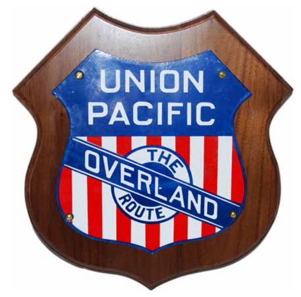
Some paint touch-ups on this scarce Union Pacific enamel baggage cart sign didn't discourage a high bid of $845.