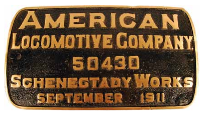
A high bid of $1210 took home this Alco builders plate from Missouri Pacific RR 2-8-2 steam locomtive #1241.