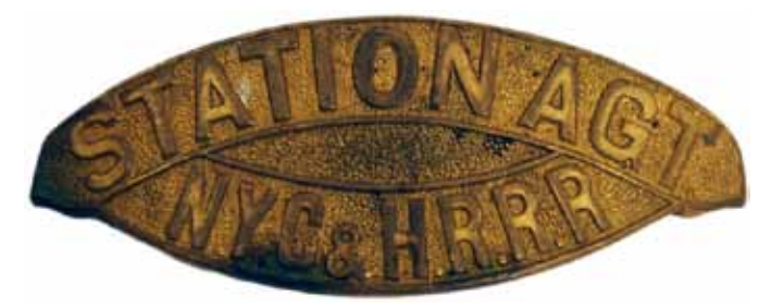
This unusual New York Central & Hudson River Railroad Station Agent badge, with no maker's mark, sold for $430.

Railroad Memories catalog Number 79 included a broad selection of keys, china, lanterns, globes, paper, locks, and advertising material. Despite the relatively weak economy, it