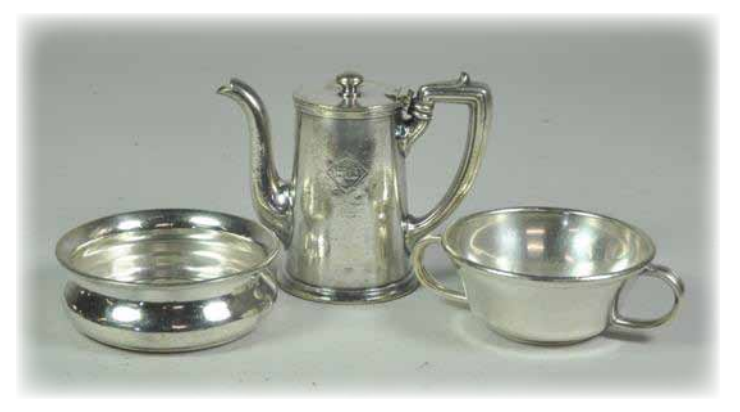
One of several lots of silver holloware, this set from the Erie Railroad went to the high bidder for $316

for several shop torches, that brought from $80 to $150, and a cast spittoon for $633. Virginian keys sold in the $60 to $100 range, and a public timetable brought a high bid of $92. A 1926 broadside for $748 rounded out the high end items from this unique coal-hauling line.