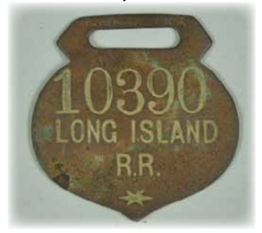
While several baggage tags brought high bids of over $200, this example from the LIRR sold for a reasonable $23.

Timetable prices fell within the typical range, with scarcer early issues bringing $75-100, and more common examples selling for $10-20. Switch keys bids also reflected the current