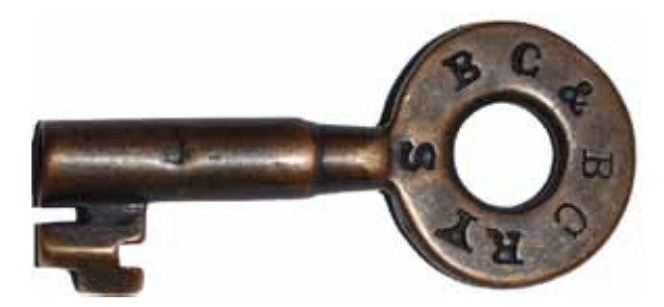
A Battle Creek & Bay City Railway tapered barrel switch key by Romer & Co. went to the high bidder for $556.