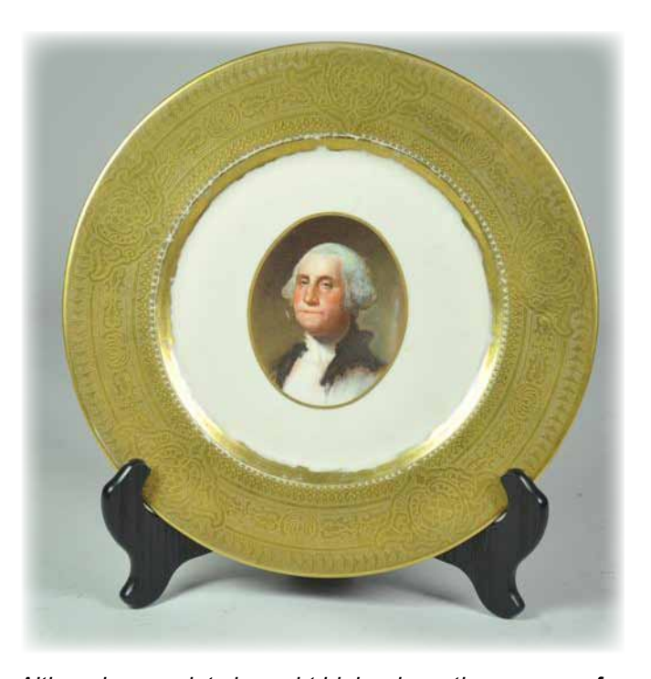
Although many lots brought high prices, there were a few bargains at the sale. This C&O George Washington plate with some wear and minor foot chips sold for only $115.