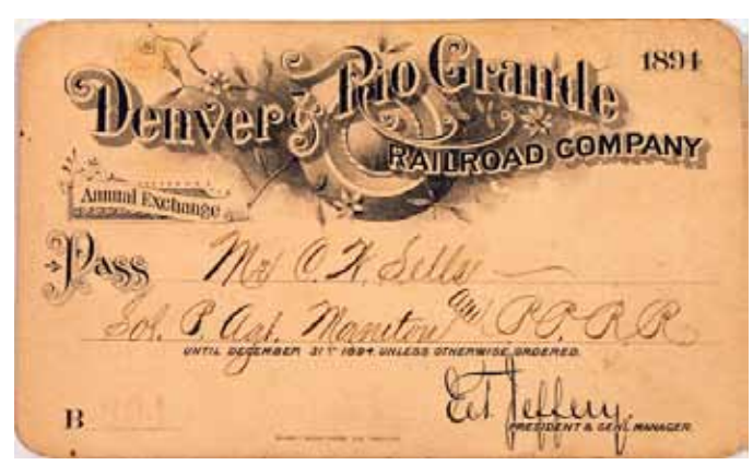
Railroad Memories auctions usually include some scarce items from Colorado lines. This ornate Denver & Rio Grande Railroad 1894 annual pass brought $385.