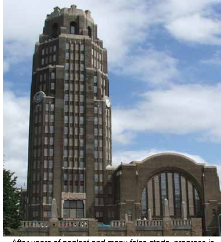
After years of neglect and many false starts, progress is being made in the restoration of Buffalo Central Terminal.

value from its interior. On a gloomy day, the building looked like something out of a Ghostbusters movie, and its flooded, crumbling, lower levels became the setting for expeditions by hunters of the supernatural. For those who had seen the terminal in its final days of railroad service, it was simply sad to see it fall into such a state of disrepair.