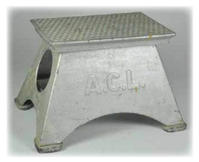
A number of step boxes were sold at the auction, with this one from the Atlantic Coast Line bringing in $201.

For those who had the space to display them, a number of larger items were auctioned, including various cast iron signs and marker posts. A ticket cabinet sold for a reasonable $288, while a brass locomotive bell went for $1265. The Virginian collectors once again engaged in spirited bidding