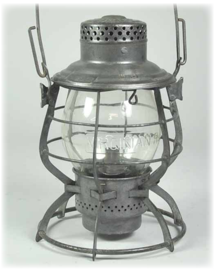
A nicely restored Virginian Railway "Adams" lantern with a clear cast tall globe went to a new owner for $1495.

Most lanterns brought fairly high prices, with tall globe models selling in the $200 to $400 range. Even those from northeastern lines were popular, perhaps indicating that there were a number of bids from out of town. A New York Central Dietz No.6 sold for $104, while a brass top bell bottom from the Housatonic RR, with a cracked cast globe, went to a new owner for $561. An Erie lantern by C.T. Ham, with a red cast globe, managed to do better than at recent northeastern auctions, with a sale price of $173.