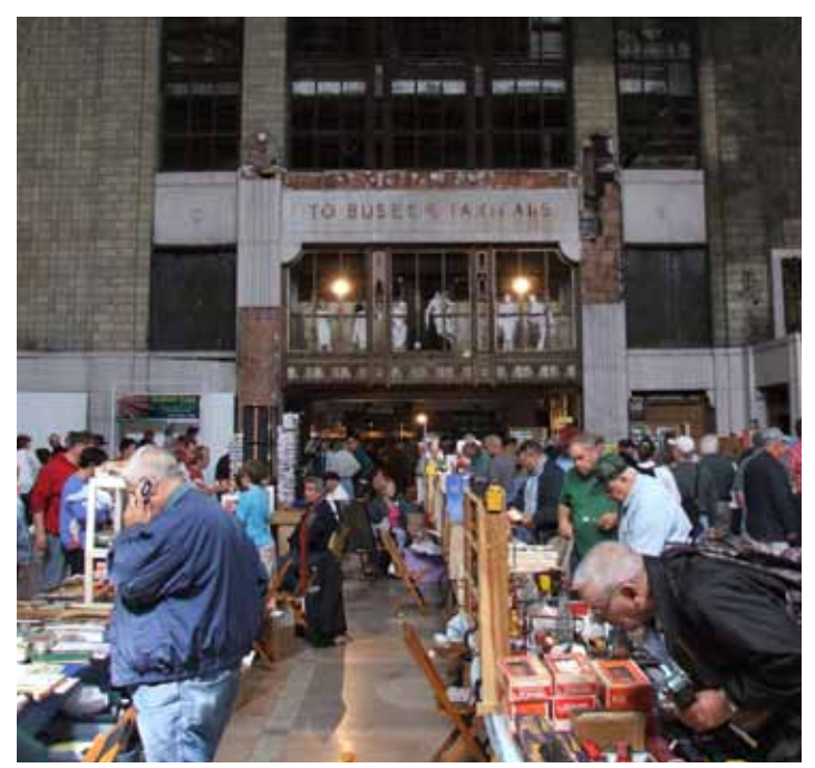
What better place is there for a model train and railroad memorabilia show than an old passenger terminal?

The station's somewhat remote location on the city's edge, although inconvenient for passengers, is probably what saved it from destruction, while other depots fell victim to urban redevelopment projects. Several early attempts to convert the unique building to other uses failed to materialize, although they served to preserve the building for another ten years. However, by the 1990's, the terminal had become a playground for vandals, and looters had stripped anything of