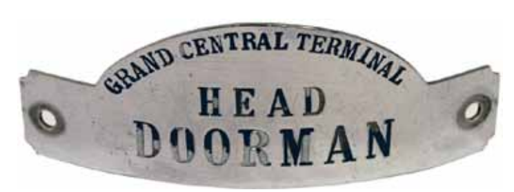
How's this for an unusual occupation? This cap badge, hallmarked for F.G. Clover Co., went for a high bid of $330.