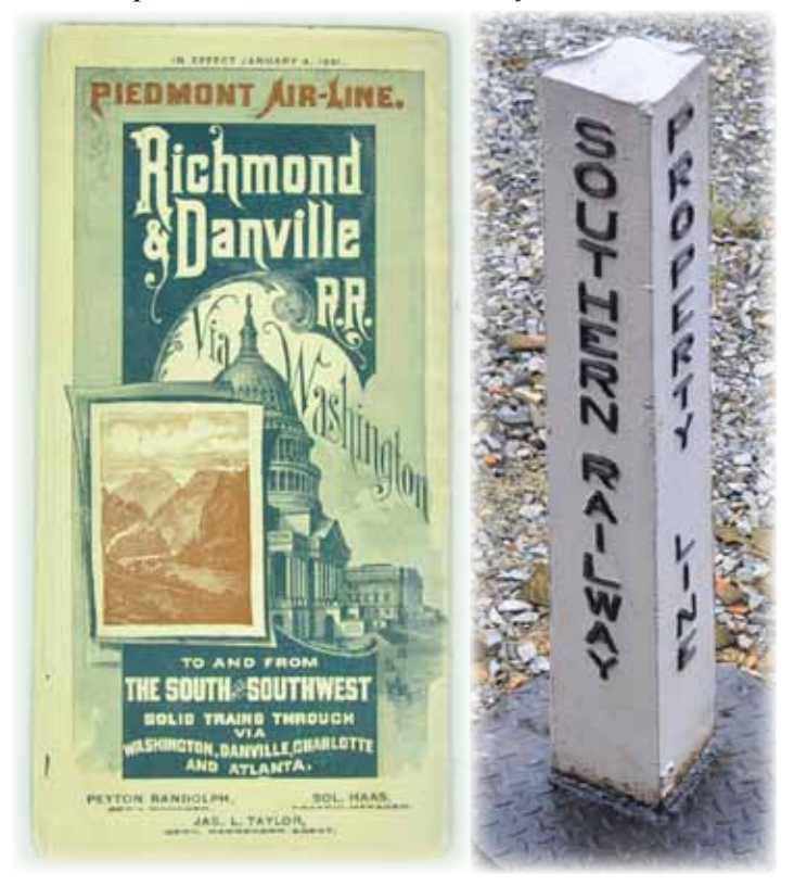
A scarce Richmond & Danville timetable sold for $81, while an unusual Southern Ry property line marker brought $230.

Complete auction results & photos are available at www.kfauctions.com.