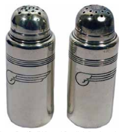
Southern Pacific "Winged Daylight" salt and pepper shakers by International Silver sold for $800.