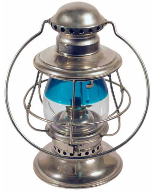
A crack in the green over clear globe and a slightly bent bell bottom allowed someone to take home an otherwise nice example of a Dietz No.3 presentation lantern for $357.