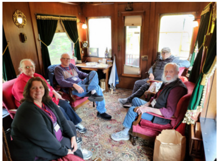
Key Lock & Lantern excursion passengers ride in style aboard the Erie Lackawanna #2 business car.