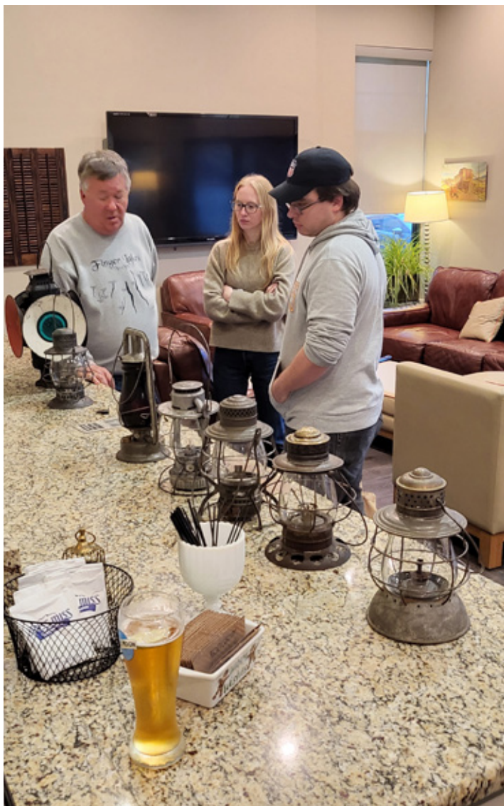
Friday evening trading takes place at the Canary Lounge in the Hotel Anthracite with the help of some liquid courage.