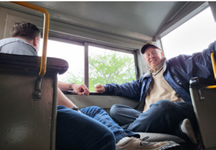
Key Lock & Lantern excursion passengers enjoy the view from the cupola in the original DL&W shop built caboose.