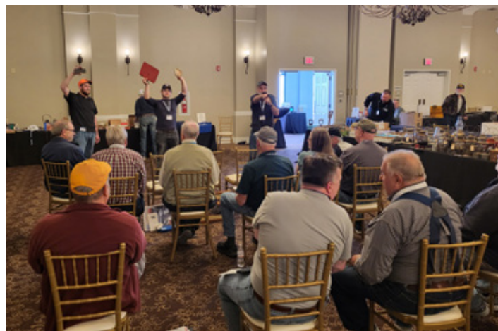
The annual KL&L fundraiser auction is a lighthearted event that helps the convention operate on a break even basis.