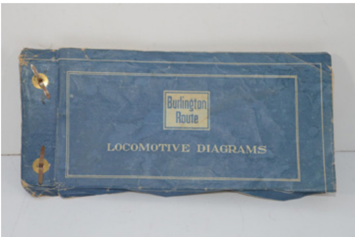
A bid of $150 was needed to take home this Chicago Burlington & Quincy locomotive diagram book.