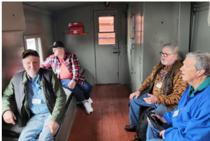
There is nothing quite like a sitting around a warm caboose stove on a cool and rainy spring day.