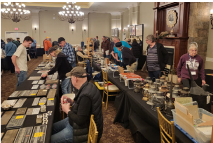
Locomotive builder's plates were very well represented at this year's Key Lock & Lantern Convention.