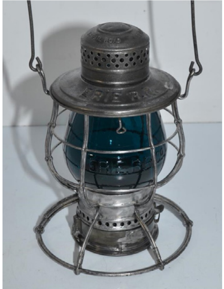
A $1400 bid purchased this Erie Railroad #39 lantern by CT Ham with a matching green cast Erie RR globe.