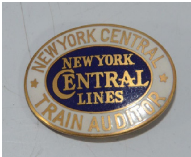
A high bid of $80 sent this New York Central Lines enamel Train Auditor badge to a new collection.