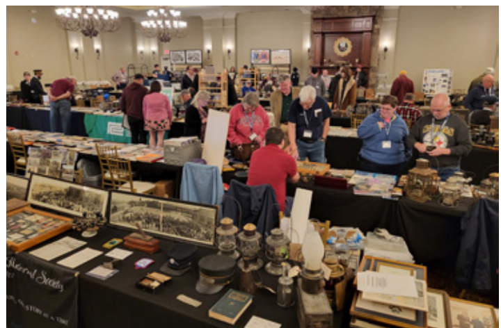
KL&L show attendees enjoy 6000 square feet of transportation history exhibits and memorabilia for sale.