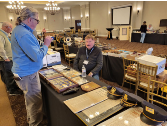
Railroad police patches and badges were among the many different aspect of collecting on display at the show.