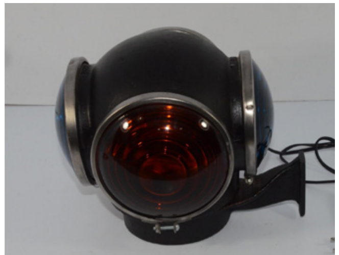
A restored and working electrified Adlake cannonball marker lamp went to a new collector for a $130 bid.