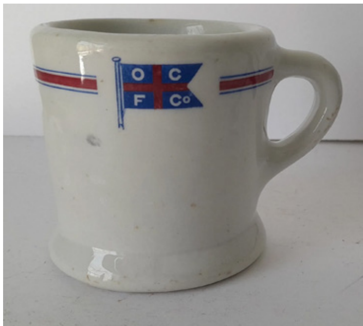
A $350 bid was needed to buy this Ontario Car Ferry Company mug with a Montreal makers mark.