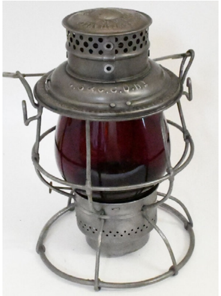
A $1250 bid purchased this Colorado Springs & Cripple Creek District Adlake lantern with unmarked globe.