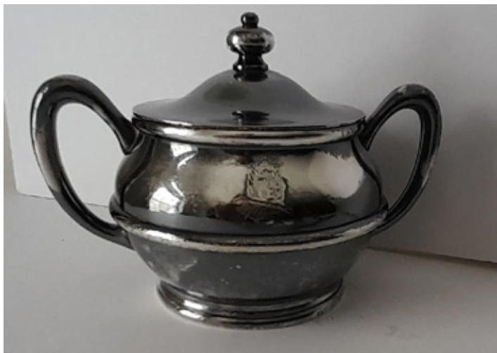
A 1913 Maine Central pinecone logo sugar bowl by International Silver went to a new home for $275.