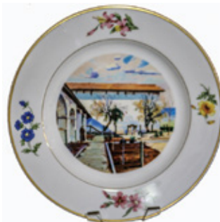
SP Mission Service Plate