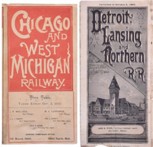
An 1884 Detroit Lansing & Northern RR and 1887 Chicago & West Michigan Railway timetable sold for $120.