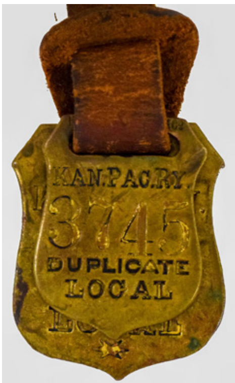
A pair of Kansas Pacific Railway local baggage tags by Hoole Baggage Check Company sold for $850.