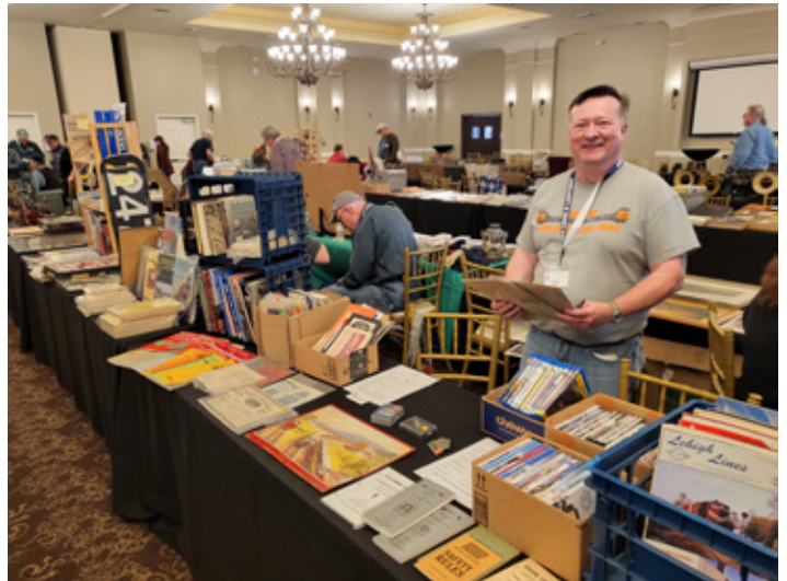
KL&L was once known as a "hardware only" show, but timetable and paper collectors now participate.