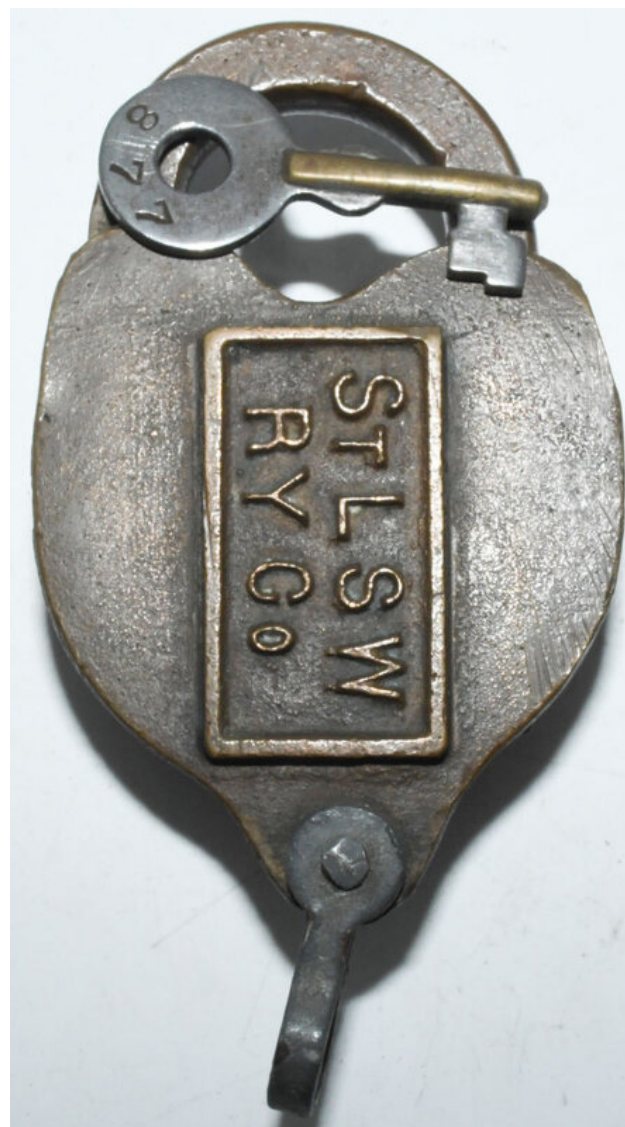
A $600 bid took home this St. Louis Southwestern Railway brass heart lock with working unmarked key.