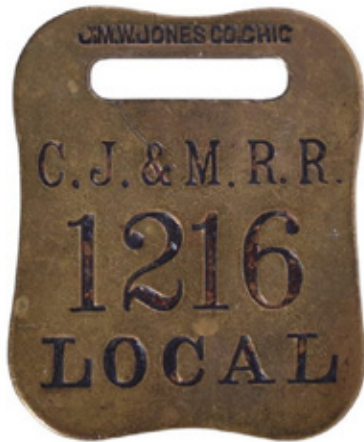
A $140 bid purchased this Cincinnati Jackson & Mackinaw Railway local baggage tag by J.M.W. Jones Co.