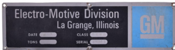
The EMD builders plate from the first Amtrak SDP40F diesel locomotive went to a new home for $2300.