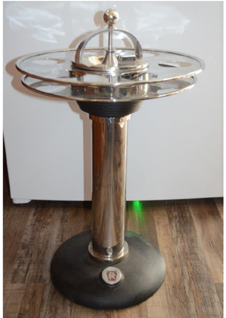
A Pennsylvania Railroad parlor car smoking stand with the keystone logo on the base sold for a high bid of $375.