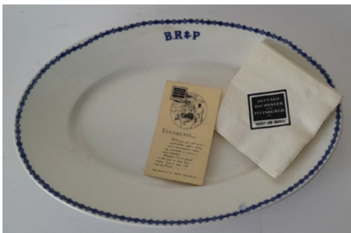
A $400 bid bought this Buffalo Rochester & Pittsburgh Railway Rochester pattern turkey platter with small crack.