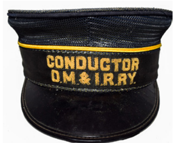
A Duluth Missabe & Iron Range conductor cap made by Wentworth-Forman sold for a high bid of $575.