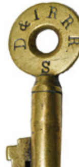
D&IRRR Tapered Key