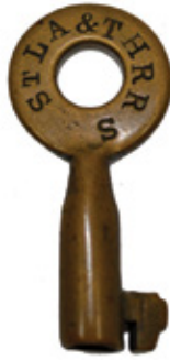
STL&ATHRR tapered key