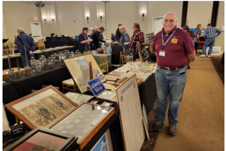
A large display of Delaware Lackawanna & Western Railroad memorabilia was a highlight of the show.