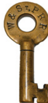
W&STPRR Tapered key