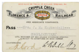
Passes Including Colorado