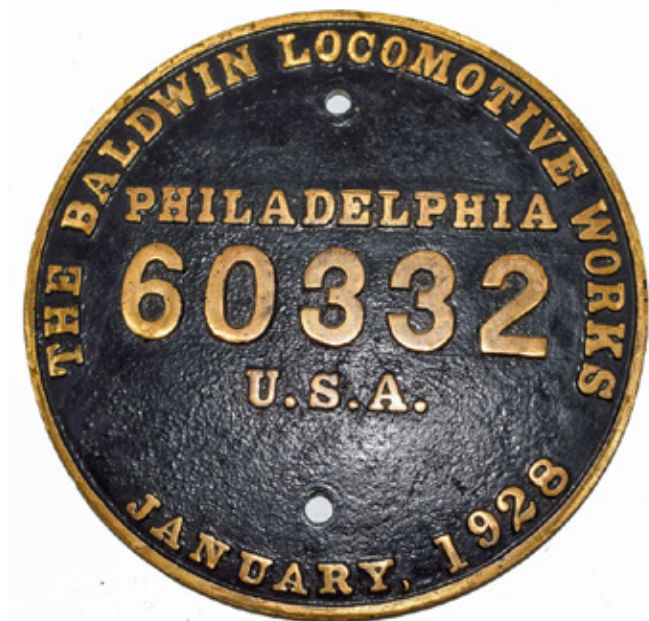
A $975 bid purchased this Santa Fe builder's plate from Baldwin Locomotive Works 4-8-4 No. 3756.