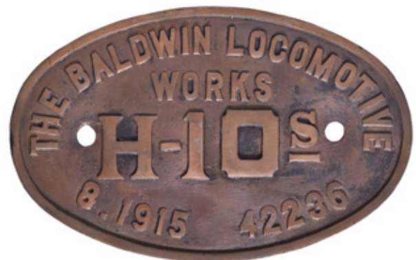
A $3100 bid was needed to buy this Baldwin Locomotive Works builders plate from Pennsylvania RR 2-8-0 #9889.