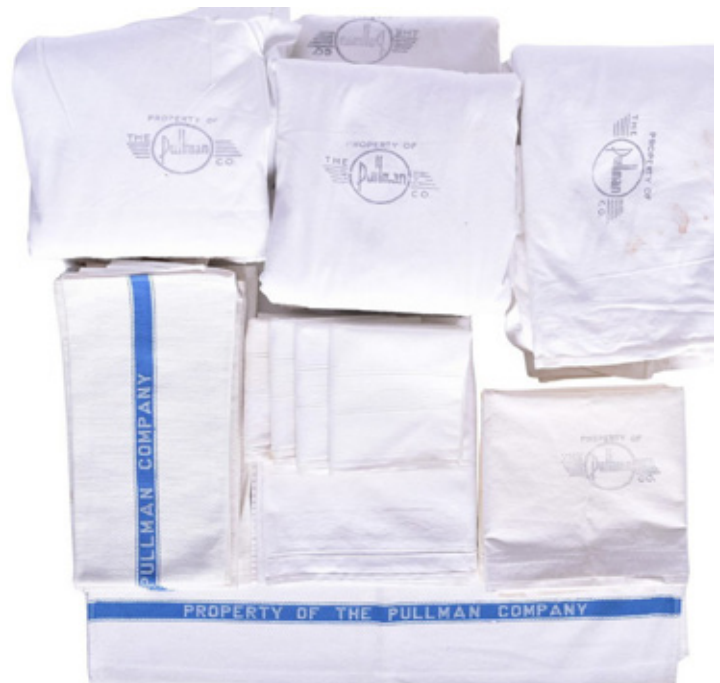
A collection of 25 Pullman linen tablecloths, napkins, hand towels, pillowcases and sheets sold for a $350 bid.