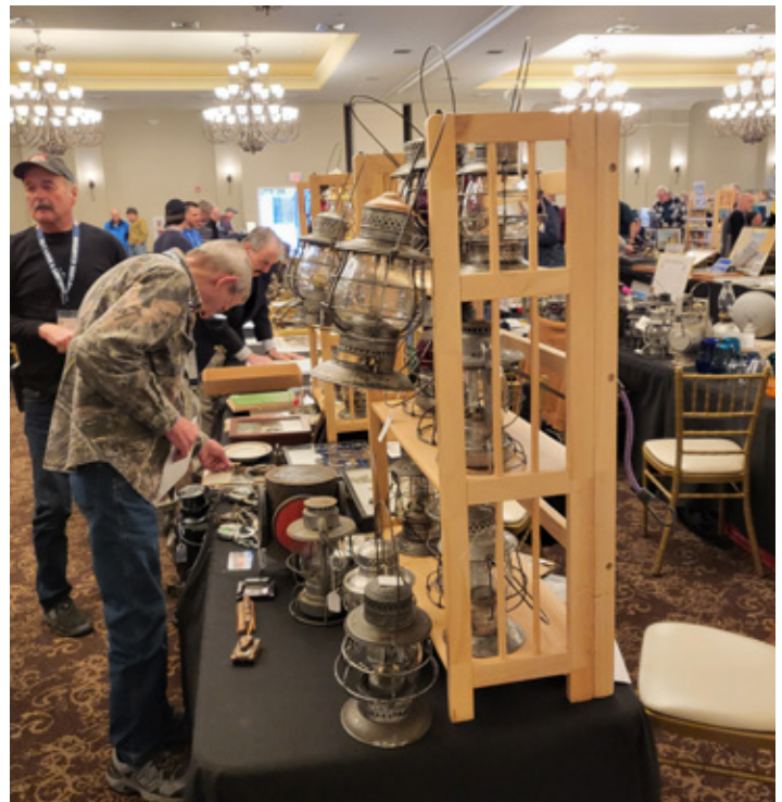
Everyone who attended the KL&L Convention had the opportunity to take home something for the collection.