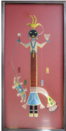
RARE Santa Fe Illuminated panel