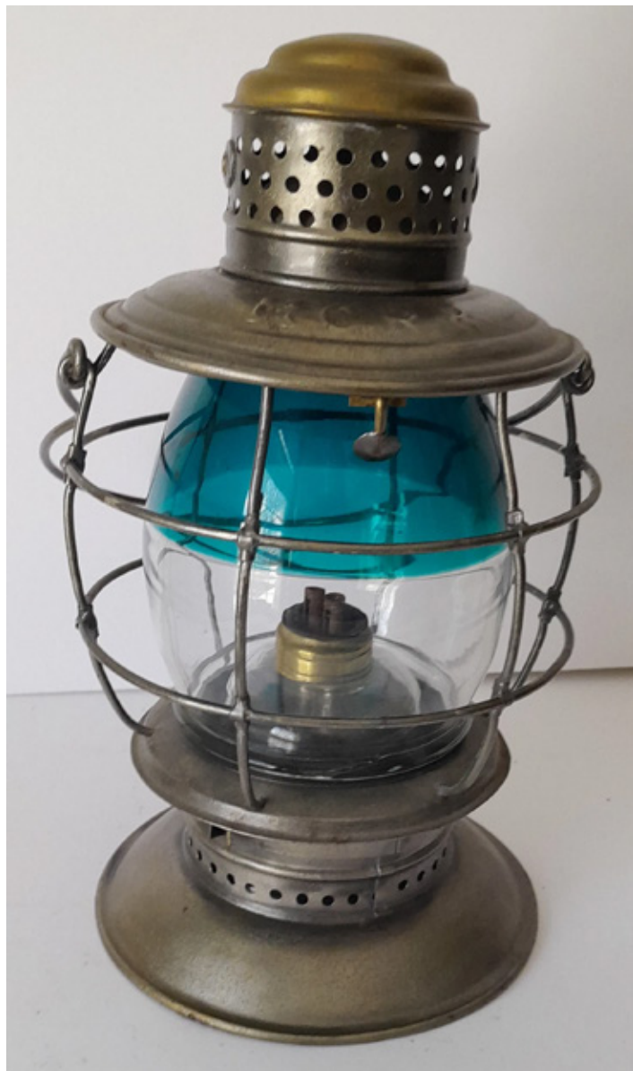
A $2100 bid took home this Maine Central Parmalee & Bonnell lantern with green over clear barrel globe.