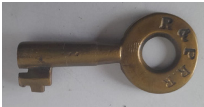
A Rochester & Pittsburgh Railroad key by Romer to go with the lock in a previous lot sold for a $1300 bid.