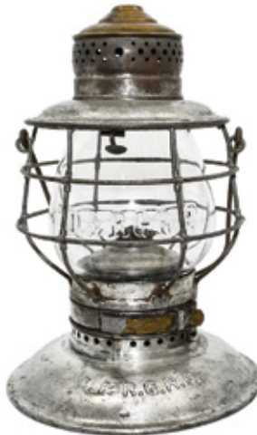
Beautiful D&RGRR BT/BB Lantern