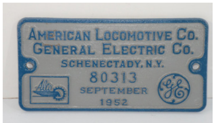
A $750 bid took home this Alco builder's plate from Delaware & Hudson Railroad RS3 No.4113.