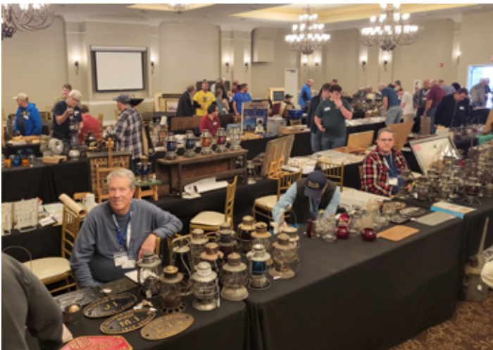
The Gravity Hall at the Hotel Anthracite was filled with over sixty tables of displays and memorabilia for sale.