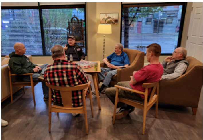
Lingering rain showers moved the Friday evening trading and bull sessions in from the courtyard to the lounge.