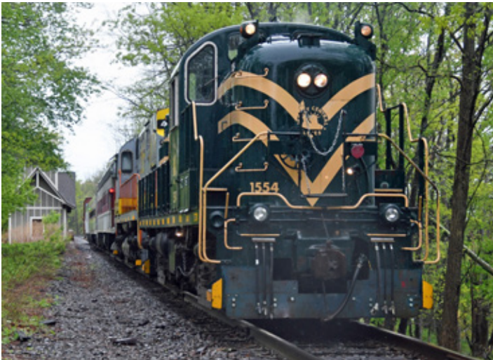
The Key Lock & Lantern excursion train makes a lunch stop at the Mount Pocono station platform.