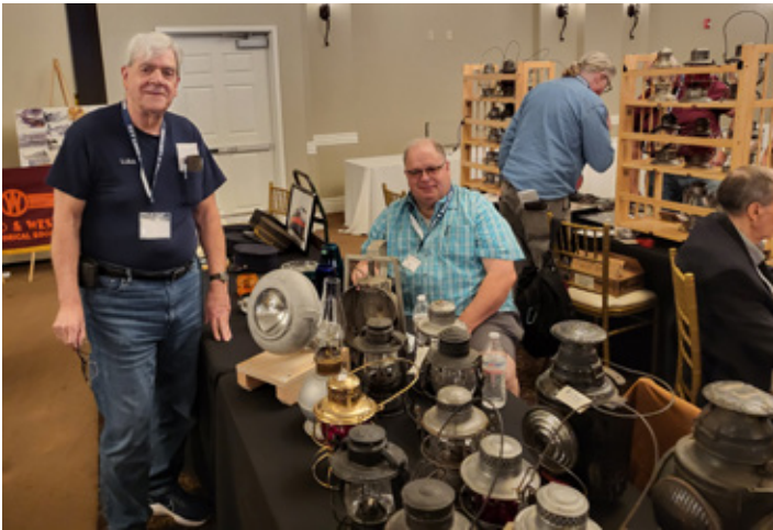
There were plenty of deals to be made with reputable sellers at the Key Lock & Lantern Convention.