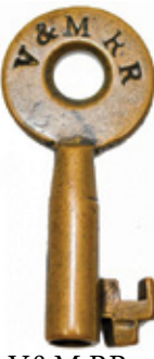
V&M RR Tapered key