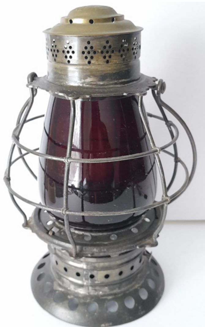
A $1600 bid took home this Brady's Patent lantern marked for the Portland Saco & Portsmouth Railroad.