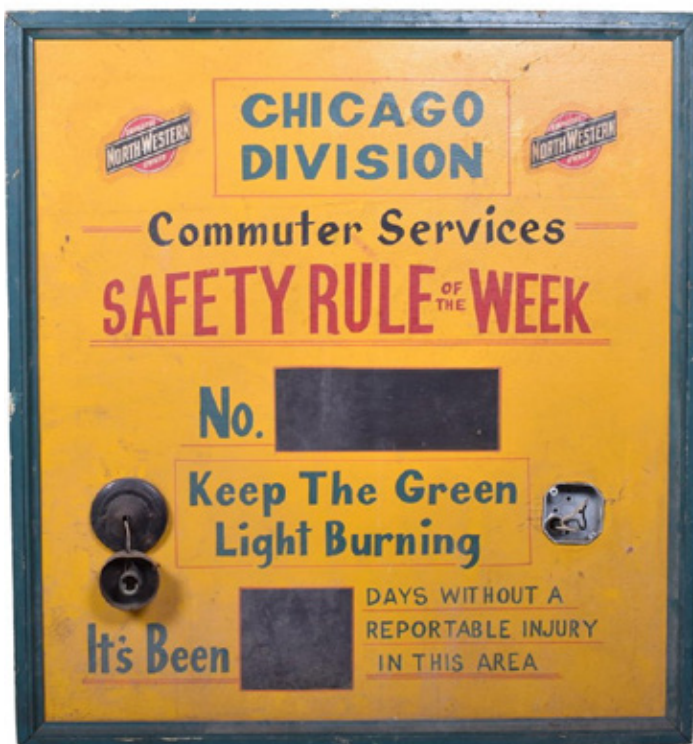
A bid of $775 was needed to buy this Chicago & North Western Railroad Commuter Services bulletin board.