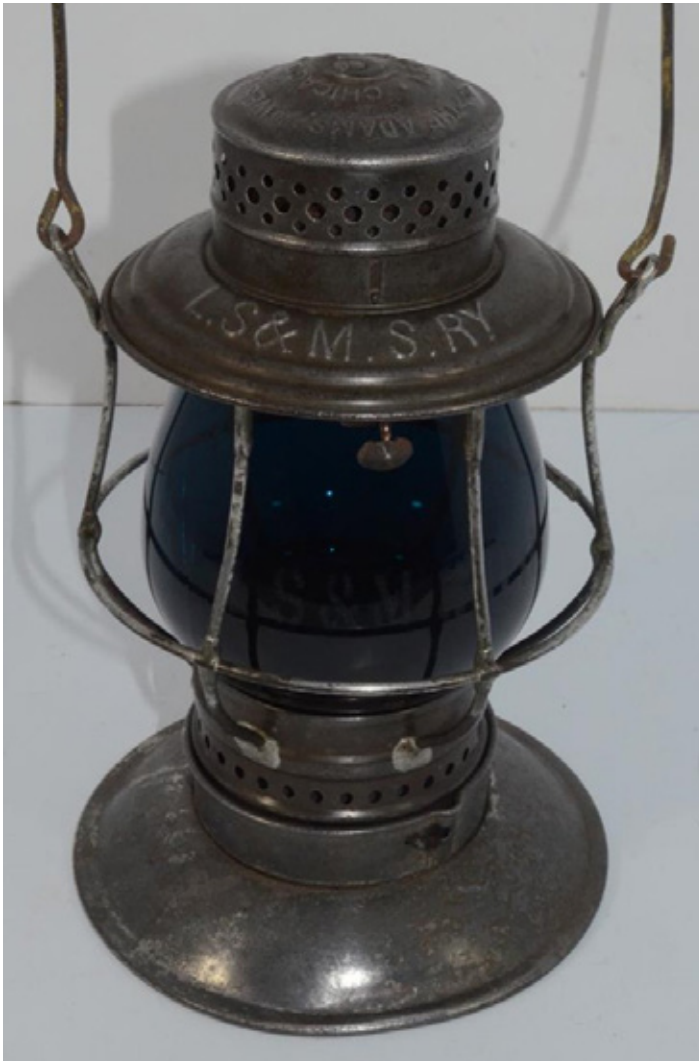
A Lake Shore & Michigan Southern bellbottom by Adams & Westlake with blue LS&MS etched globe sold for $160.