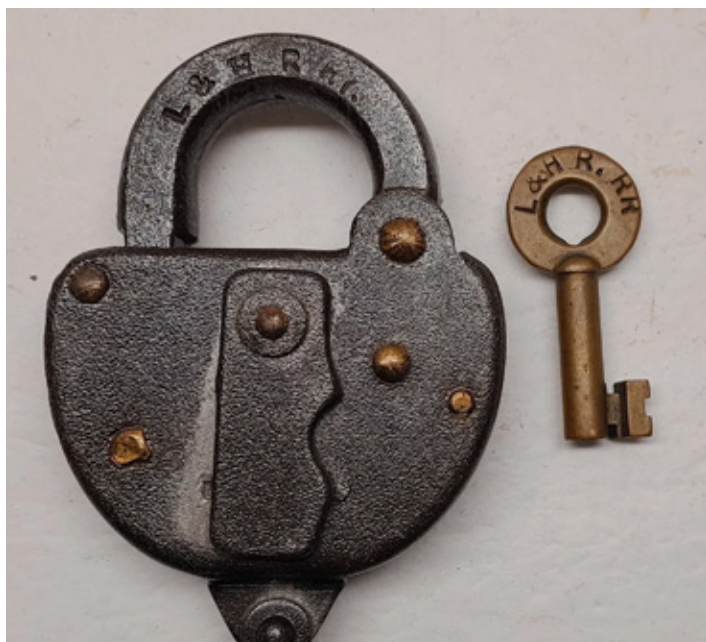
A Lehigh & Hudson River Railway lock by Fraim with an L&HR RR Adlake key sold for a $950 high bid.

A variety of rare and unusual railroadiana continues to flow through the Brookline Auction Gallery, with several large collections being sold. While many auctions have shifted to an online-only format, Brookline continues to hold onsite sales, with online bidding also offered. Photos, descriptions and prices realized courtesy of Brookline Auction Gallery and do not include buyers premiums and shipping.