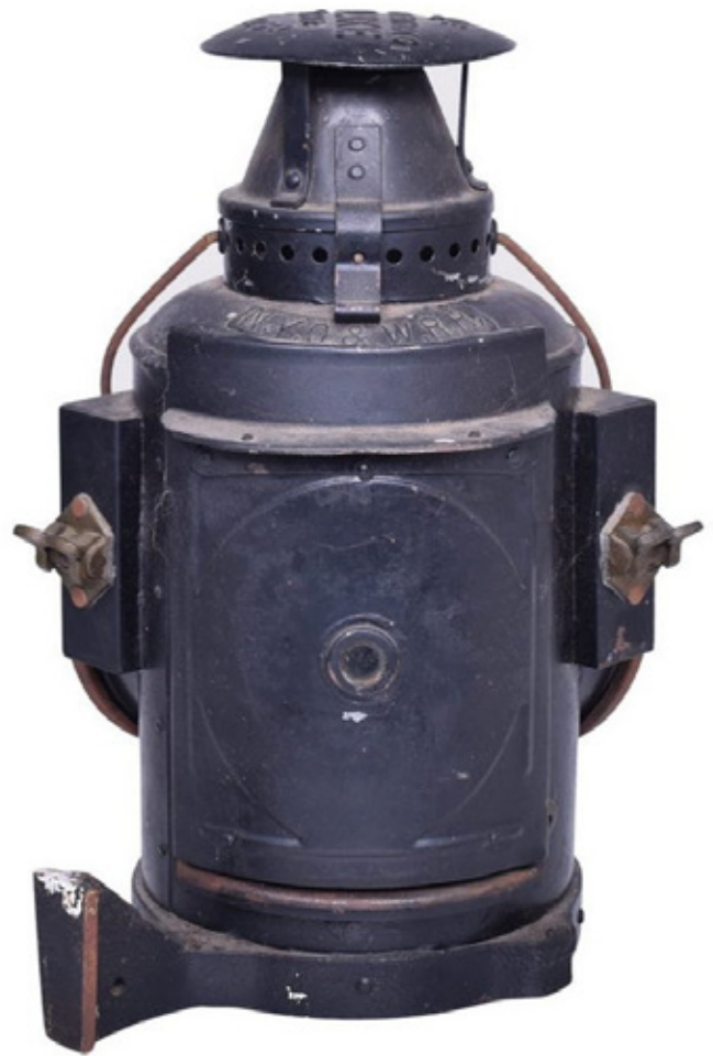
A New York Ontario & Western Railway Adlake classification lamp sold for a high bid of $550.