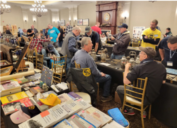
A huge variety of railroadiana was offered for sale or trade in the Hotel Anthracite Gravity Hall on Saturday.