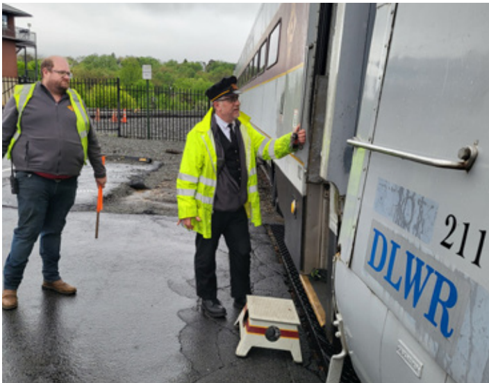
The Delaware-Lackawanna Railroad crew assists passengers as they disembark at Bridge 60.