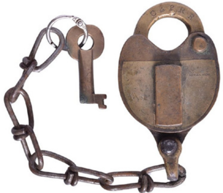
A Cleveland & Pittsburgh Railroad lock by Illinois Manufacturing and unmarked key sold for a $400 bid.