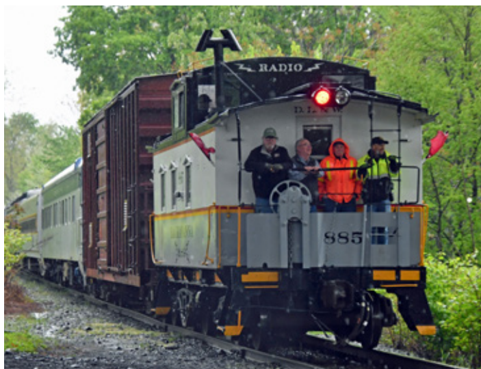
Rainy weather didn't stop KL&L excursions passengers from enjoying a ride on the back platform.