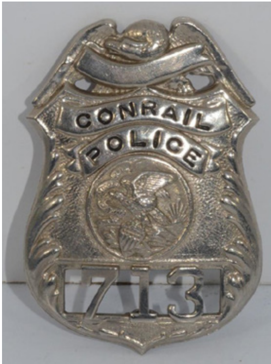
A Conrail railroad police badge made by Edelmanns of Farmingdale, NY sold for a high bid of $140.

The spring auction by JM Hobby Supply & Railroad Artifacts had something for every collector, from top shelf memorabilia to reasonably priced lots. A large collection of model trains rounded out the two day sale. There are more collections on deck for the spring auction, and consignments are still being accepted for upcoming sales. Photos, descriptions and prices realized courtesy of JM Hobby Supply & Railroad Artifacts and do not include buyers premiums and shipping.