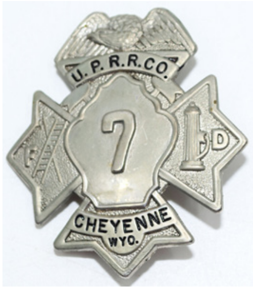
A Union Pacific Railroad Cheyenne Wyoming fire department badge went to a new home for $600.

Railroad Memories continues to offer high end railroadiana in its catalog and online auctions, with several well known collections gradually being dispersed to new owners. There is much more to come in upcoming sales, with the usual selection of western material and some from the east coast. Photos, descriptions and prices realized courtesy of Railroad Memories Auctions and do not include buyers premiums and shipping.