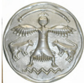
Santa Fe Kachina Plaque