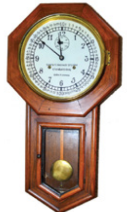
Santa Fe Crews Quarter Clock