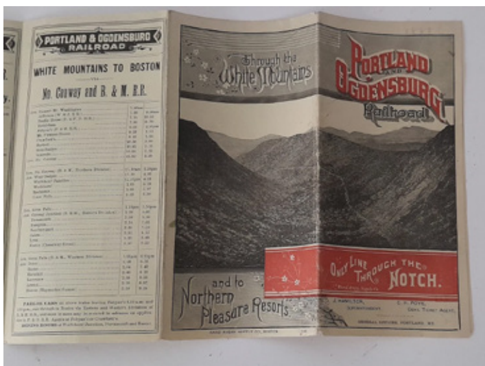
A 14-panel color Portland & Ogdensburg Railroad timetable from 1885 sold for a $400 high bid.