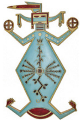
Santa Fe Mother Earth Kachina