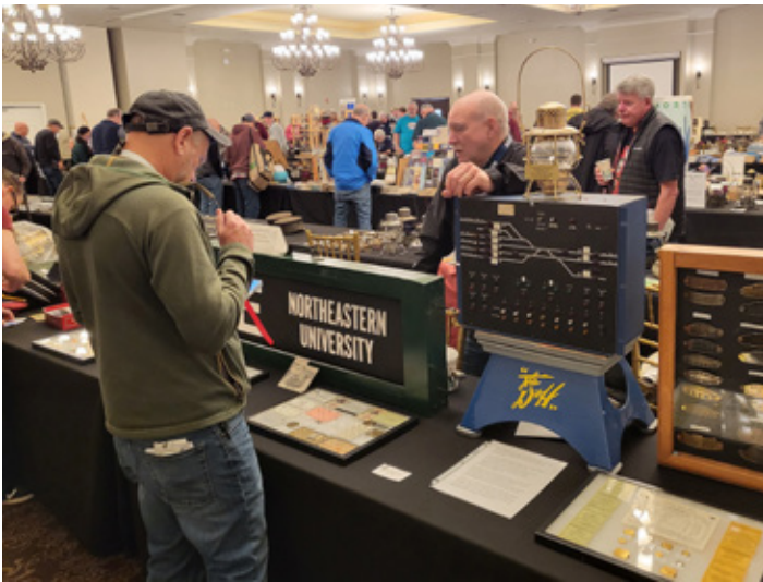
There were many excellent exhibits at this year's convention, with a mix of old and modern subjects.