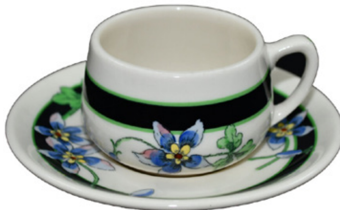
A Union Pacific Columbine pattern demitasse set by Onondaga Pottery of Syracuse sold for $1850.