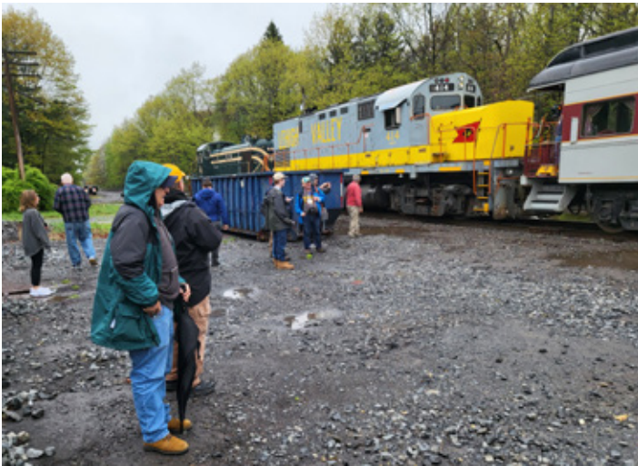
Excursion passengers detrain at the Pocono Summit station for a photo runby on the return trip.