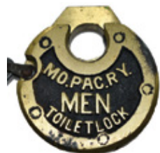
More Locks from the Kidd Museum