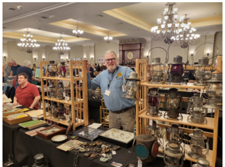
Key Lock & Lantern members offered a variety of railroadiana for sale at the Saturday show.