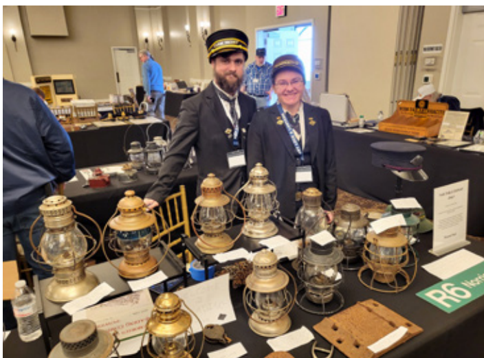
An exhibit of a variety of conductor's lanterns was one of many excellent displays at this year's convention.