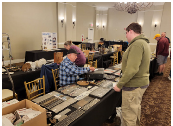
Experts in their specialty areas of collecting exhibit at the Key Lock & Lantern Convention show on Saturday.