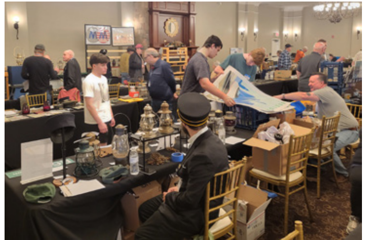
The doors are open and it is time to make some deals at the Key Lock & Lantern show on Saturday.