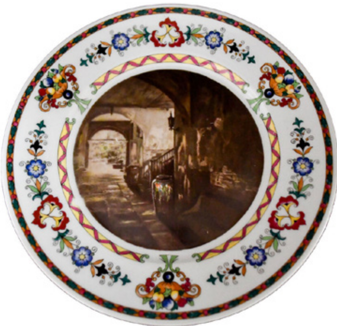
A $1050 bid was needed to buy this Illinois Central Railroad 10 3/4" French Quarter service plate by Bauscher.