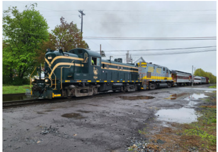
The rain changed to a light drizzle in the late afternoon, just in time for the photo runby at Pocono Summit.