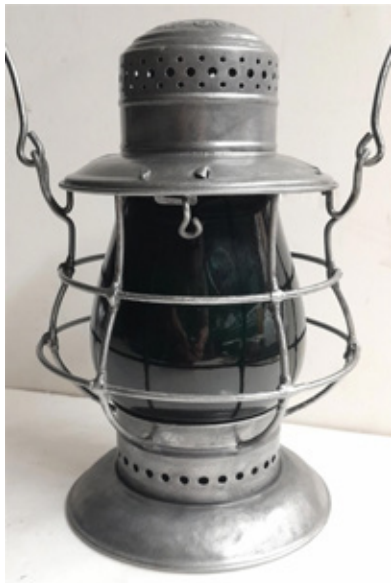
Lehigh & Hudson River Lantern: Sold for $4600