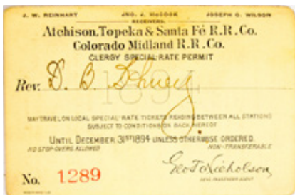
AT&SF & Colorado Midland 1894 Joint Annual Pass: $1,900