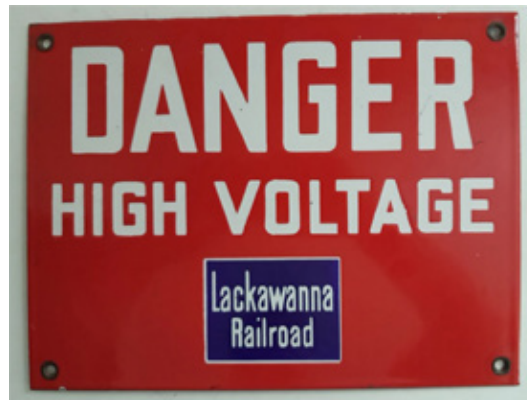
Lackawanna Railroad High Voltage Catenary Sign: Sold for $1000