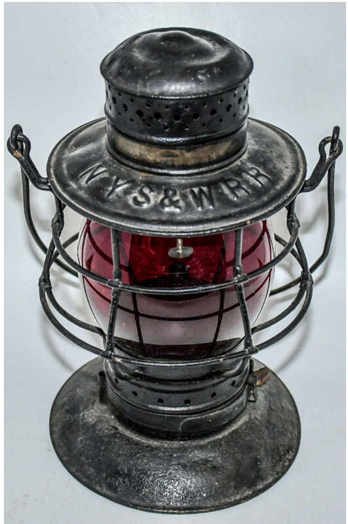
Eastern collectors showed some love, bidding this New York Susquehanna & Western lantern by Star up to $4200.