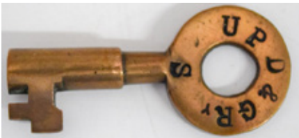
Union Pacific Denver & Gulf Railway Switch Key: $8,750