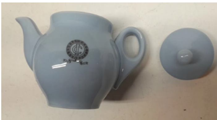
An Illinois Central Railroad Creole Blue pattern coffee pot by Bauscher sold for a high bid of $275.