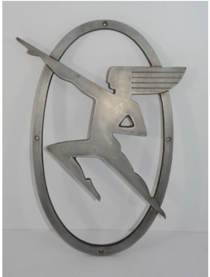
An aluminum Hiawatha logo from a Milwaukee Road passenger car went to a new owner for $2300.

The fall auction by JM Hobby Supply & Railroad Artifacts had something for every collector, from top shelf memorabilia to reasonably priced lots. A large collection of model trains rounded out the two day sale. There are more collections on deck for the spring auction, and consignments are still being accepted. Photos and prices realized courtesy of JM Hobby Supply & Railroad Artifacts and do not include buyers premiums and shipping.