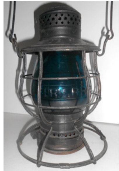
Erie Lantern With Green Cast Globe: Sold for $2000