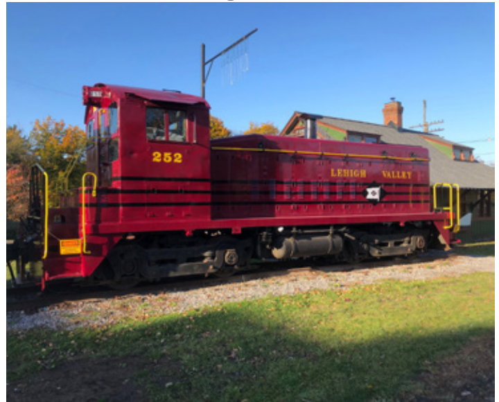
A recently restored Lehigh Valley locomotive on display at the WNYRHS Williamsville, NY depot museum.

members of KL&L) are expected to attend. There is usually some interesting memorabilia to be found among the many tables, and some good deals for those who arrive early.