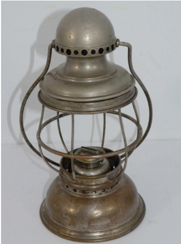
A $475 bid was needed to buy this Post & Co. No. 2 conductors lantern, with fount but without globe.