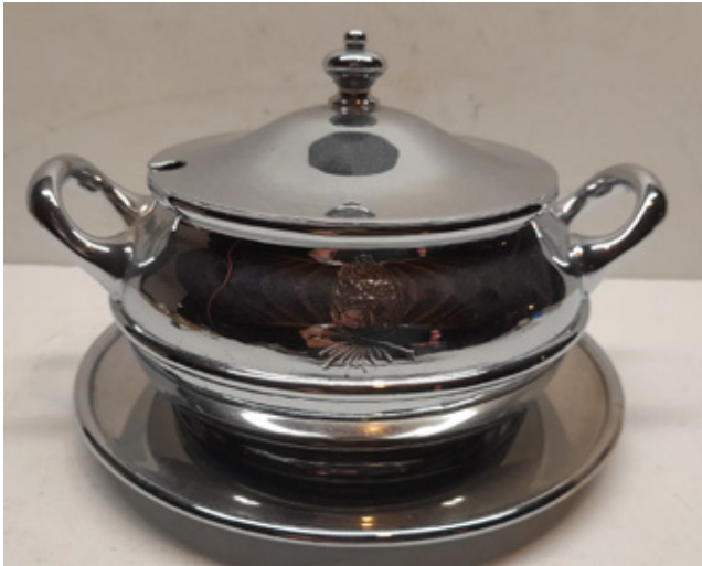
A Maine Central silver plate tureen with pine cone logo by Rogers Brothers sold for a high bid of $1550.

A variety of rare and unusual railroadiana continues to flow through the Brookline Auction Gallery, with several large collections being sold. While many auctions have shifted to an online-only format, Brookline continues to hold onsite sales, with online bidding also offered. Photos and prices realized courtesy of Brookline Auction Gallery and do not include buyers premiums and shipping.