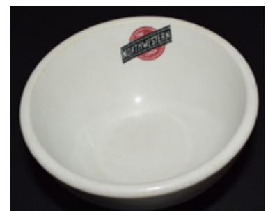
Chicago & Northwestern "Lunch Room" Bowl by Shenango: $975