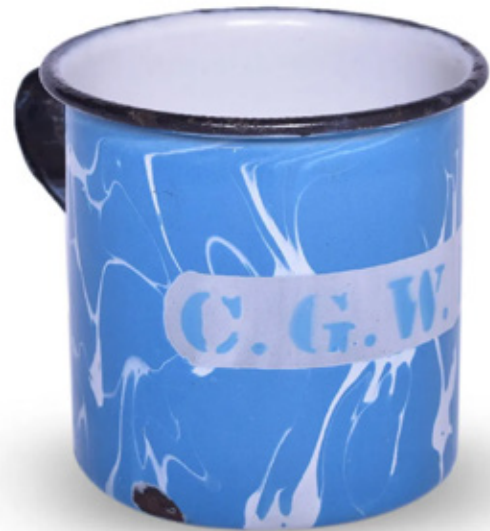
A Chicago Great Western graniteware marbled porcelain drinking cup went to a new home for a $500 bid.

KEY LOCK & LANTERN Ads Reach Serious Collectors Contact KL&L at transportsim@aol.com