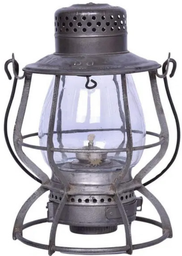
A $2250 bid was needed to buy this Keystone Casey lantern from the Atlantic & North Carolina Railroad.