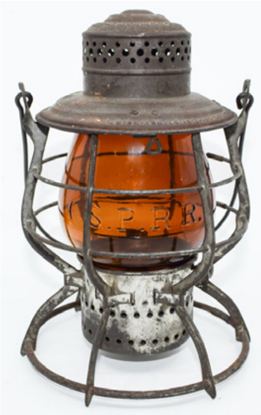
Southern Pacific Adams & Westlake with Amber Cast SPRR Globe: $14,250