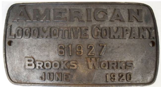
An Alco Brooks Works builders plate from Union Pacific Mikado steam locomotive No. 2298 sold for $1550.