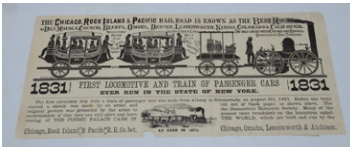
A Chicago Rock Island & Pacific advertisement featuring New York's Dewitt Clinton locomotive sold for $160.