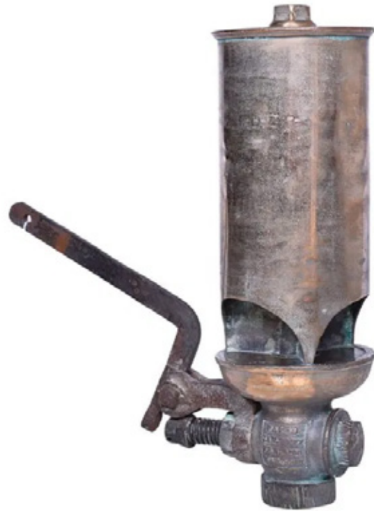
A 20" inch 3-chime Crosby steam locomotive engraved as a gift from the Southern Railway sold for $11,250.