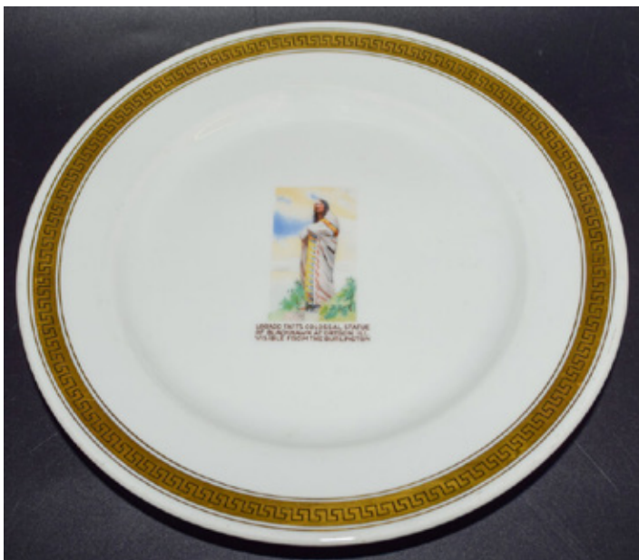
A Chicago Burlington & Quincy Blackhawk service plate by Bauscher sold for a high bid of $5750.