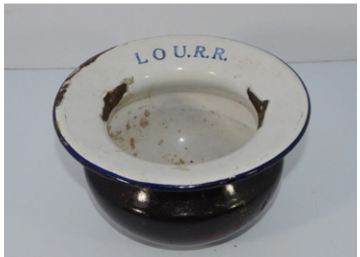
A $70 high bid took home this Louisville & Nashville Railroad porcelain spittoon with typical moderate wear.