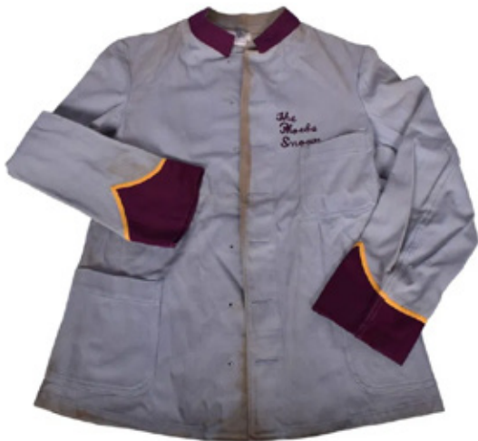
A Lackawanna Railroad Phoebe Snow waiter's jacket with stains and missing buttons still sold for $225.