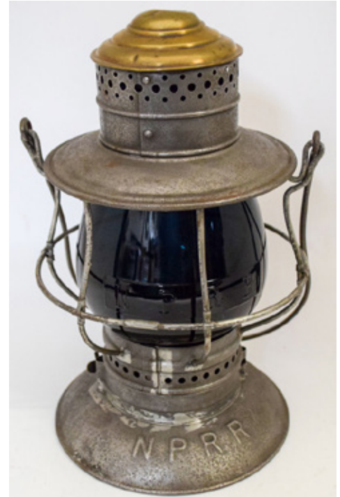
Northern Pacific by SG&L with Green Cast NPRRGlobe: $5,000