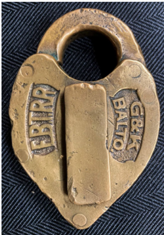
A $425 bid purchased this East Broad Top Railroad brass heart lock by G&K of Baltimore, Maryland.