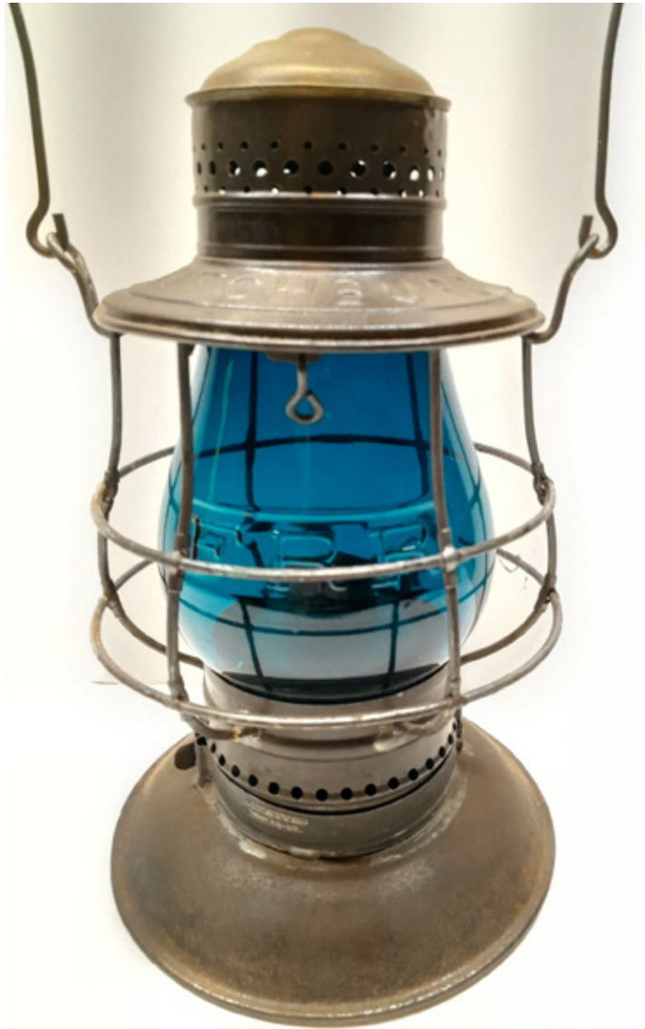
A Fitchburg brass top bell bottom lantern by CT Ham with "FRR" green cast globe sold for a reasonable $900.