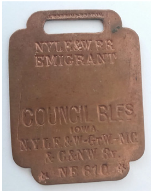
A $400 bid purchased this New York Lake Erie & Western RR Emigrant baggage tag to Council Bluffs, Iowa.