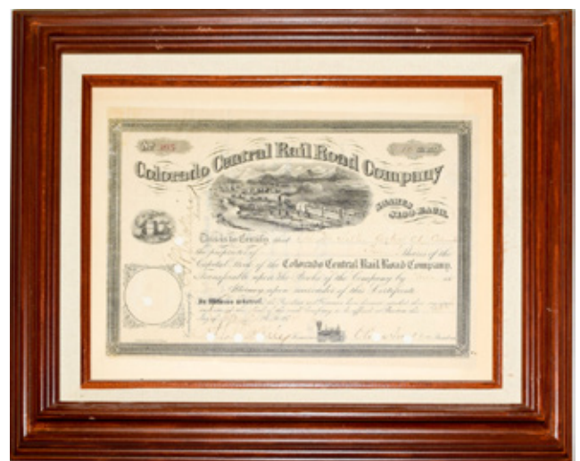
A $230 high bid purchased this framed 1874 Colorado Central Railroad Company stock certificate.