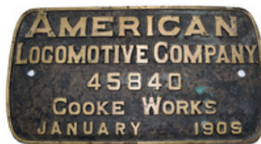
CM&STP RY Cooke Works Builders Plate: $2,300