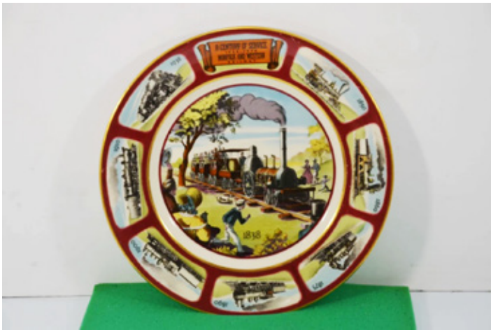
A $210 high bid took home this Norfolk & Western Railway Centennial service plate by Lamberton - Scammell.