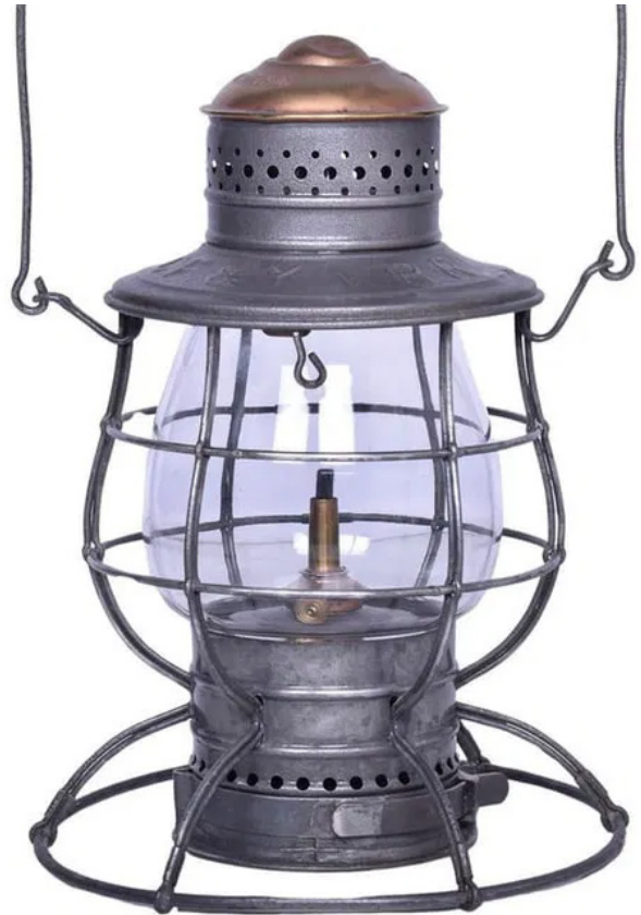
A $3300 bid purchased this Cape Fear & Yadkin Valley Railroad No.39 brass top wire bottom lantern by Ham.