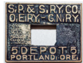
SP&S / OERY / GNPY Dater Die from Portland, Oregon: $1,000