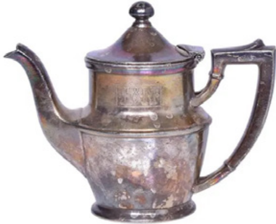
A Louisville & Nashville logo silver teapot by International Silver was purchased for a high bid of $550.

Rail & Road Auctions is not slowing down, with live online auctions held monthly, featuring memorabilia of every sort from all over the country. From higher end artifacts to bargain lots for newer collectors, there has been something for everyone in recent auctions, with plenty to come in upcoming sales. Photos and prices realized courtesy of Rail & Road Auctions and do not include buyers premiums and shipping.