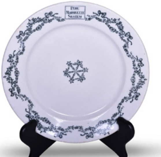
A $1400 bid was needed to purchase this Pere Marquette System logo 9" dinner plate by Syracuse China.