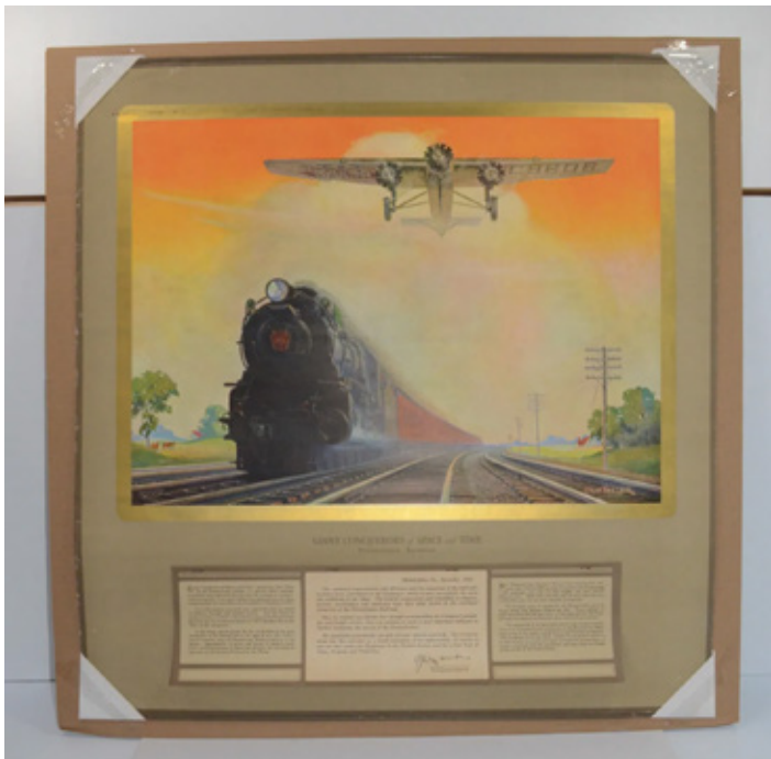
A 1931 Pennsylvania Railroad Griff Teller calendar with complete date pad went to a new collection for $375.