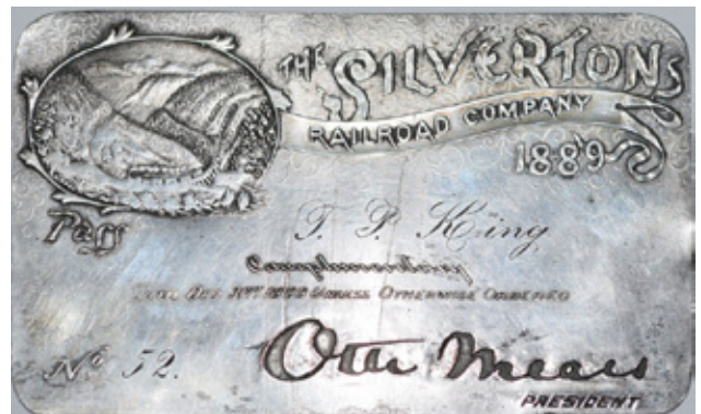
West was still best, with this 1889 Otto Mears silver pass from the Silverton Railroad bringing $3900.