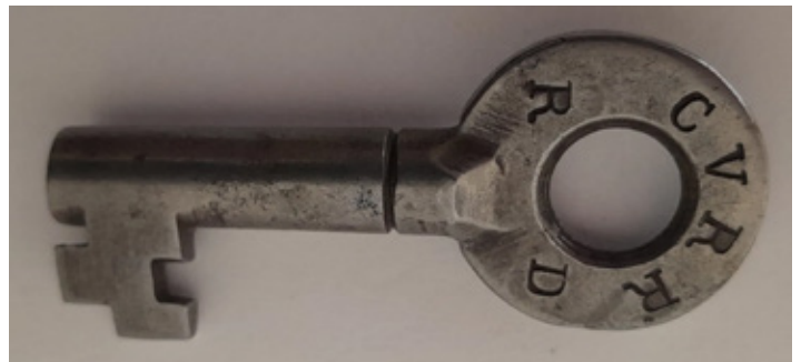
A $475 bid was needed to take home this steel switch key by Bohannon from the Central Vermont Rutland Division.