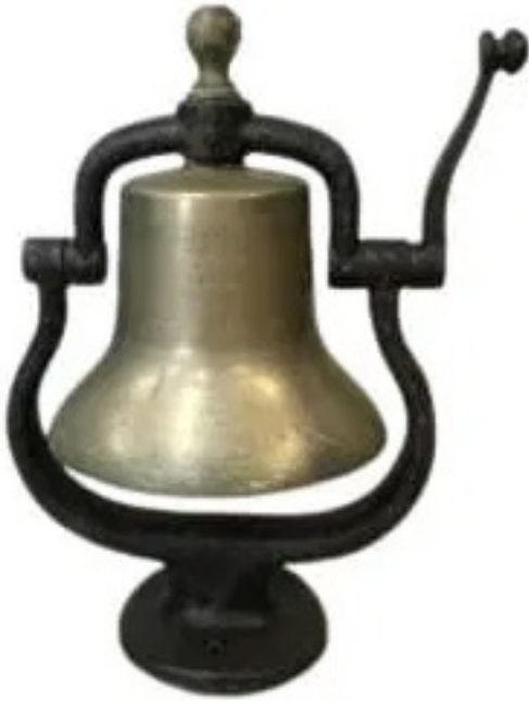
A 15" bronze bell, believed to be from a Southern Railway steam locomotive, sold for a high bid of $1500.