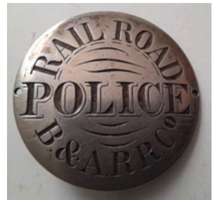
Boston & Albany Police Badge: Sold for $375