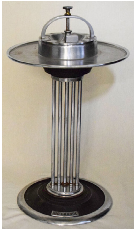
A parlor car smoking stand with Rio Grande tag on the base went to a new collector for a $920 bid.

Railroad Memories continues to offer high end railroadians in its catalog and online auctions, with several well known collections gradually being dispersed to new owners. There is much more to come in upcoming sales, with the usual selection of western material and some from the east coast. Photos and prices realized courtesy of Railroad Memories Auctions and do not include buyers premiums and shipping.