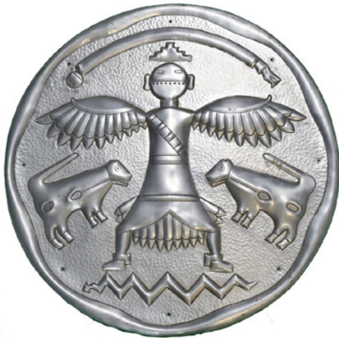
A 23" aluminum Santa Fe lounge car Kachina plaque went to a new home for a high bid of $8250.