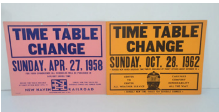
A $60 bid was needed to buy this pair of New Haven Railroad timetable change announcement placards.