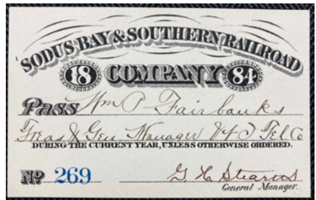
An $1150 bid sent this 1884 Sodus Bay & Southern Railroad annual pass home to a new owner.