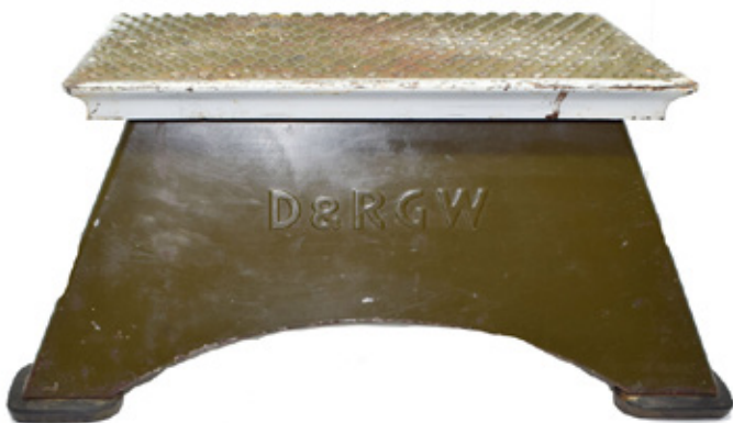
A $420 bid was needed to purchase this Denver & Rio Grande Western Railroad metal step box.