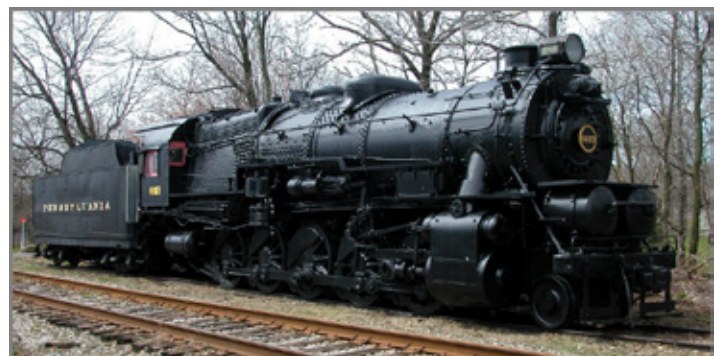
The society's cosmetically restored Pennsylvania Railroad I-1s Class Baldwin decapod steam locomotive No. 4483.

The show is open from 10am to 5pm on Saturday and from 10am to 4pm on Sunday, with an $8 entry fee for adults and children under 12 admitted for free. All proceeds will benefit the many significant preservation projects of the Western New York Railway Historical Society, which operates the Heritage DiscoverY Center in Buffalo and has restored depots and rolling stock at several locations in western New York. For more information, visit the WNYRHS website at