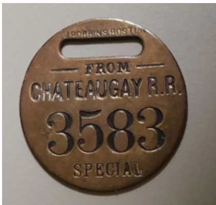
Chateaugay Railroad Baggage Tag: Sold for $425