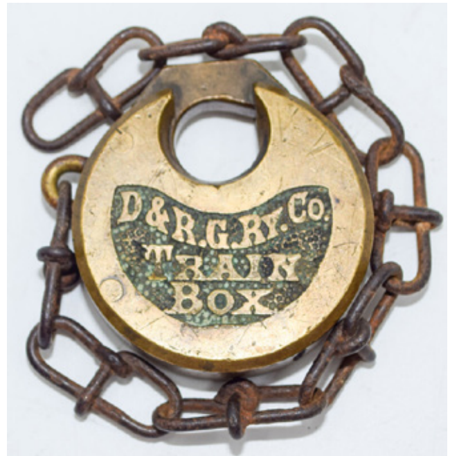
A $3700 bid sent this Denver & Rio Grande Railway Train Box six lever lock by Miller home to a new collection.