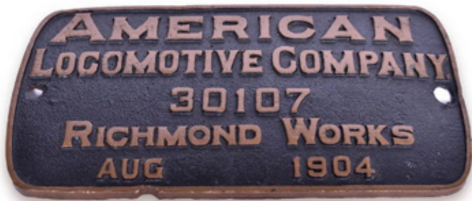
A $2850 bid purchased this Alco Richmond Works builders plate from Winston Salem Southbound engine #716.