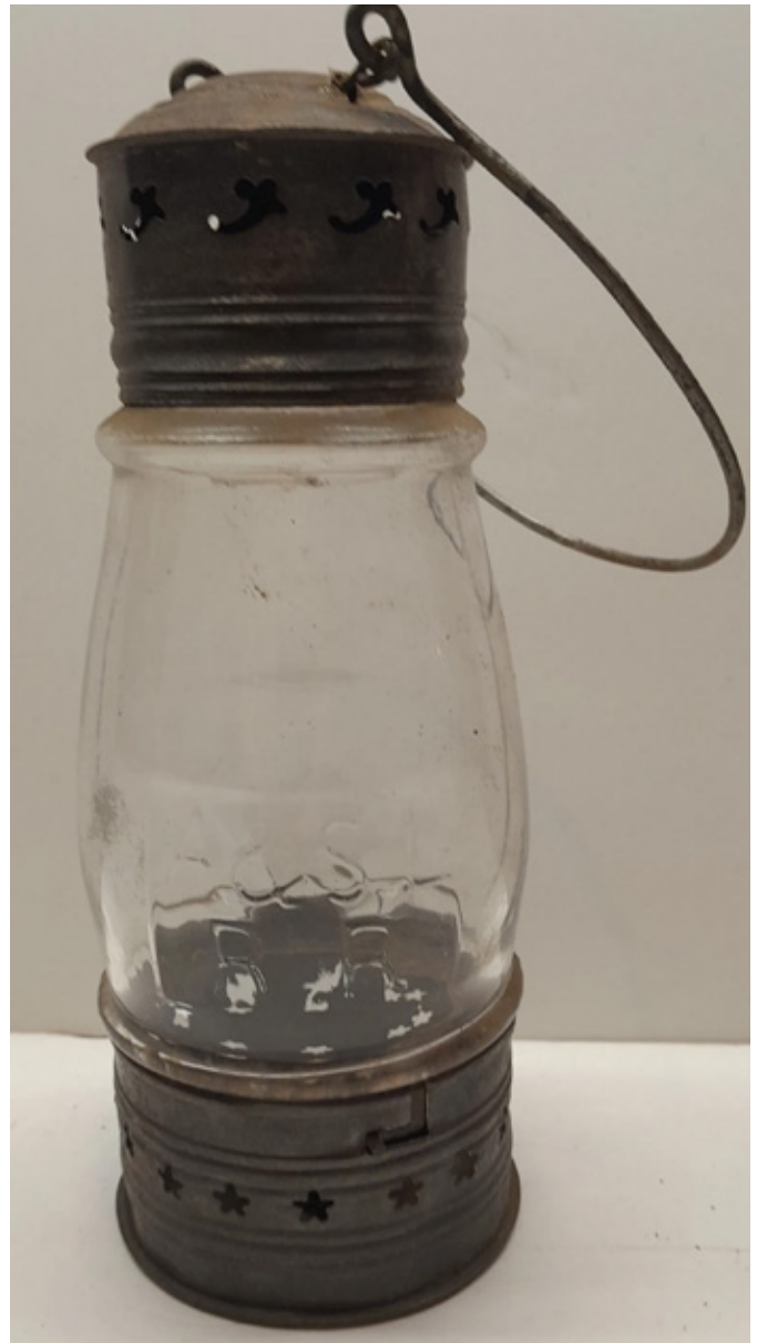
An Atlantic & Saint Lawrence Railroad fixed globe lantern by New England Glass sold for a high bid of $775.