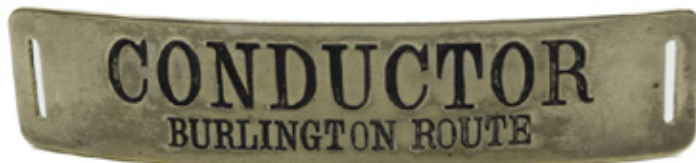
A $380 bid was needed to purchase this Burlington Route Conductor cap badge with no makers marks.