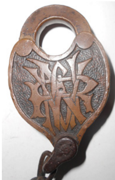
Northern Central Railway Lock: Sold for $2100