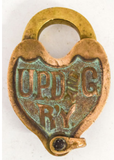
Union Pacific Denver & Gulf Railway by Union Lock & Hardware: $11,750