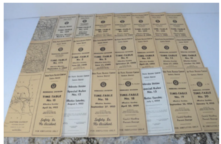
A $140 bid purchased an instant collection of Union Pacific Railroad Nebraska Division employee timetables.