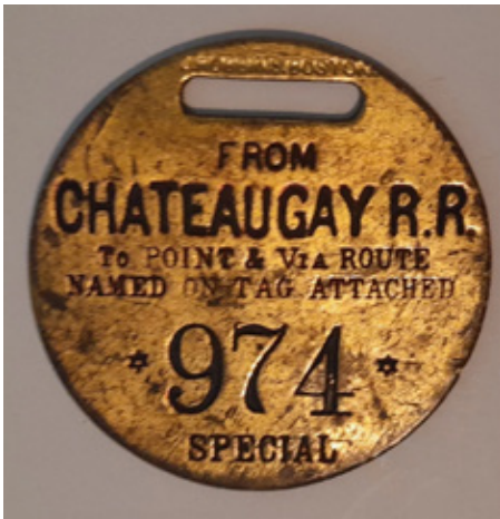
A baggage tag from Adirondack Mountain shortline Chateaugay Railroad sold for a $300 high bid.