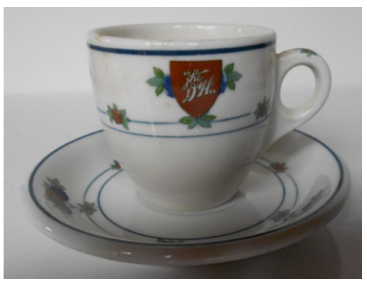
A $200 bid was needed to purchase this Delaware & Hudson Railroad demitasse set by Syracuse.