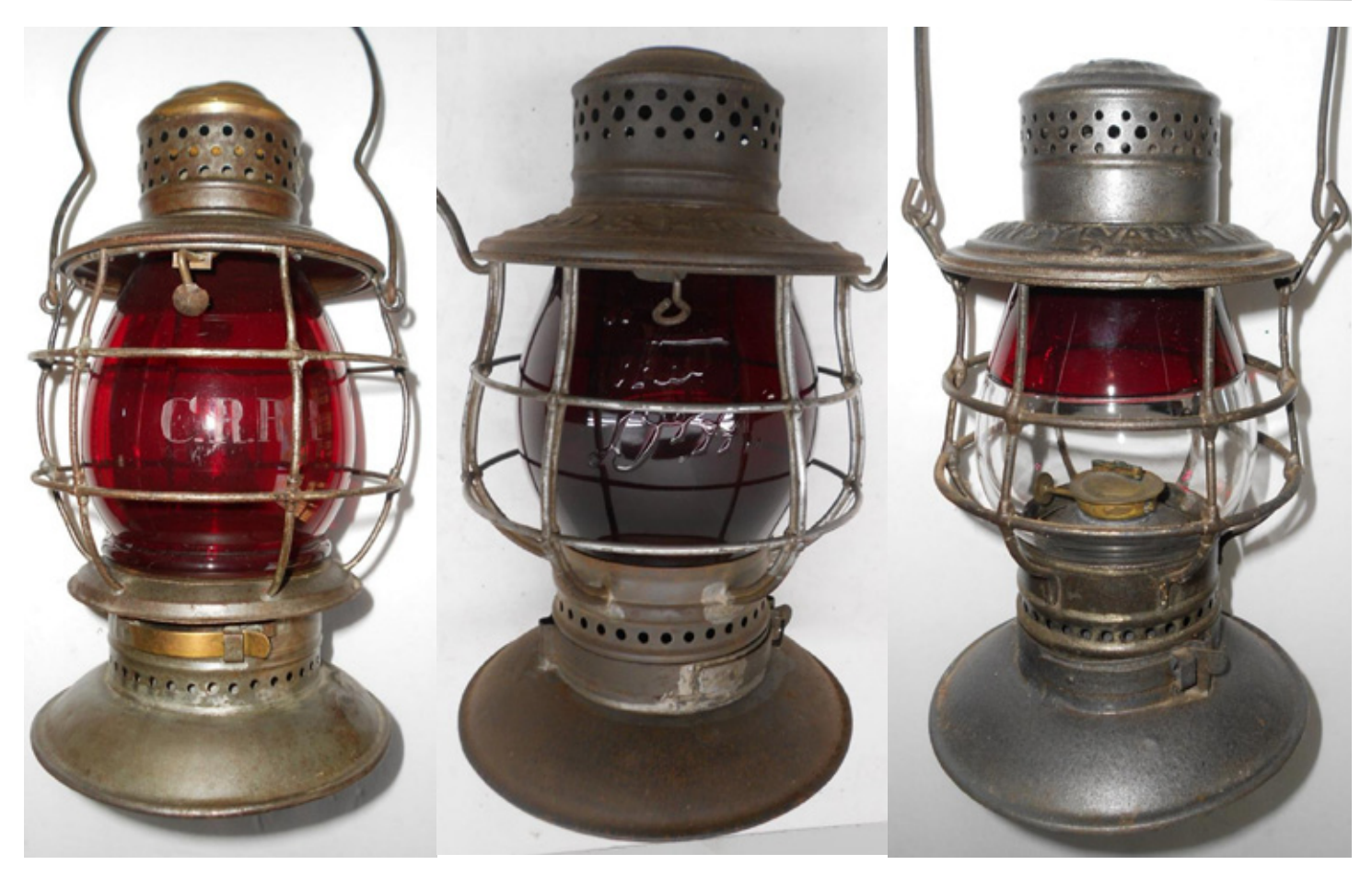
A Parmelee & Bonnell lantern with CRR markings hammered out and red cut Connecticut River globe ($425), A Delaware & Hudson CT Ham with red cast logo globe ($275) and a red over clear globe in Pennsylvania Lines A&W frame ($1400).