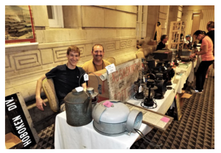
There were many different varieties of railroad memorabilia for sale or trade at the show, from hardware to paper.