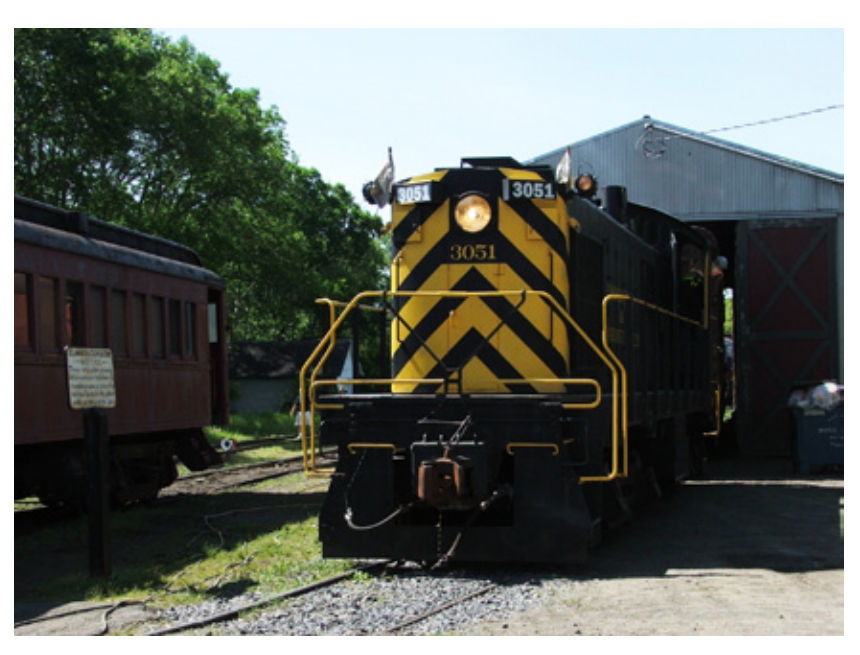
The LRHS shop will be open for viewing during the 2018 Railfan Day on August 4th at the Cooperstown & Charlotte Valley RR in Milford.

The DO engine house in Milford is now used by members of the LRHS to restore equipment and return it to service. While a ride on one of the many special themed trains is always enjoyable, the best time for a serious railroad history buff to visit is during the museum's annual railfan day.