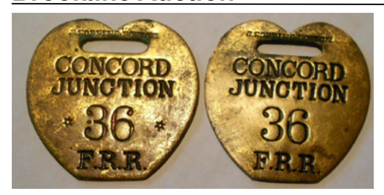
One of several matching pairs of baggage tags, this set from Concord Junction on the Fitchburg sold for $190.