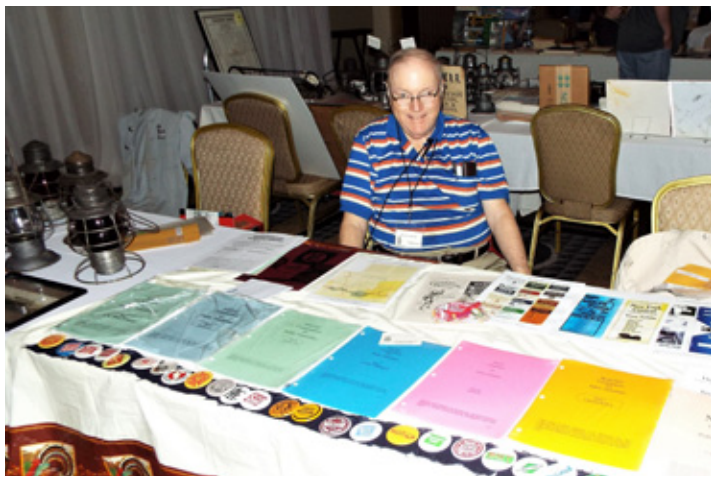
The National Association of Timetable Collectors offered timetable compendiums and memberships in the group.