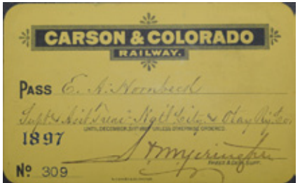
1897 Carson & Colorado Pass