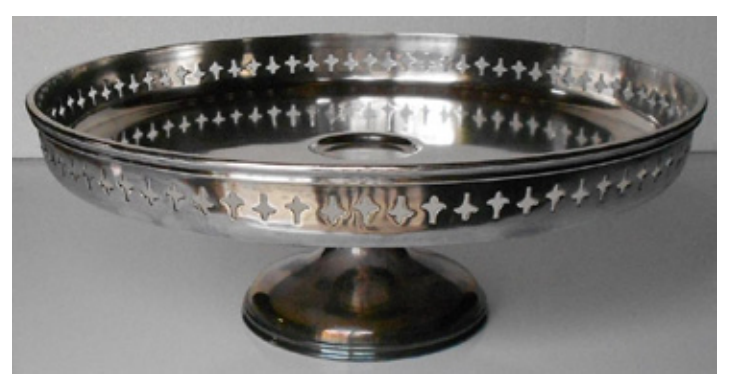
A rare Boston & Maine silverplate cake stand with Minuteman logo by Reed & Barton sold for $950.