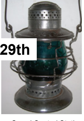
Grand Central Station Lantern with Green Cast Globe: $3100, New York New Haven & Hartford - Hartford Division Thompson: $2500