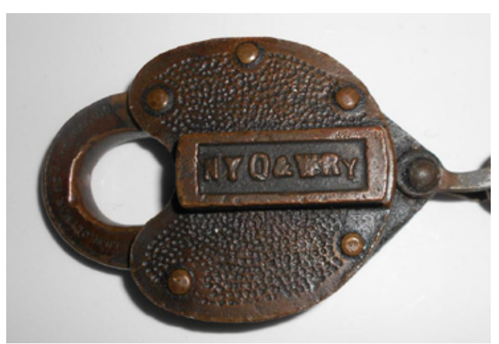
A New York Ontario & Western Railway brass heart lock by JMW Climax brought a high bid of $130.