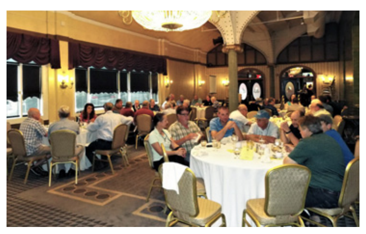
The Saturday night banquet and railroad history programs were held in the station's Platform Lounge.