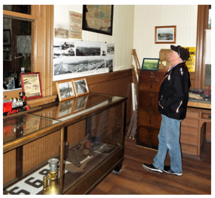
Passengers on the Pocono Mountain Express enjoyed displays of railroadiana at the Tobyhanna Station Museum.