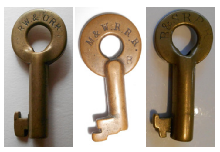
Rome Watertown & Ogdensburg ($100), Montpelier & Wells River ($110) and Bridgeton & Saco River ($110).