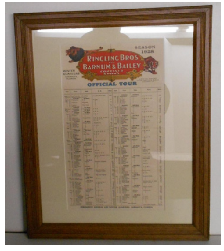
A scarce Ringling Brothers, Barnum & Bailey circus train schedule from 1928 sold for a high bid of $140.