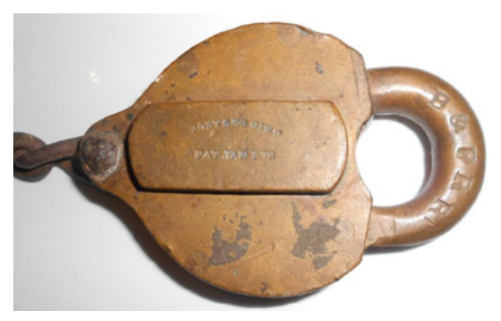
A Post & Company brass switch lock believed to be from the Baltimore & Potomac Railroad sold for $140.