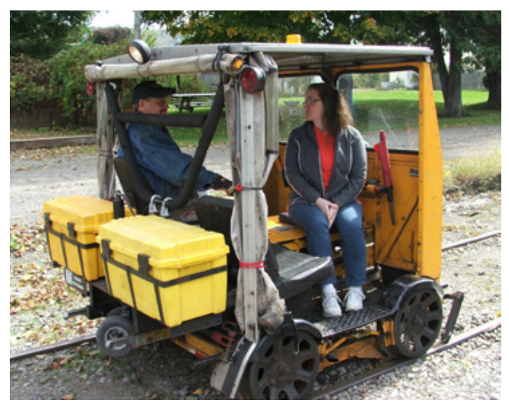
Track speeder rides are among the activites offered at Railfan Day on the Cooperstown & Charlotte Valley RR.

Today, the former Milford depot has been renovated to serve as the Leatherstocking Railway Historical Society's museum, and a variety of rolling stock has been acquired.