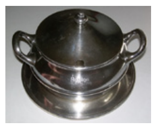
Boston & Maine RR Silver Casserole Dish: $800