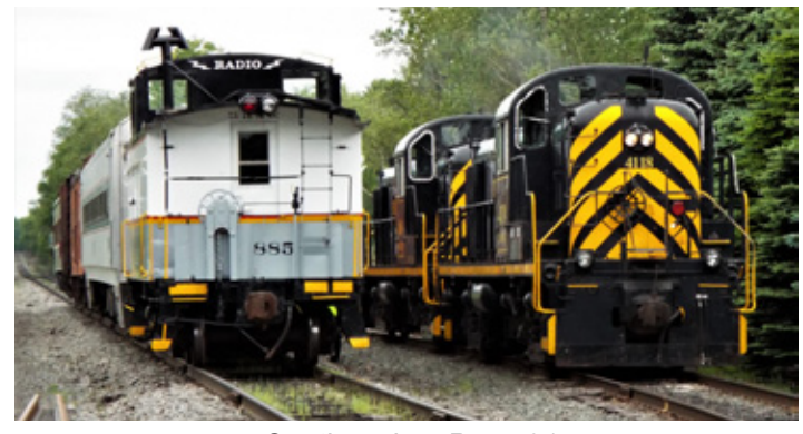
Continued on Page 21