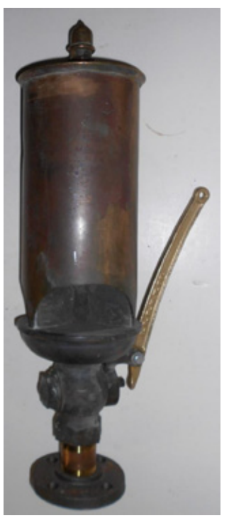
A couple of scarce artifacts: Lehigh & New England RR single lens lamp ($300) and a 13" high Crosby Steam Guage & Valve Company 1877 patent whistle ($1400).