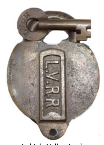
Lehigh Valley Lock