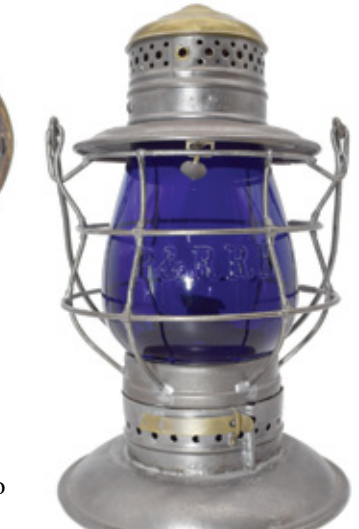
P&RRR Cobalt BTBB