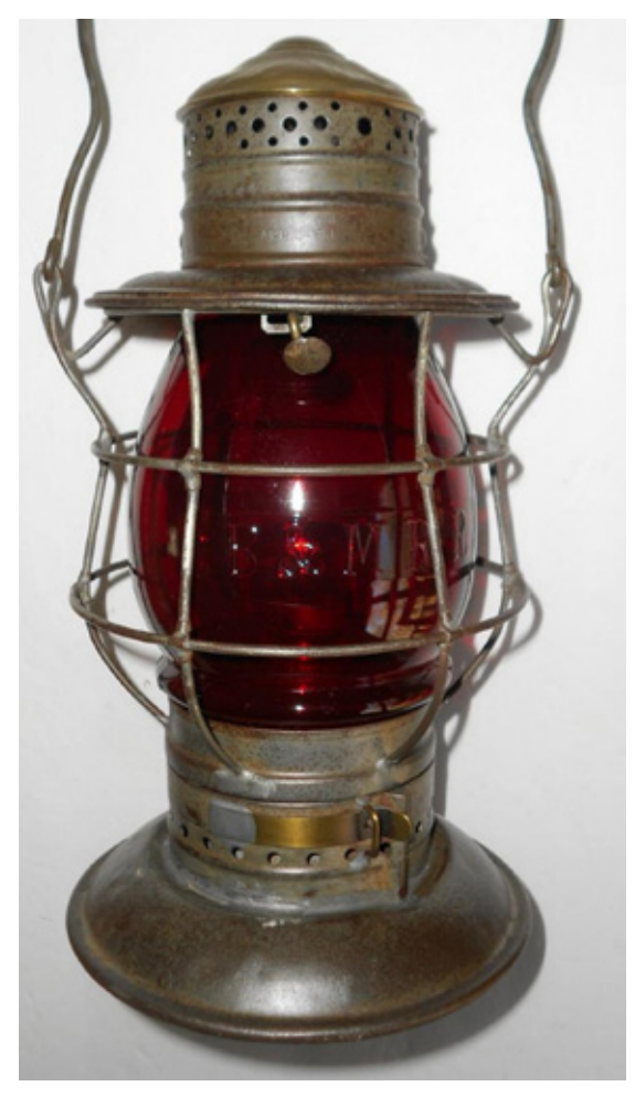
A Boston & Maine brass top bellbottom lantern with a red flashed 6" globe cast B&MRR sold for a $300 bid.