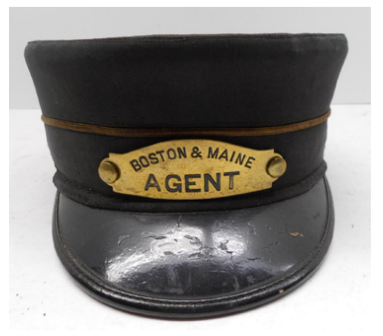
A $180 high bid took home this Boston & Maine Railroad uniform cap with an "Agent" occupational badge.

While individual consignments continue to make up many of the lots in the semi-annual Brookline railroadiana auctions, there have been several collections featured in recent sales. Word must be getting out that the detailed descriptions by auction manager Scott Czaja and the live online bidding brings good results, as new collections keep pouring in. The spring sale featured a variety of memorabilia, not only from northeastern railroads, but lines across the country as well. Many lots brought high prices, but there were also a few good deals, proving that anything goes in an auction! All photos, prices, and descriptions courtesy of Brookline Auction Gallery. Prices do not include any applicable buyer's premium or shipping.