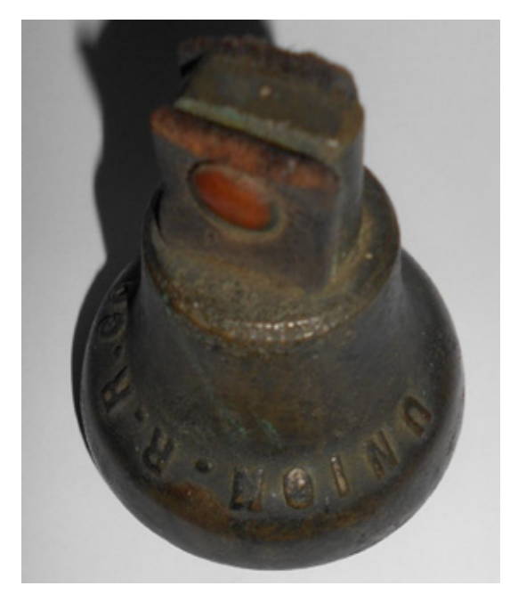
A $200 bid took home this bronze horse car bell from the Union Railroad Company of Rhode Island.