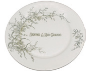
D&RG Buena Vista Plate