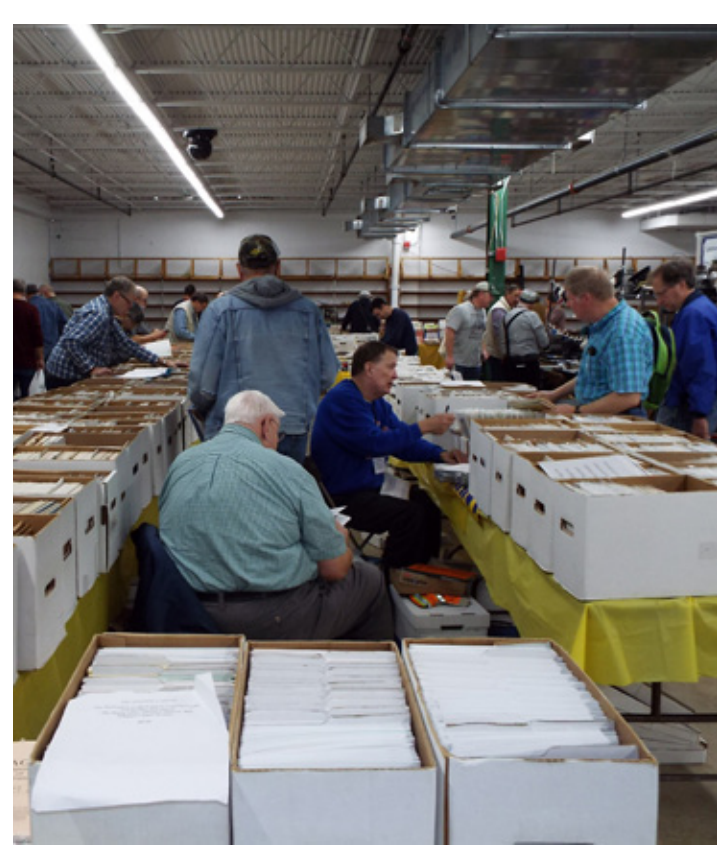
The highlight of the National Association of Timetable Collectors convention is the transportation paper show, which is open to the public on September 29, 2018.

The 2018 annual convention of the National Association of Timetable Collectors will be held at the Waterfront Hotel and Conference Center in Indianapolis, Indiana, on September 28th and 29th. Registered NAOTC members will participate in a "members only" show and sale during the day on Friday, September 28th, and the annual meeting of the organization will take place at 1:30pm.