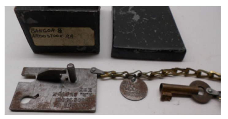
A $120 bid purchased this Slaymaker tool for checking the cut on Bangor & Aroostook Railroad switch keys.