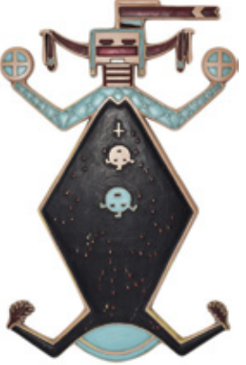
Santa Fe Wall Plaque