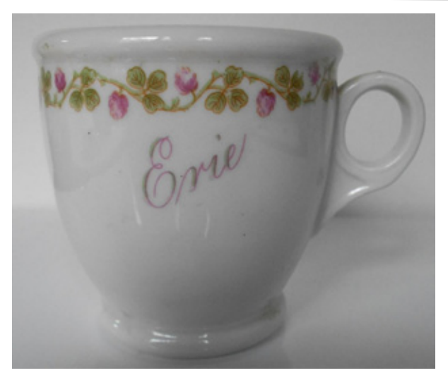
A $115 bid purchased this unusual Erie Railroad Gould pattern cup with no maker's markings.