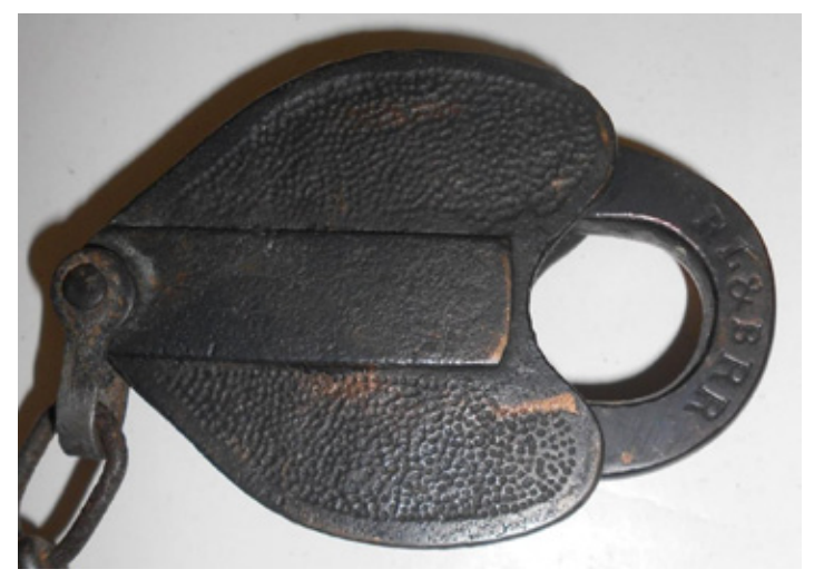
A $350 bid took home this Rochester Lockport & Buffalo Railroad interurban line lock made by Climax.