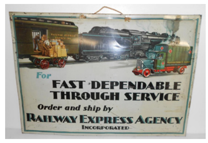
A $350 bid ws needed to buy this 19 x 13.5" Railway Express Agency sign in fairly good condition.