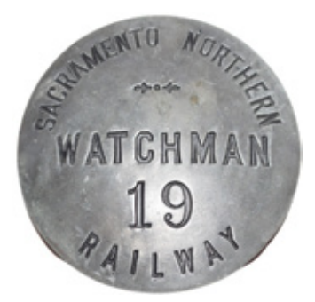
Sacrmento Northern Badge