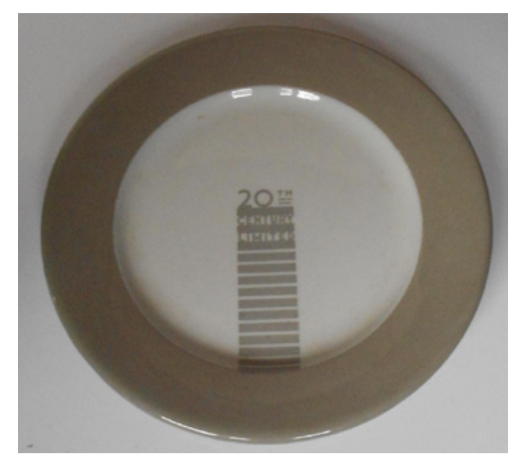
A 6 3/4" diameter plate from the New York Central Railroad 20th Century Limited by Buffalo sold for a $180 bid.