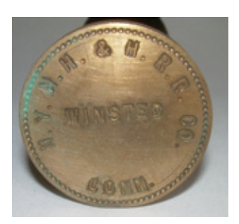
New Haven RR Winsted, CT Wax Sealer: $1100