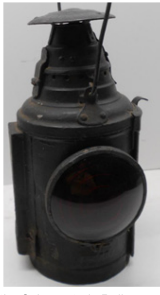
An Adlake marker lamp from the Schenectady Railway trolley sold for $700 (left) and an Erie RR Dressel lamp used on a wig-wag crossing signal on the branch from Rochester to Avon, NY (right) sold for a $180 bid.