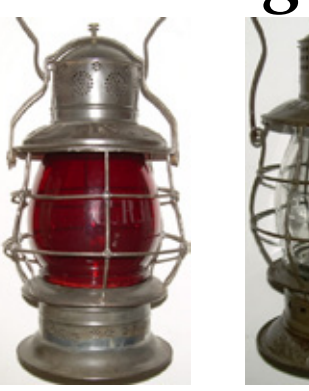
Concord RR Thompson Lantern: $1700, Triple Marked Boston & Albany New England Glass Lantern: $1750