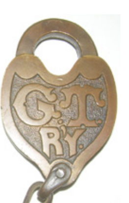
Grand Trunk Railway Brass Lock: $1800 Pennsylvania RR cast fixed globe: $2900