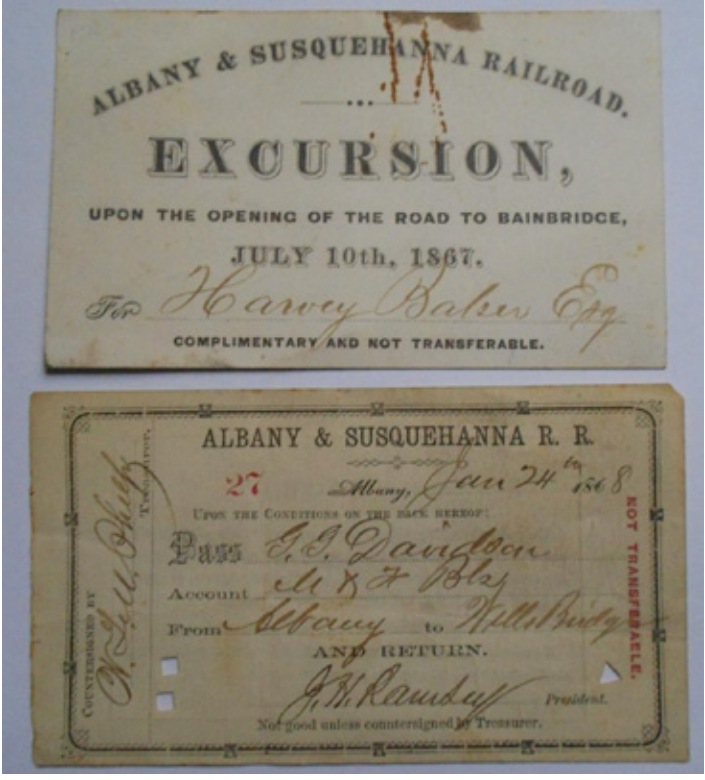
A $150 high bid was needed to purchase this set of an 1868 trip pass from the Albany & Susquehanna Railroad and an 1867 ticket for a special excursion for the opening of the line from Albany to Bainbridge, NY.