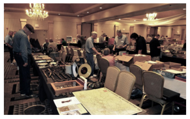
The 2018 Transportation History Expo filled all three sections of the ballroom with exhibits of memorabilia.

The many excellent exhibits arranged by members included a display of Taylor Manufacturing Co. lanterns, a variety of artifacts from the Delaware, Lackawanna & Western, early employee timetables, Delaware & Hudson memorabilia, and railroad police badges. In a departure from the usual theme of east coast railroads, a spectacular exhibit of artifacts from