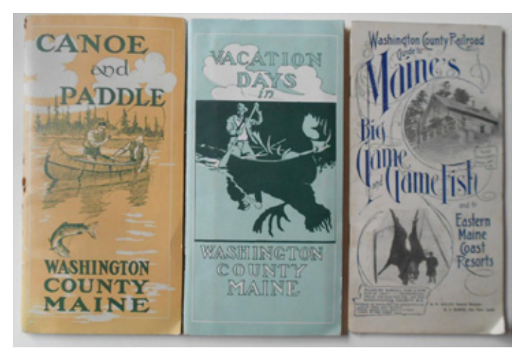
A $170 bid was needed to take home this lot of three Washington County Railroad travel brochures.