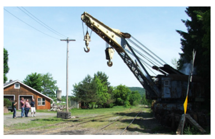
2015 KL&L Convention attendees enjoy a demonstration of the D&H "Big Hook" at the LRHS Milford museum.

General admission to Railfan Day is free, and tickets for the train ride may be purchased in advance or on the day of the event. For more information, visit www.lrhs.com, or call the museum at 607-432-2429.