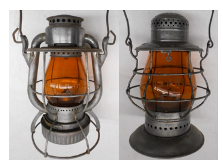
Common lanterns with rare globes: a New York Central Dietz Vesta with amber cast sold for $230 and a Boston & Albany Dietz No.6 with an amber etched brought $300.