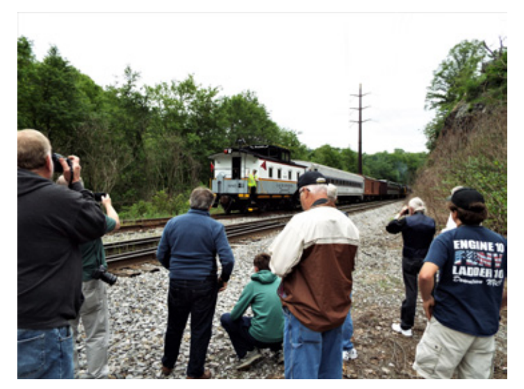
KL&L members enjoy the photo runby at the Nay Aug Tunnel on the former Lackawanna Railroad mainline.