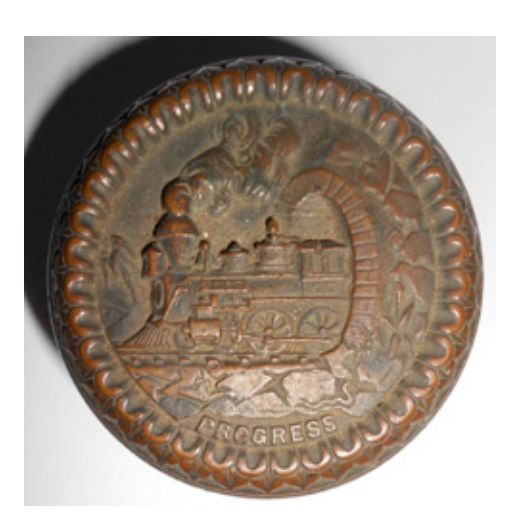
An interesting Russell & Erwin 2 1/2" brass medallion or paper weight sold for a high bid of $1000.