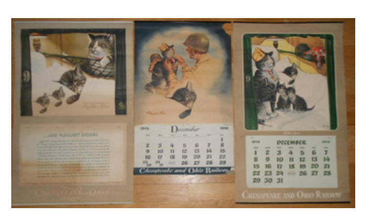
A group of Chesapeake & Ohio Chessie calendars with World War II themes sold for a high bid of $220.