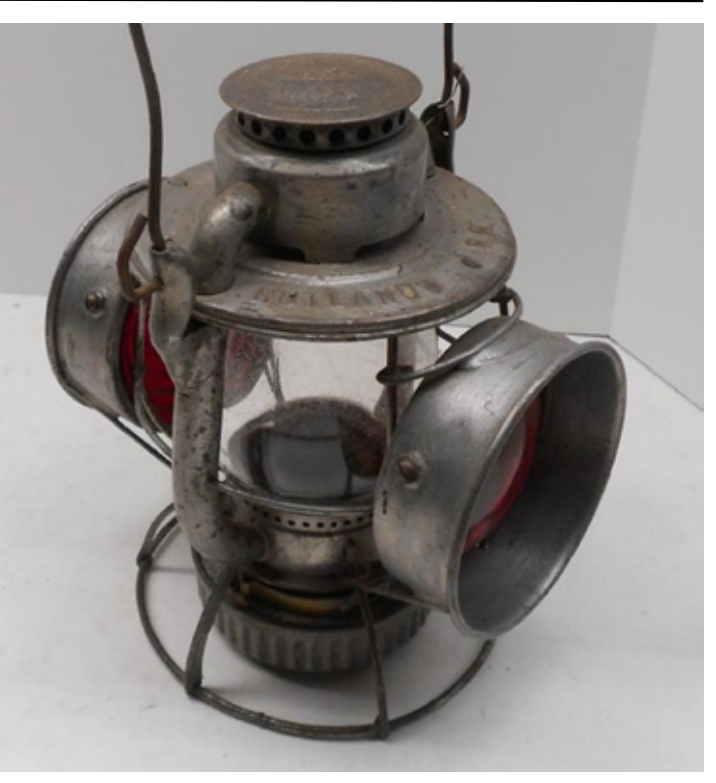
A Rutland RR Dietz Vesta lantern with hoods and red lenses for crossing service sold for a high bid of $850.