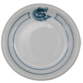
Colo & Southern Butter Pat