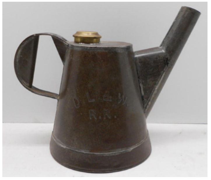
A $100 bid was needed to purchase this nice Delaware Lackawanna & Western Railroad 10" torch.