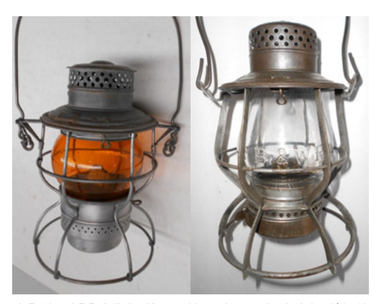
A Rutland RR Adlake Kero with amber etched globe ($350) and a Philadelphia Baltimore & Washington Casey ($230).