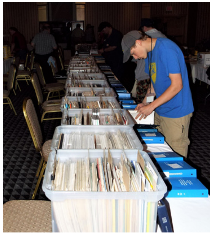
Continued on Page 19