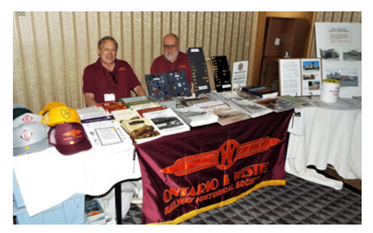
The Ontario & Western Railway Historical Society was one of several groups at the Transportation History Exposition.