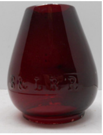
A 5 1/4 red cast MacBeth CVRR globe sold for $700, and a red cast 5 3/8 Boston & Lowell RR globe sold for $500.