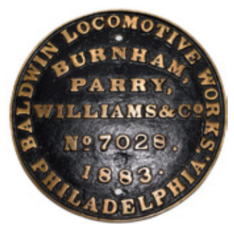
1883 D&RG Builders Plate

Announcing Auction 102 Closing September 16, 2018 Featuring some amazing pieces from the Neil Shankweiler estate. Some highlights: 60 lanterns including BTBB cobalt blue cast P&RRR, C&SRY clear cast, LVRR signal green cast, Santa Fe ext base clear cast logo. 100 pieces of china including an extremely rare D&RG Buena Vista pattern dinner plate, demi's, including Portland Rose, butter pats including C&SRY & Uintah. 96 keys includes Carson & Colorado, CMRY, Eureka & Palisades. Locks including cast LVRR, T&T, BA&P. Early passes, Santa Fe Wall plaque, depot ticket cabinet. More builders plates including 1883 D&RG, T&T and UP Big Boy front end number plate. This is just a sampling of over 600 lots that will be featured in this amazing issue. Printed catalogs are available for $20 each and include a complete prices realized list. Auction is hosted on my website with live on line bidding as well as multiple photos of each of the pieces. Remember I guarantee authenticity on everything I sell. Auction will be opened in early September so if you are not already a registered bidder be sure to sign up now.