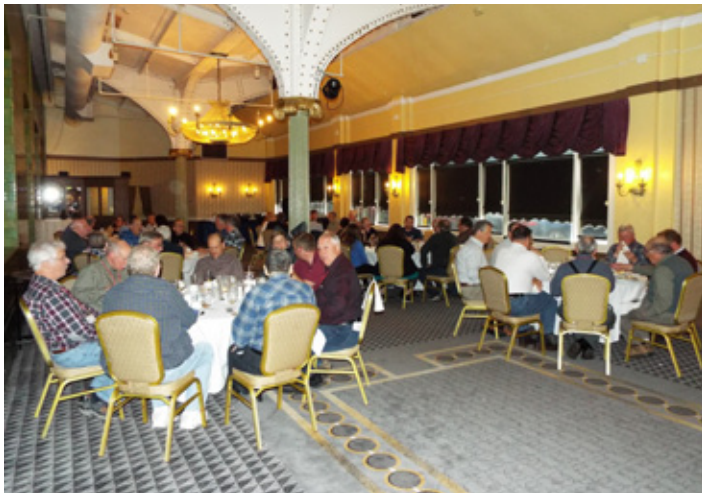
A popular event at the KL&L Convention is the banquet dinner and railroad-theme slide & movie programs.

For Additional Photos, Visit the KL&L Page on Facebook. Use the link at www.klnl.org .