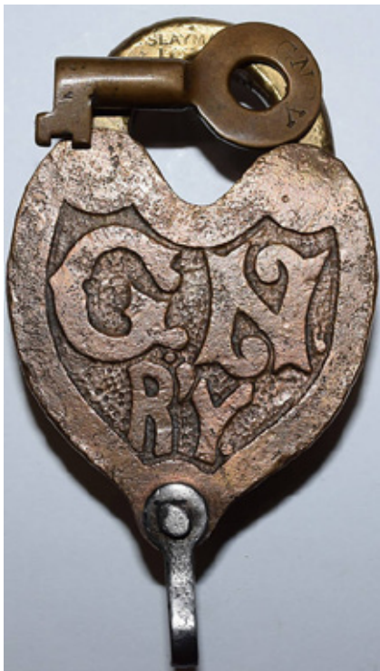
A Great Northern Railway fancy cast brass heart lock by Slaymaker with key sold for a $575 high bid.