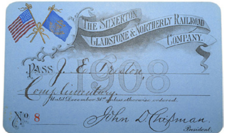
This rare Silvertown Gladstone & Northerly Railroad 1908 annual pass sold for a $10,750 high bid.