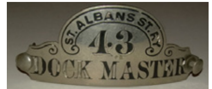
St. Albans Street Railway Dock Master Hat Badge: $625