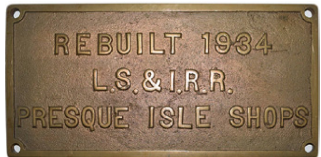
An $1800 high bid was needed to purchase this Lake Superior & Ishpeming Presque Isle ships rebuild plate.