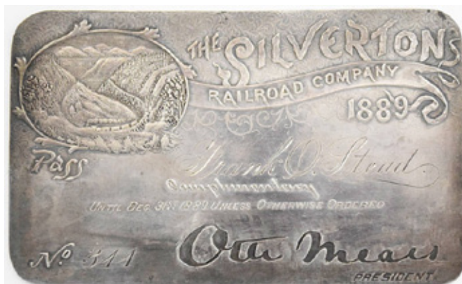
A $10,750 bid was needed to purchase this rare silver Otto Mears pass from the Silverton Railroad.