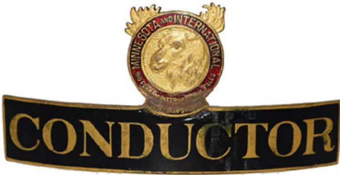
A scarce moose logo Conductor badge from the Minnesota & International sold for a high bid of $725.