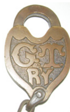
Grand Trunk Railway Brass Lock: $1800 Pennsylvania RR cast fixed globe: $2900