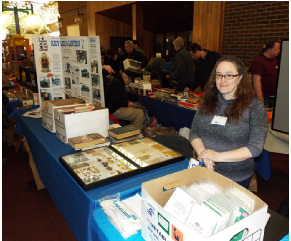
While the Rails Along the Mohawk show is primarily a model train event, there were several railroadiana dealers participating this year, along with KL&L.

The Rails Along the Mohawk show is a fundraising event for the Alco Historical and Technical Society, a non-profit organization that is dedicated to the preservation of the history of this once major producer of locomotives. The society has gathered a variety of memorabilia from the Schenectady Alco plant, with the long term goal of opening a museum. The group is also working on a project to collect oral histories from former Alco plant employees. For more information, visit the society website at www.ahts.org .