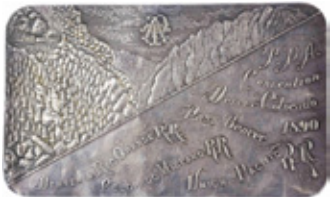
TPA Silver Pass Price Realized $3200