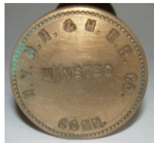
New Haven RR Winsted, CT Wax Sealer: $1100