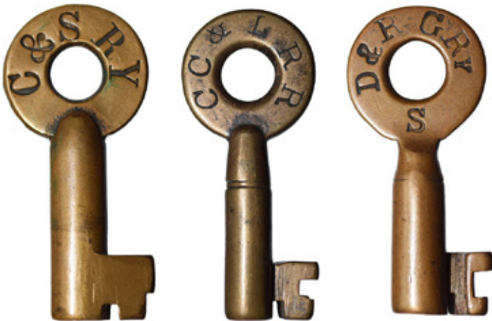
Switch keys from the Colorado & Southern Ry ($270), the Chicago Cincinnati & Louisville RR ($250), and a Denver & Rio Grande Ry from the early narrow gauge era ($2050).