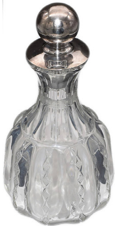
A Reed & Barton cut glass carafe with a silver cap stamped for the NC&STL sold for an $825 high bid.