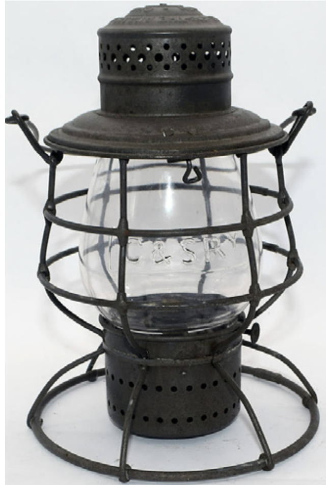
A $2250 bid took this Colorado & Southern Railway lantern by Adams & Westlake with a clear cast "C&SRY" globe.