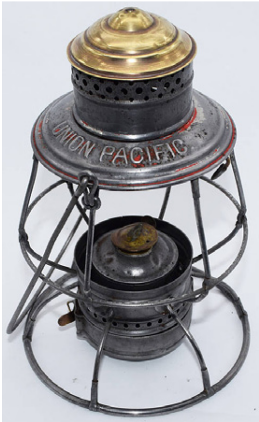
No globe, no problem. This rare Union Pacific brass top wire bottom lantern still brought a $4300 high bid.