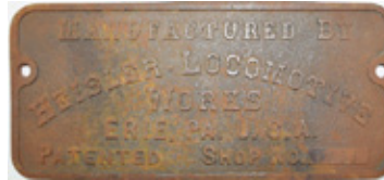
Heisler Builders Plate- Price Realized $4200