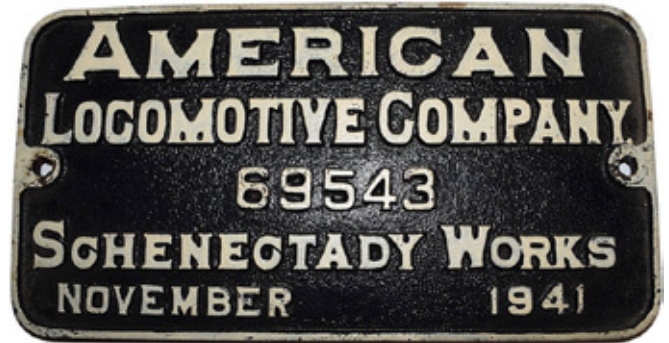
The Alco builders plate from Northern Pacific 4-6-6-4 steam locomotive #5124 sold for a high bid of $1050.