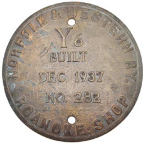
A $2600 bid took home this Roanoke Shops builders plate from Norfolk & Western 2-8-8-2 locomotive #2126.