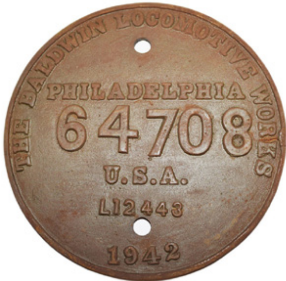
A builders plate from Baldwin 2-8-8-4 locomotive #229 on the Duluth Missabe & Iron Range RR sold for $1900.