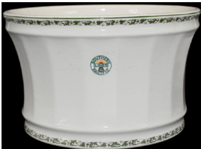
An $875 bid was needed to purchase this Southern Pacific Sunset pattern champagne bucket by Syracuse.