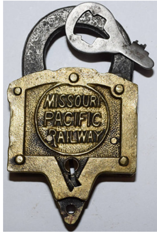
A $280 bid was needed to purchase this nice Keen Kutter lock and key with the Missouri Pacific Railway logo.