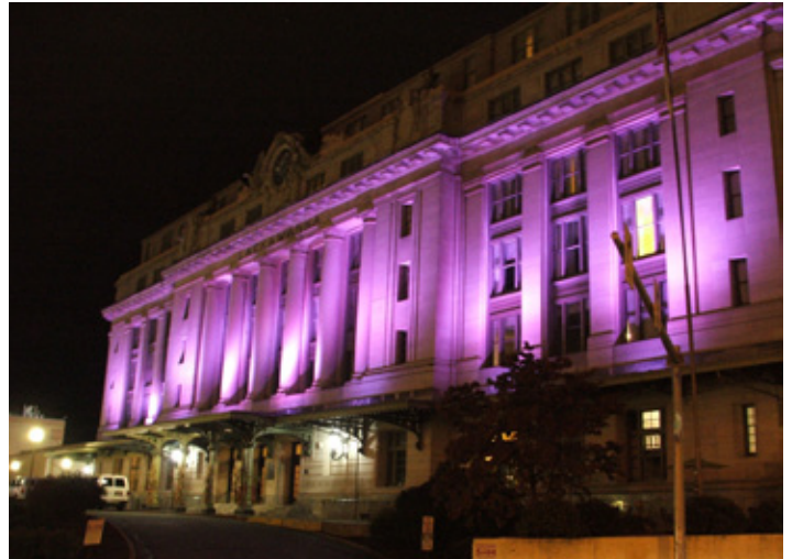
KL&L Convention headquarters is once again in the Radisson Lackawanna Station Hotel in Scranton, PA

The annual Transportation History Exposition will be held in the main hotel ballroom on Saturday, June 2nd, with setup and early admission for pre-registered members at 8:00am, and regular hours of 9:30am to 2:30pm. KL&L members will present a variety of museum-quality exhibits, and offer transportation memorabilia for sale or trade.