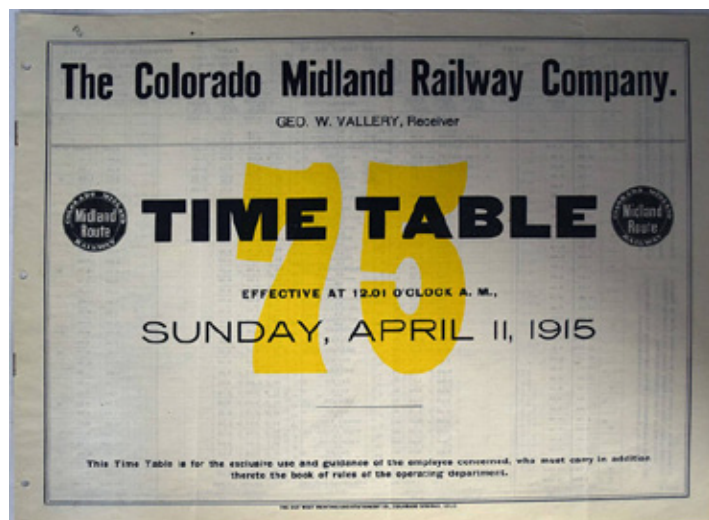
A Colorado Midland Railway "horse blanket" style employee timetable from 1915 sold for a $460 high bid.