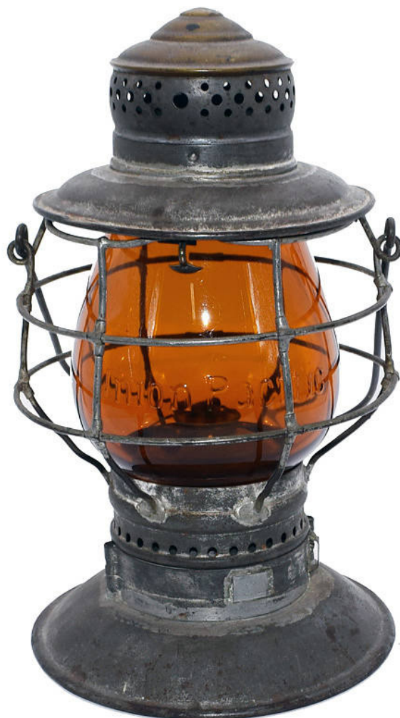
An unmarked lantern containing an amber cast Union Pacific globe sold for a high bid of $17,250.

The 100th auction contained plenty of rare memorabilia from western roads, which has always been a trademark of their sales. Having enjoyed thirty years of auctions, we can now look forward to seeing what will be coming down the pike in the years to come. All photos, prices, and descriptions courtesy of Railroad Memories Auctions. Prices do not include any applicable buyer's premium or shipping.