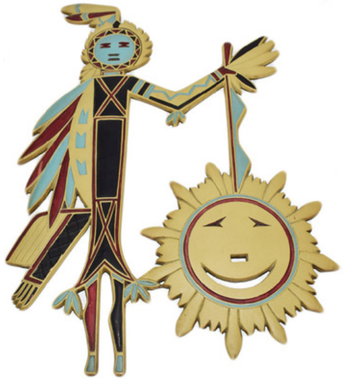
A cast aluminum wall plaque from the 1954 Budd cars on the Santa Fe El Capitan train sold for a $5000 bid.