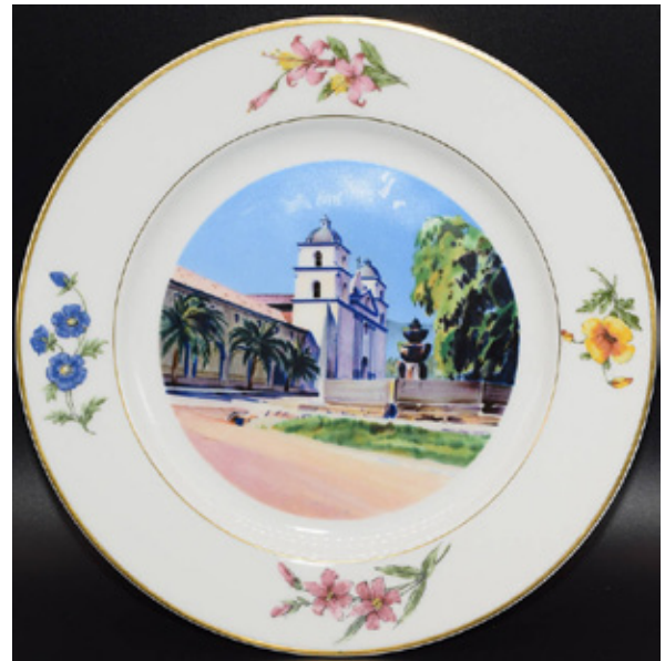
A Mission Santa Barbara service plate made by Bauscher for the Southern Pacific went to a new home for $2600.