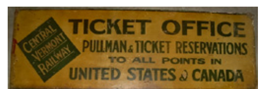
Central Vermont Railway Ticket Office & Pullman Reservations Sign: $675