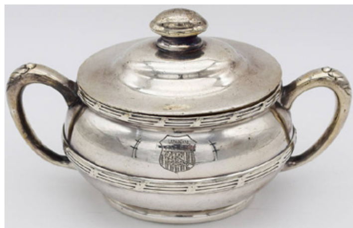
An International Silver sugar bowl with the Union Pacific Overland Route logo went to a new home for $525.