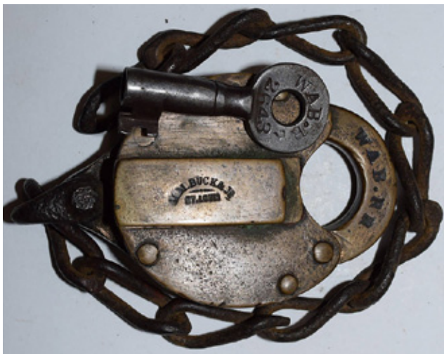
A $1050 bid was needed to buy this Wabash brass heart lock by MM Buck with a matching steel key.