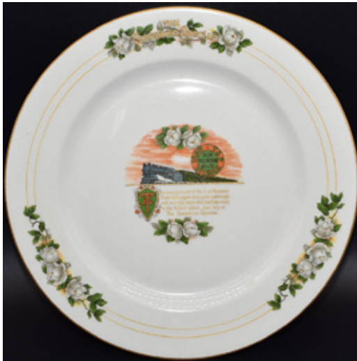
A Missouri Pacific Sunshine Special service plate by Syracuse sold for a high bid of $600.