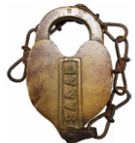
SA&AP Cast Lock Price Realized $1250

P.O. Box 415 Georgetown, Colorado 80444 Phone: 303-569-5185 Fax: 303-569-5186 www.railroadmemories.com email: railroadmemories@gmail.com