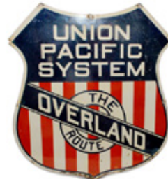
Union Pacific Sign Price Realized $1400