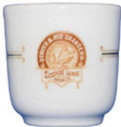
D&RG Demi cup Price Realized $3300