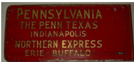
Pennsylvania Railroad Gate Sign: $400