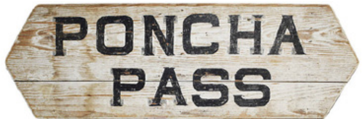
A $3700 bid was needed to purchase the Poncha Pass sign from the Denver & Rio Grande narrow gauge line.