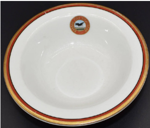
This Kansas City Southern Flying Crow pattern bowl by Onondaga Pottery in Syracuse sold for a $380 bid.