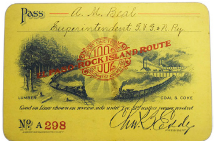
A 1902 pass from the El Paso - Rock Island Route with an ornate logo and vignette sold for a $400 high bid.