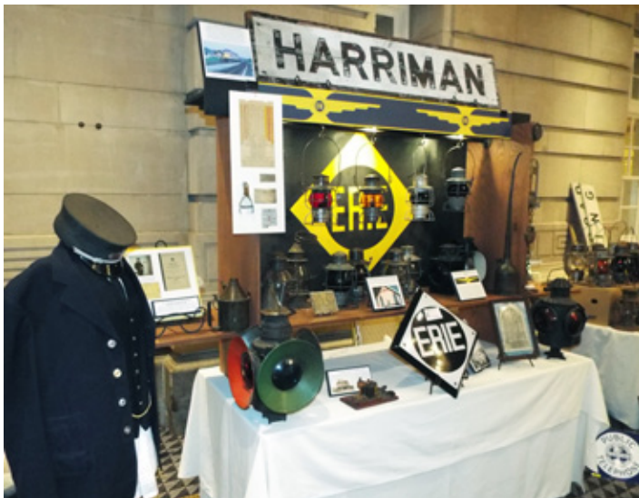
The Transportation History Exposition includes museum quality exhibits and authentic artifacts for sale or trade.