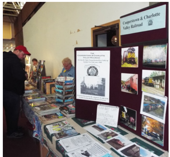
The Rails Along the Mohawk Show expanded this year to the lower level of Amsterdam's Riverfront Center.