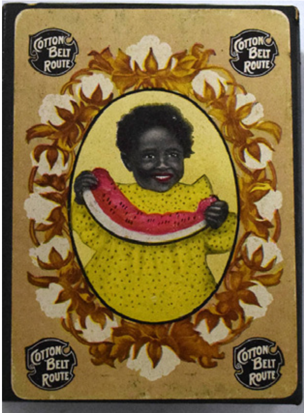
A rare deck of Cotton Belt Route (SLSW) "Watermelon Girl" playing cards brought a high bid of $1100.