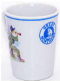
GNR Dwarf Cup Price Realized $1300