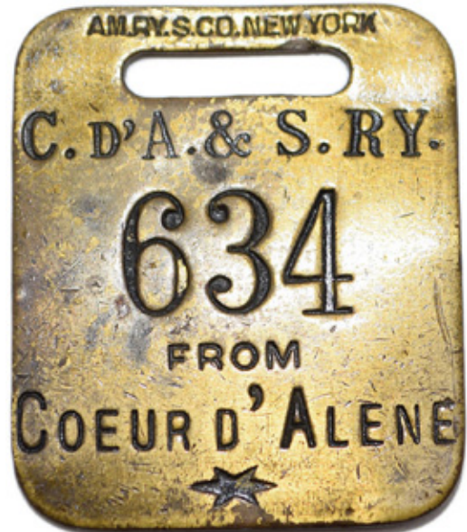
A Coeur D'Alene & Spokane Railway brass baggage tag brought a high bid of $480.