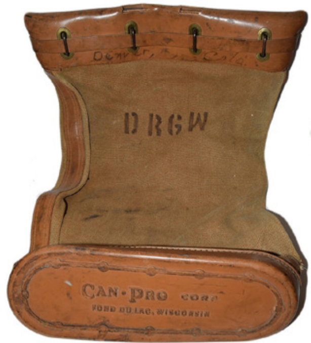
A Denver & Rio Grande Western canvas mail or money bag by Can Pro Corp. brought a high bid of $400.