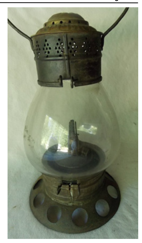
A nice brass fire department lantern with a red over clear hand blown globe went to a new home for a $1700 high bid, an $800 bid was needed to take home this rare Rutland & Washington Railroad fixed globe lantern, and a Yankee Lantern by Taylor Manufacturing of New Britain, CT, featured in Issue #179 of the KL&L magazine, sold for an $800 bid.