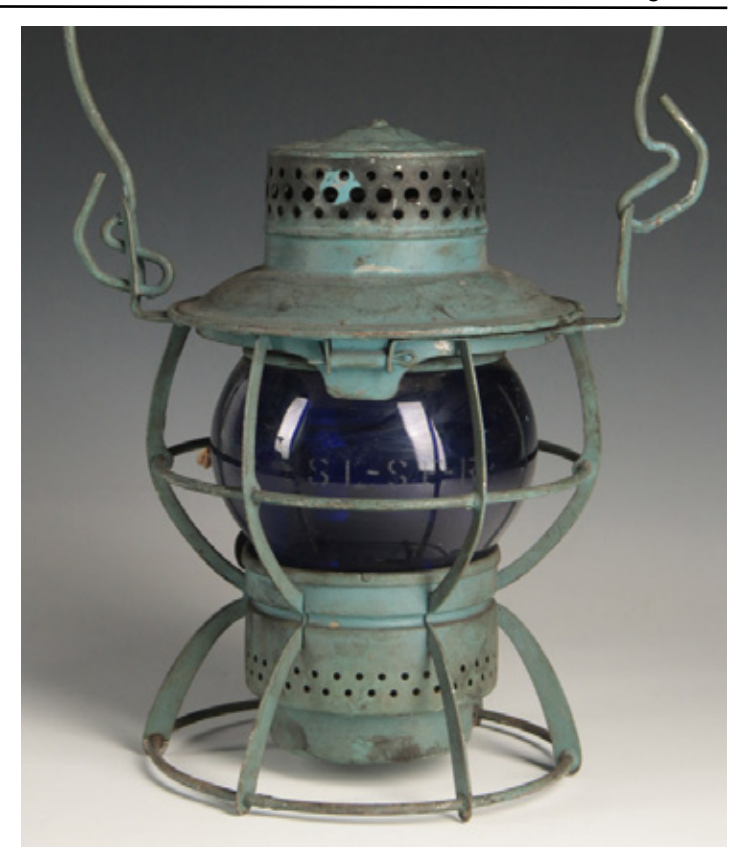
The blue etched "SL&SF Ry" globe in this Frisco lantern by Dressel garnered some interest, selling for $375.