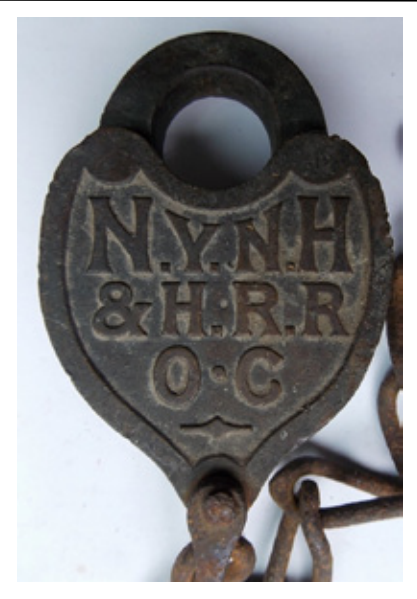
A $325 high bid took home this fancy cast New Haven lock marked for the Old Colony Division.