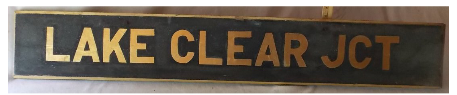
The Adirondack Scenic Railroad's operation of the former New York Central Adirondack Division is expected to be discontinued next year, making the Lake Clear Junction sign even more appealing, and bringing an $800 bid.