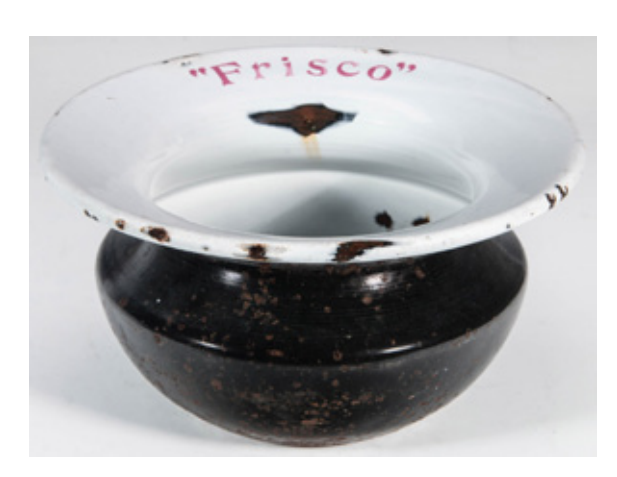
An unusual emanel cuspidor marked for the Frisco brought a high bid of $120, despite a fair amount of wear.