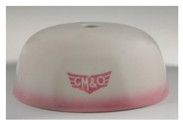
A Gulf Mobile & Ohio Railroad Rose pattern dish cover sold for a high bid of $400.