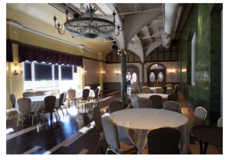
The KL&L Convention banquet will be held on the platform where passengers once boarded the Phoebe Snow.

The annual membership meeting of Key, Lock & Lantern is tentatively planned to be held at 11:00am, followed by the popular fundraiser "auction." The hotel restaurant will be open for lunch, and box lunches will be available for exhibitors at a reduced rate, once again sponsored by the NY-PA Collector magazine. Exhibits will close at 2:00pm.