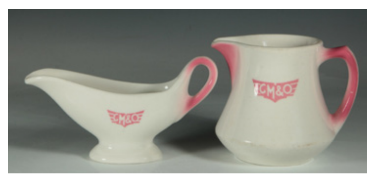
A lot consisting of a creamer and gravy boat in the GM&O Rose pattern went to a new home for a $300 bid.