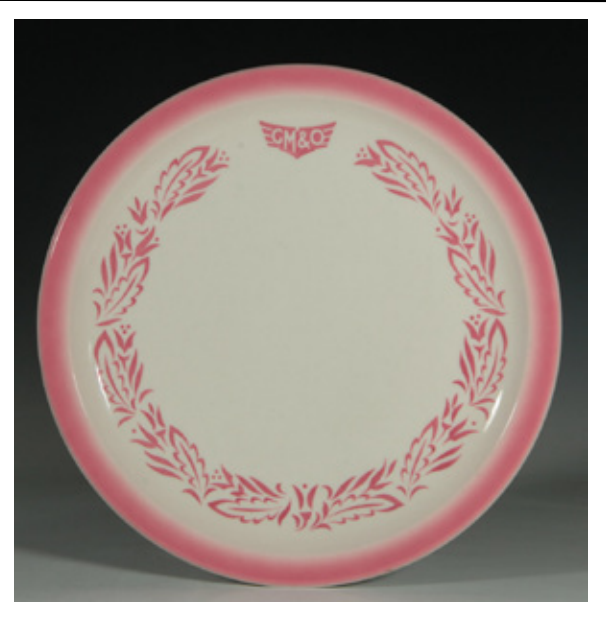
A high bid of $275 was needed to purchase this nice Gulf Mobile & Ohio Rose pattern dinner plate.