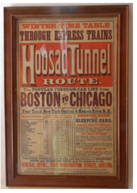
A framed circa-1870's depot timetable from the Boston & Albany sold for a $600 high bid, while a marked "FRR" frame added to the appeal of this Hoosac Tunnel Route broadside, which sold for $650, and this New Haven ashtray/drink stand from a parlor car brought a surprising $1400 high bid. You never know what will happen at an auction!