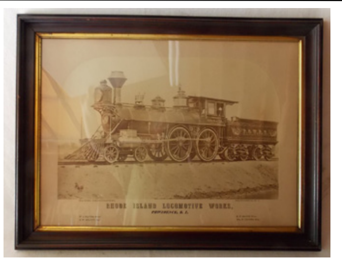
A Rhode Island Locomotive Works framed builders photo of Providence & Worcester "William S. Slater" sold for $1000.