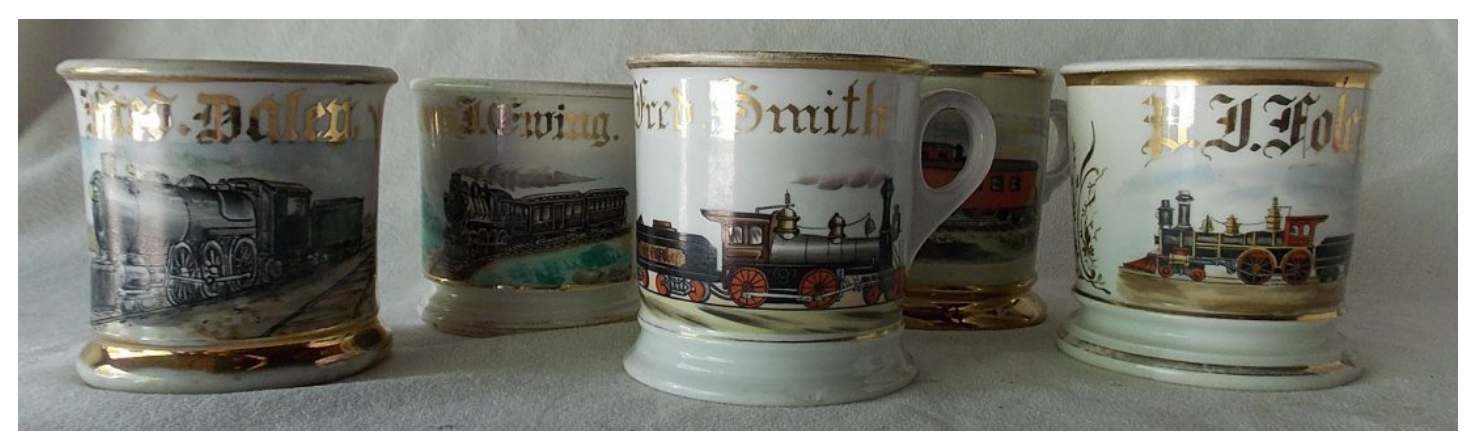
This set of five railroad theme occupational shaving mugs with illustrations of rolling stock and owners names, in varying condition, went to a new home for a $475 high bid. Continued on Page 23.