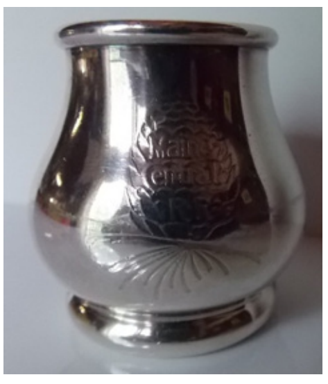
A $550 high bid was needed to purchase this nice Maine Central Pinecone logo toothpick holder.