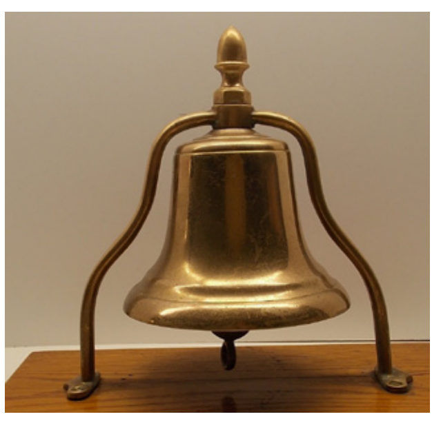
A small locomotive bell possibly from the East