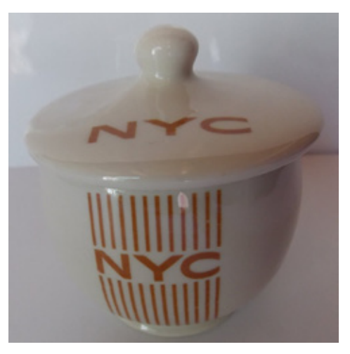
Somewhat scarcer than typical New York Central china, this Mercury pattern custard cup by Buffalo sold for $325.