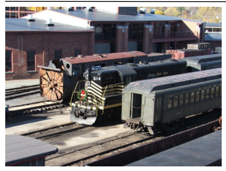
The Steamtown National Historic Site is home to a large collection of rolling stock and displays of railroad artifacts.