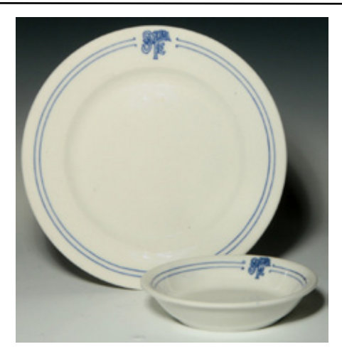
A lot of Santa Fe Bleeding Blue china including a luncheon plate and fruit bowl brought a $170 bid.