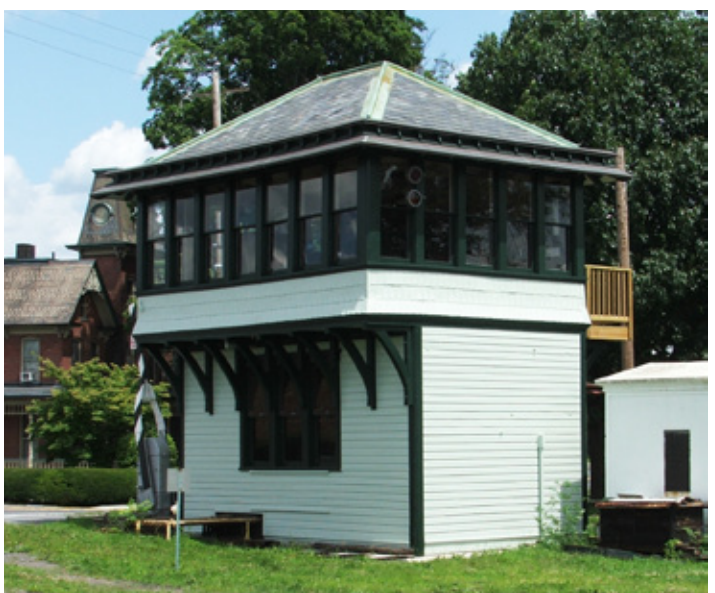
The restored DL&W interlocking tower at East Stroudsburg is one of the may historic structures which are still standing along the route of the KL&L Convention's excursion train.

So make plans today to attend the 45th annual Key Lock & Lantern Convention in Scranton. After three great years in Utica, this popular event has grown again, and should be the best one yet! Watch the KL&L Facebook page, the KL&L website, and the next edition of this newsletter for registration information and forms, which will be available soon.