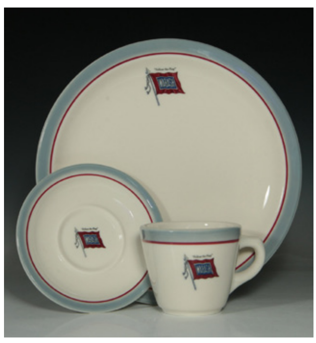
A $275 bid took home this lot of three nice pieces of Wabash Banner pattern china.