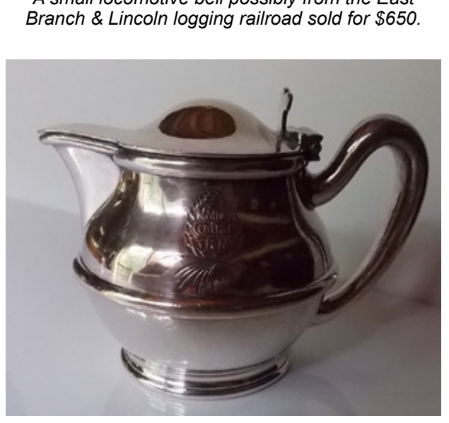
A $500 bid was needed to take home this Maine Central Railroad Pinecone logo 1/2 pint creamer.