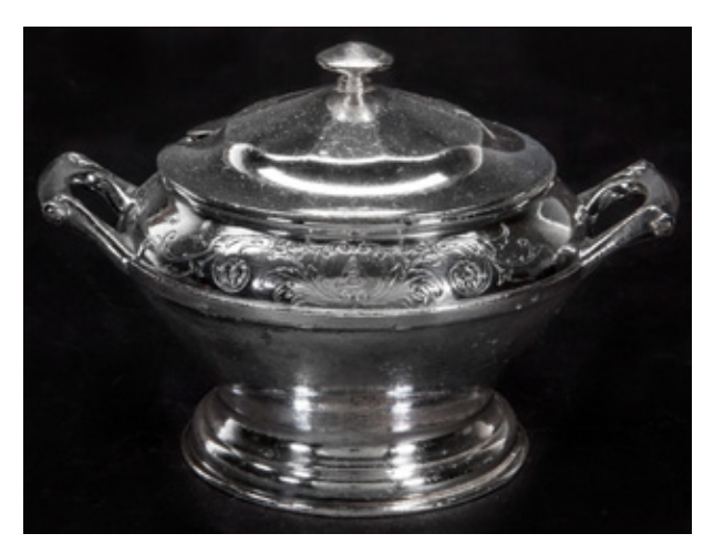
A Chicago & Alton Railroad silver tureen made by Albert Pick & Co. went to a new home for $150.