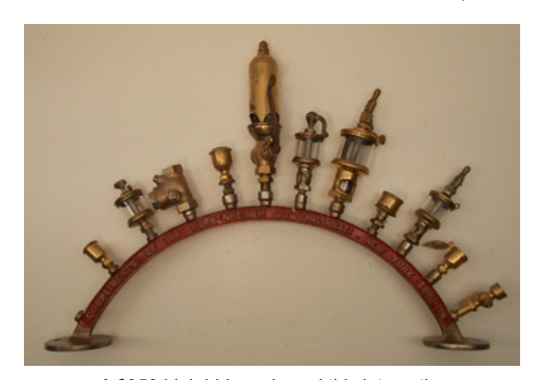
A $950 high bid purchased this interesting Lunkenheimer whistle advertising display.