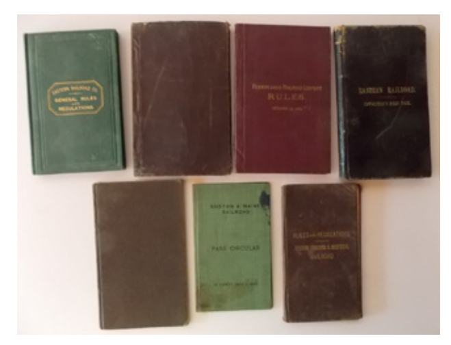
A lot of rule books from the Eastern, Norwich & Worcester, Boston Concord & Montreal and others sold for $140.