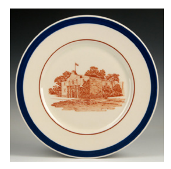
A nice example of a Missouri-Kansas-Texas Alamo "Blue Service" dinner plate sold for a $250 bid.