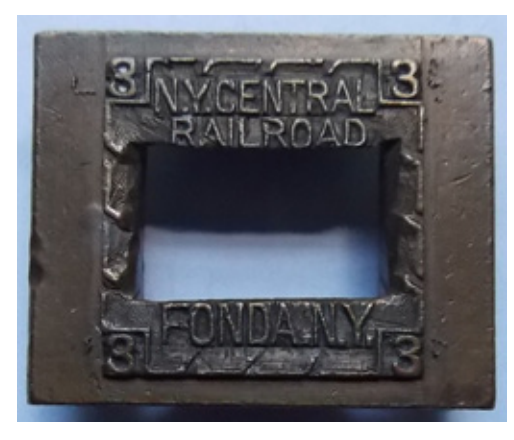
Dater dies remain popular, with this example from the New York Central station at Fonda selling for $130.