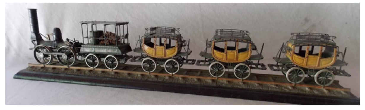
A unique finely detailed 36" long model of the Mohawk & Hudson "Dewitt Clinton" train sold for a high bid of $1700.