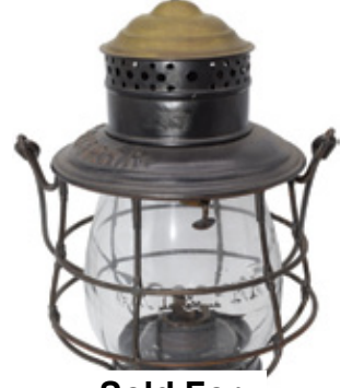
Sold For: $4300