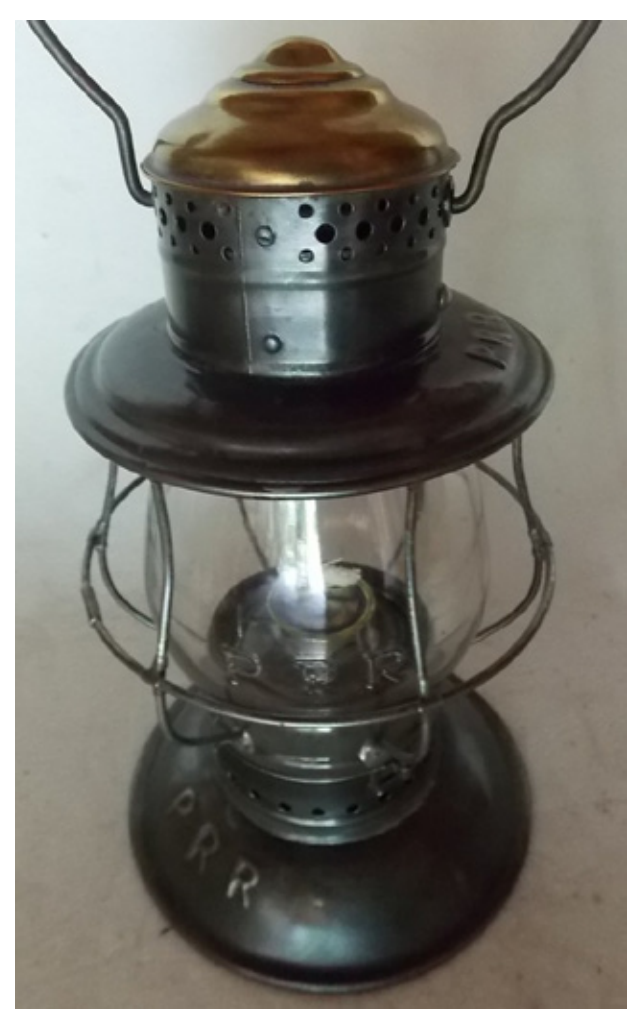
A $1200 bid was needed to purchase this Pennsylvania Railroad triple marked brass top bell bottom lantern.