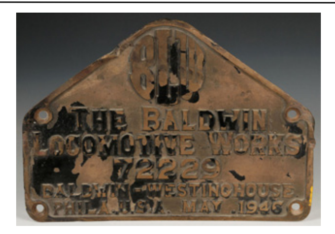
A $750 bid took home a 1946 builders plate from the Baldwin Locomotive Works in Philadelphia, marked "7229."