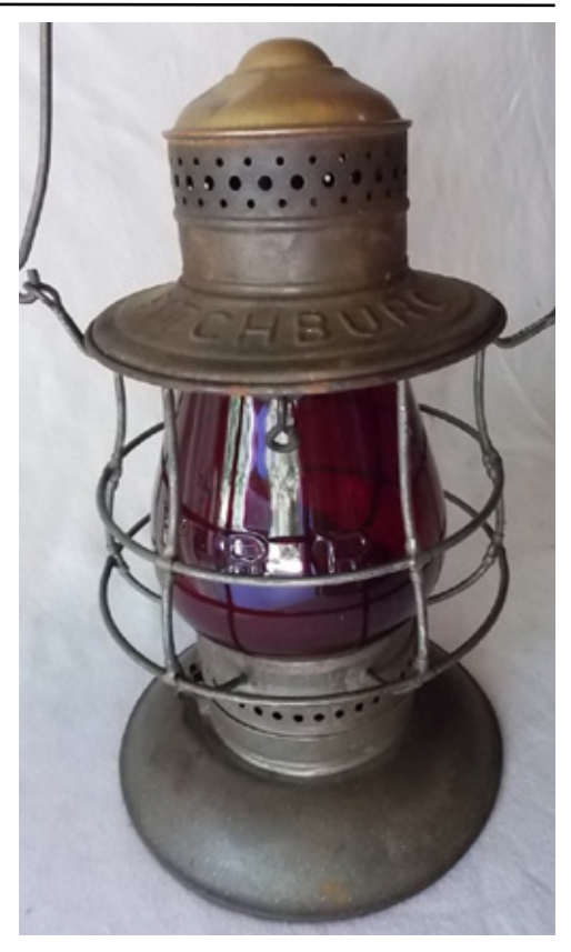
A brass top bell bottom by Steam Gauge & Lantern marked "CRR" with a red cast B&M globe sold for $400, an $1100 bid was needed to take home a double marked Fitchburg lantern by SG&L, with blue FRR globe and a CT Ham brass top bell bottom marked "Fitchburg" with a red flashed "FRR" cast globe brought $550.