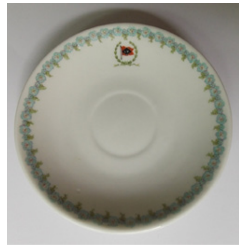
A nice Lehigh Valley Railroad "Batavia" pattern saucer (without matching cup) sold for a high bid of $180.