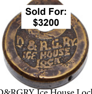
D&RGRY Ice House Lock