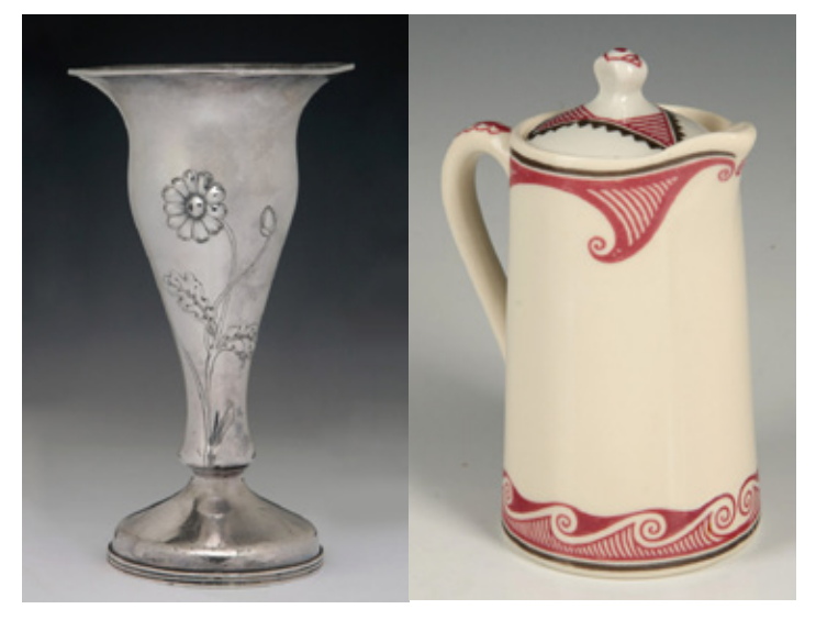
An ornate silver plated flower vase made by Gorham for service on the Frisco sold for a high bid of $325, while a $190 bid was needed to purchase this nice example of a Santa Fe Mimbreno pattern chocolate pot.