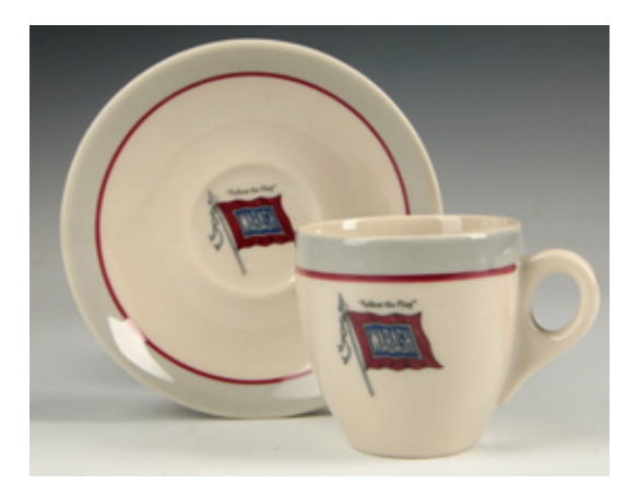
A Wabash Banner pattern demitasse cup & saucer by Syracuse sold for a high bid of $170.