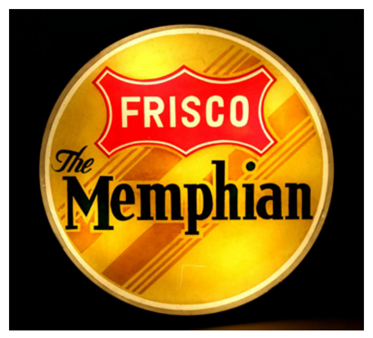
The drumhead sign from the Frisco Memphian train brought in a number of bids, finally selling for $4500.

Ads Reach Serious Collectors Contact KL&L at transportsim@aol.com