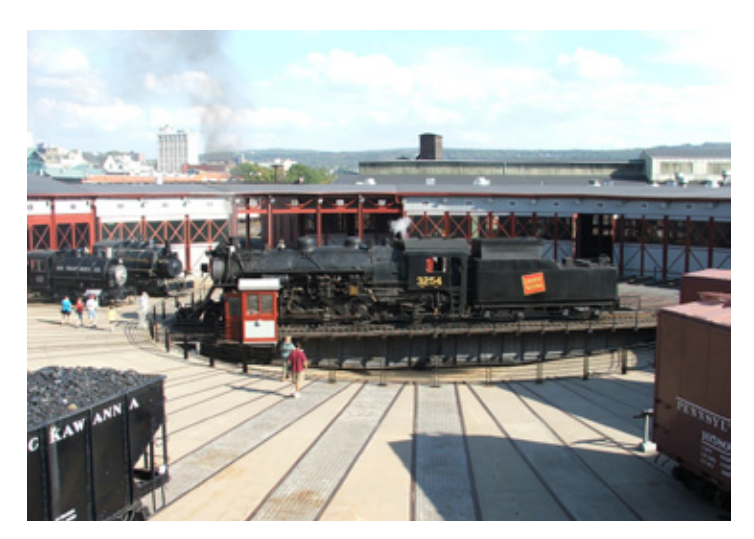
The centerpiece of Steamtown is the former DL&W roundhouse, which houses equipment & exhibits.