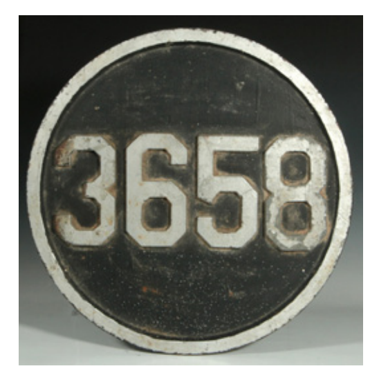
A $350 bid was undoubtably a good deal for whoever knew where locomotive number plate "3658" came from.