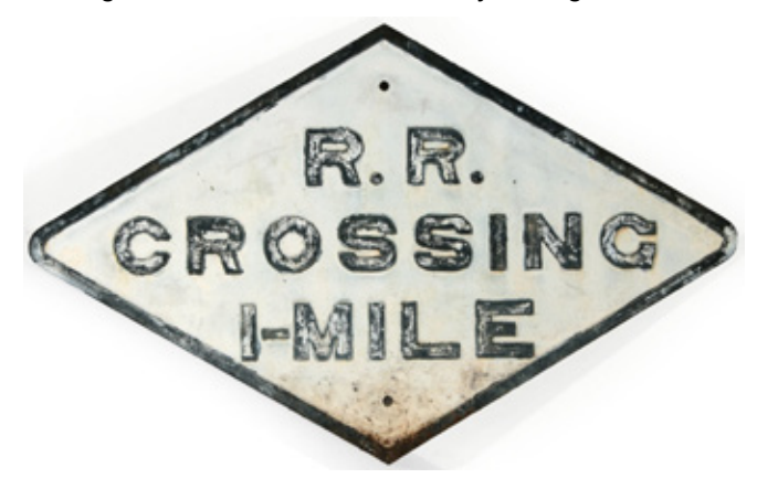
A $350 bid was needed to purchase this cast iron "RR Crossing 1-Mile" sign.