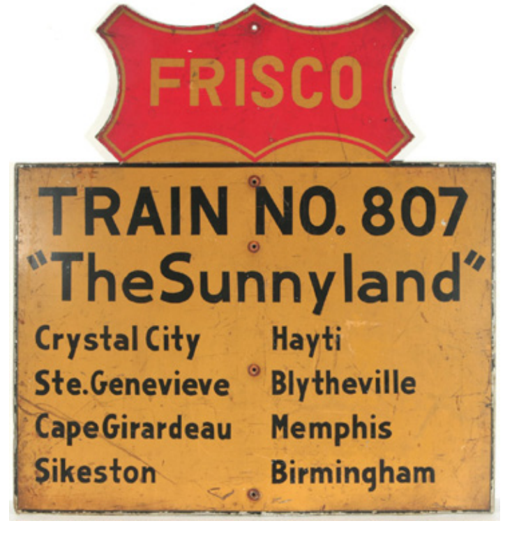
One of several unique items in the sale, the Frisco "Sunnyland" train sign sold for $1150.