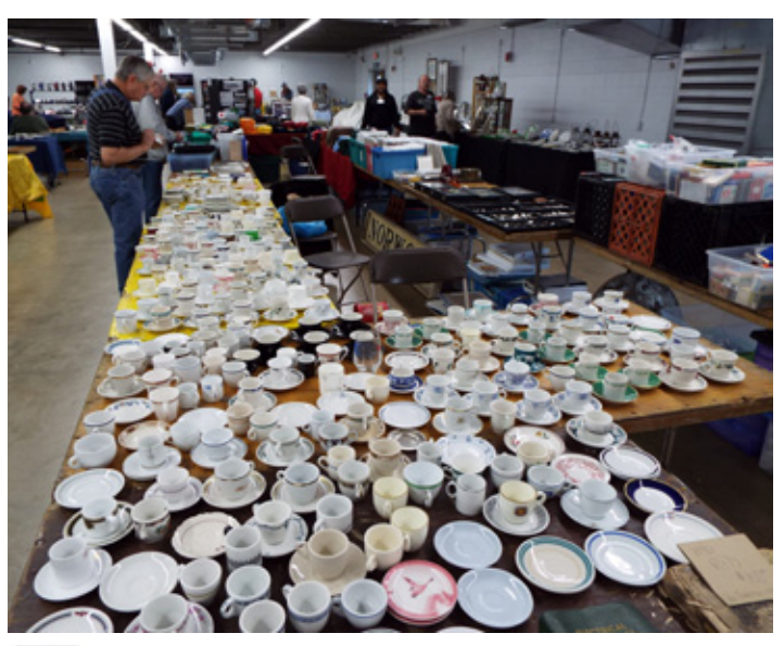
For Additional Photos, Visit the KL&L Page on Facebook. Use the link at www.klnl.org.