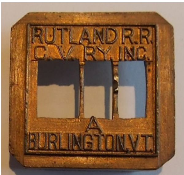
The ticket validator die from the Rutland & Central Vermont station in Burlington, VT sold for a $375 high bid.