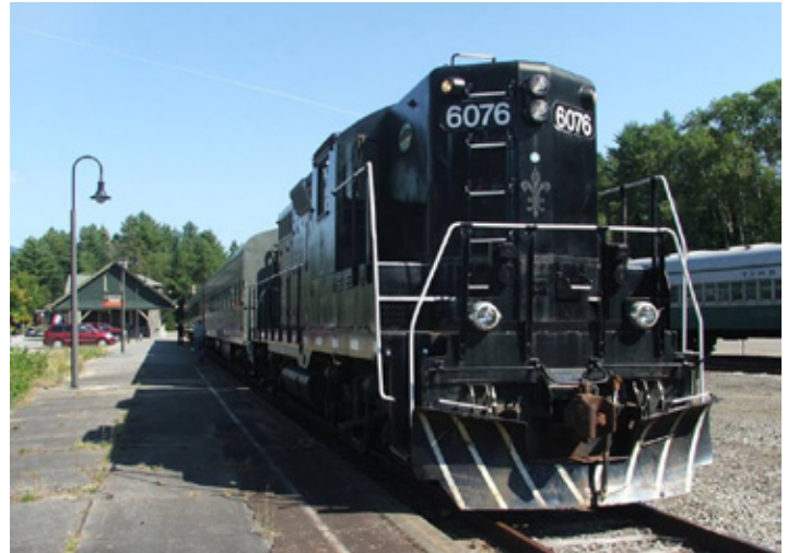
An Adirondack Scenic Railroad train departs from Lake Placid station on a mid-day run.

The public is invited to attend the rally, in a show of support for the Adirondack Scenic Railroad, and its opposition to the state’s plan to dismantle 34 miles of trackage that is currently in use by trains and rail bikes. The railroad group