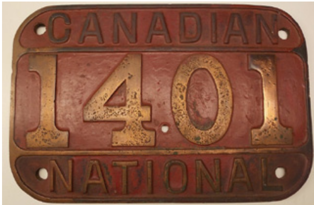
A $2000 bid took home the number plate from Canadian National 4-6-0 No.1401 by Montreal Locomotive Works.