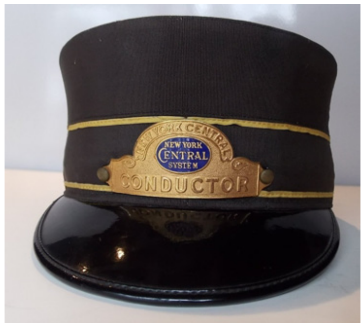
You never know how things will go at an auction. This standard New York Central Conductor cap sold for $170.