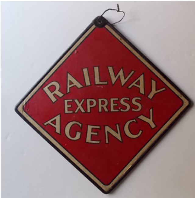
A $120 bid was needed to purchase this nice example of a Railway Express Agency two-sided call sign.