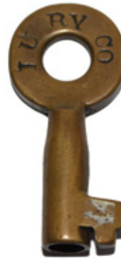
IURY CO Tapered Key