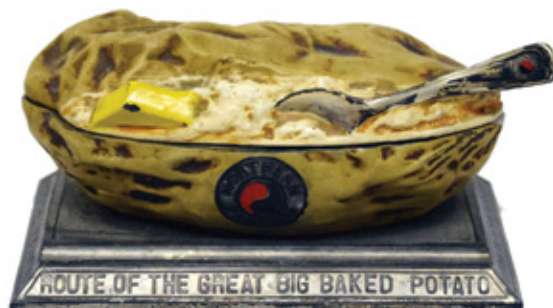
NP Double ink well