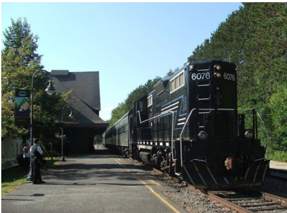
An Adirondack Scenic Railroad train departs from Saranac Lake station, enroute to Lake Placid on a 2015 excursion run. This section of the line, which was rehabilitated with state & federal funds, will be abandoned under the new plan recently announced by Governor Cuomo.

The announcement downplays the fact that an existing tourist railroad operation by the Adirondack Scenic Railroad between Lake Placid and Saranac Lake, and by the Rail