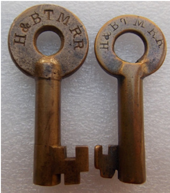
A pair of keys from the Huntington & Broad Top Mountain Railroad, one marked A&W, sold for a $180 high bid.