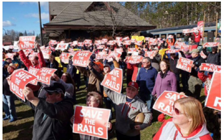
A crowd of supporters at a recent rally to save the Adirondack Scenic Railroad line.