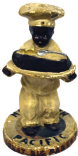
Little Nippy Statue