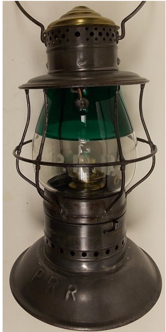
A $2300 bid took home a nice triple-marked Kelly brass top lantern, with "PRR" on both the lid & bellbottom, and also etched on the Macbeth green over clear globe.