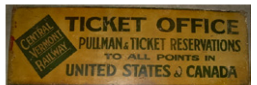
Central Vermont Railway Ticket Office & Pullman Reservations Sign: $675