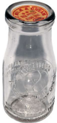
Rare NP Milk Bottle