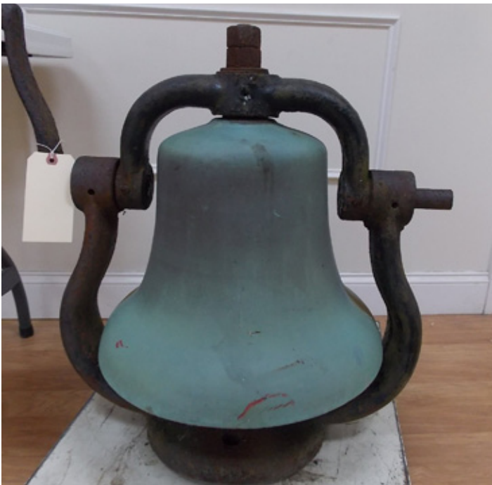
The bronze bell from Boston & Maine RR locomotive No.2658, with sale documentation, brought a $1200 bid.