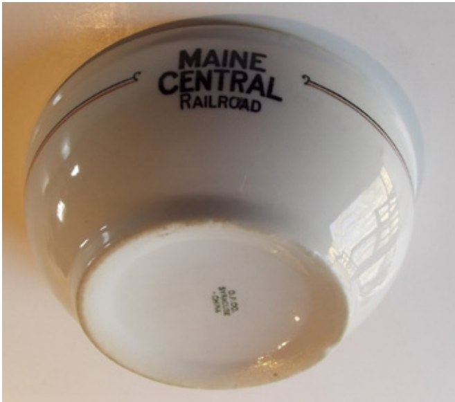
An unusual Maine Central Kennebec pattern oatmeal bowl by Onondaga Pottery of Syracuse sold for a $375 bid.