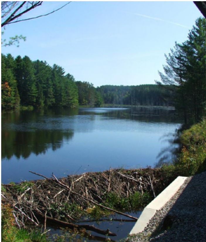
This view of a beaver pond on the Adirondack Scenic RR will no longer be accessible by train after the New York State plan goes into effect this year.

and its supporters maintain that the best use of the line is for it to be restored to permit train operations between Utica and Lake Placid. Only with the nationally recognized Olympic village of Lake Placid as a destination, will passenger trains on the line be financially viable.