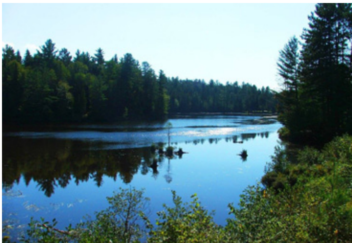
A scenic view from the train near Lake Placid, on a section of the line that will be abandoned.

However, the Adirondack Railway Preservation Society, which has led the effort to restore service to the entire line between Utica and Lake Placid, sees this plan as a threat to the viability of railroad operations on any section of the line. This non-profit group has pressed the state to act on its original 1994 plan, which calls for the rehabilitation of the entire railroad, and has successfully run passenger trains between Utica and Big Moose and from Saranac Lake to