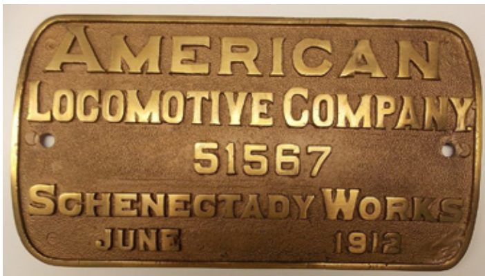
A $1600 bid was needed to take home this 1912 American Locomotive Company builders plate from Rutland Railroad 4-6-0 steam locomotive No. 77, with framed photo.