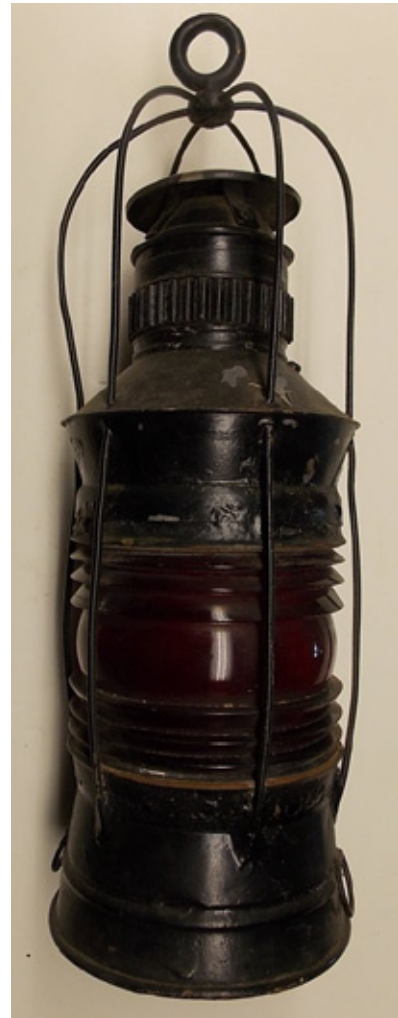
Something a little different: a lamp used on the ball signals once found throughout New England, sold for a $210 bid.