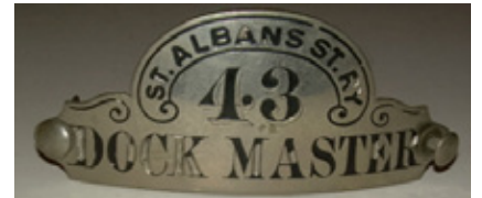
St. Albans Street Railway Dock Master Hat Badge: $625