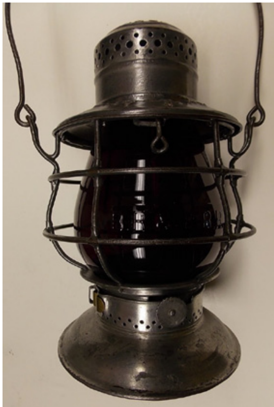
This Buffalo, Rochester & Pittsburgh Dietz #39 with a scarce red cast engine globe brought a $400 top bid.