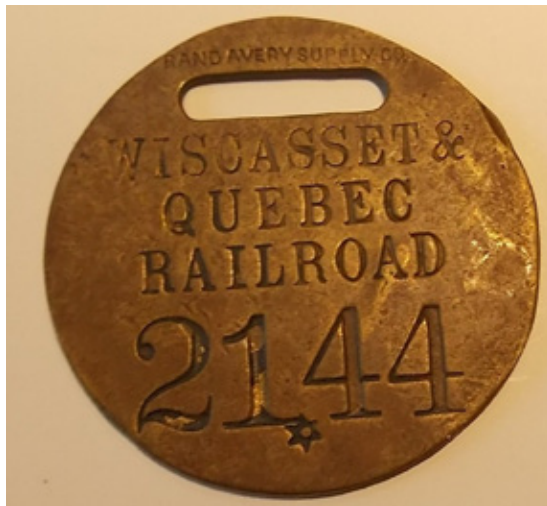
A scarce baggage tag from the Wiscasset & Quebec RR by Rand Avery Supply Co. brought a high bid of $350.