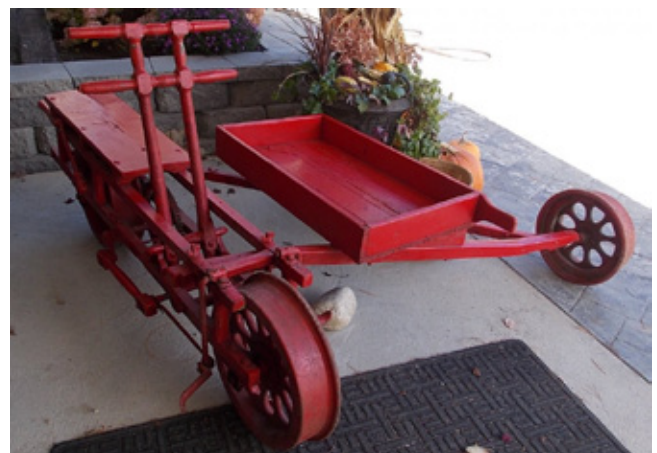
One of the more unusual items in the sale, this scarce track inspection velocipede brought a $2600 bid.