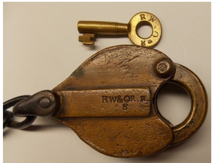
A $275 bid was needed to purchase this nice Rome, Watertown & Ogdensburg brass switch lock & key set.