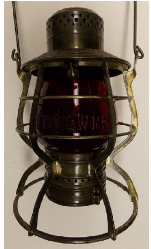
Some of the many nicely restored lanterns in the auction: Lehigh Valley RR by Armspear with red cast globe, $250; Erie Railroad Dietz Steelclad with green etched ERRCo globe, $275; NYLE&W A&W Adams with red cast globe, $500.