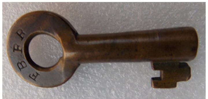
A Bohannon switch key marked for the coal-hauling Fall Brook Railroad, sold for a high bid of $190.