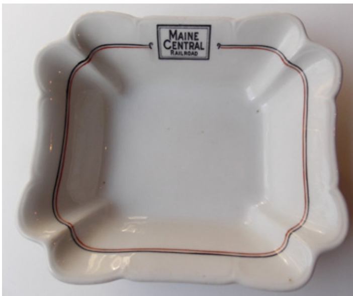
A nice Maine Central Railroad “Bangor” pattern 7x6” dish with an ML China hallmark sold for a $475 high bid.