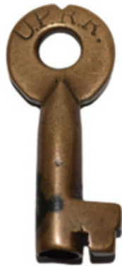
UPRR Tapered Key