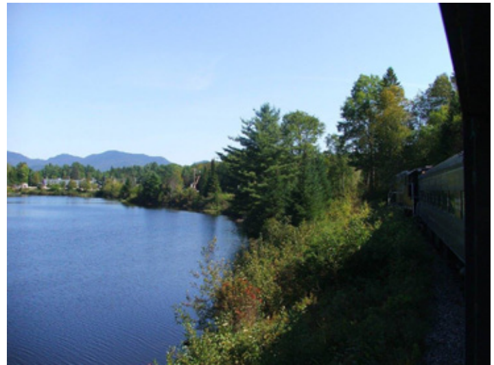
The high peaks, as viewed from an Adirondack Scenic RR train arriving at Lake Placid.

It is hoped that the New York State agencies that have been involved with the development of this plan will change their positions, and keep this environmentally friendly and universally accessible mode of transportation in place.