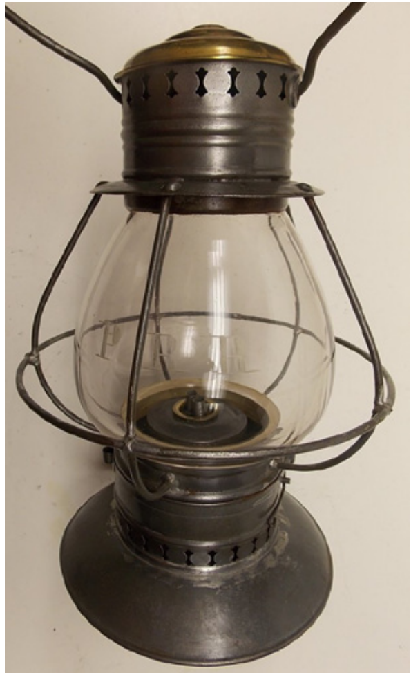
A nice Kelly fixed globe lantern with a wheel cut “PRR” globe went to a new owner for a $3000 high bid.