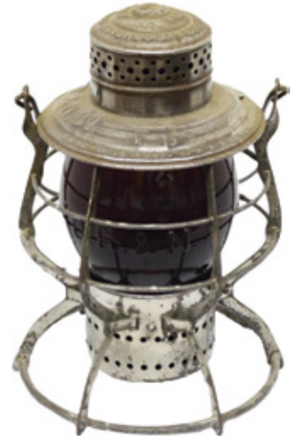
OR&N RED CAST