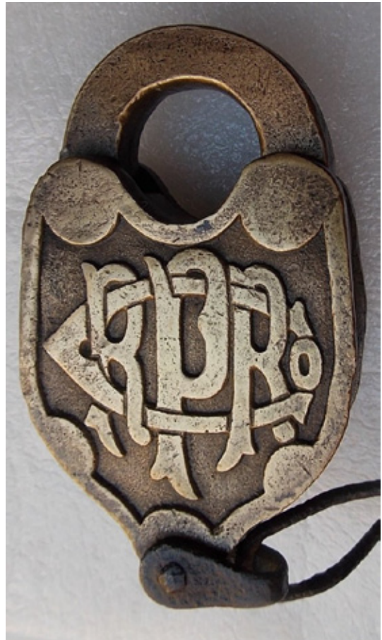
This interesting variation of a PRR fancy cast back lock by Fraim sold for a reasonable bid of $140