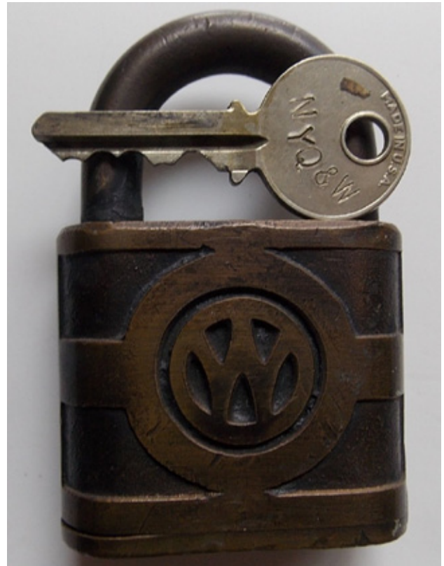
This New York, Ontario & Western logo signal department lock with matching key sold for a high bid of $200.