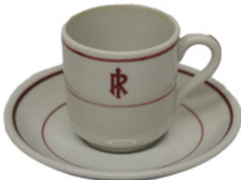
EL RENO DEMITASSE