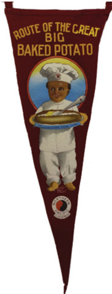
RARE NP PENNANT