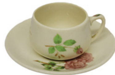
PORTLAND ROSE DEMI