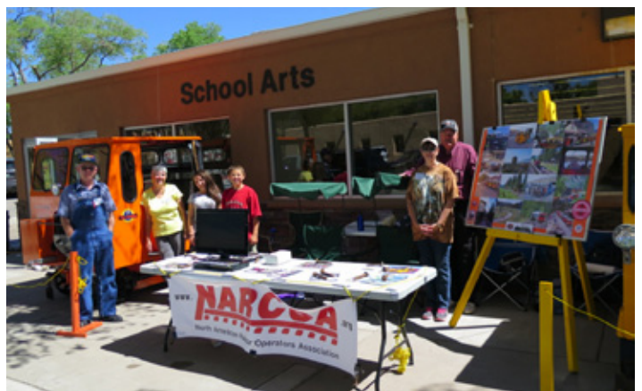
New Mexico members of the NARCOA group displayed several track speeders.