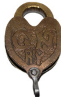
GPNRY CAST LOCK