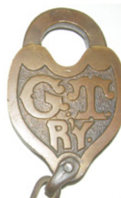
Grand Trunk Railway Brass Lock: $1800 Pennsylvania RR cast fixed globe: $2900