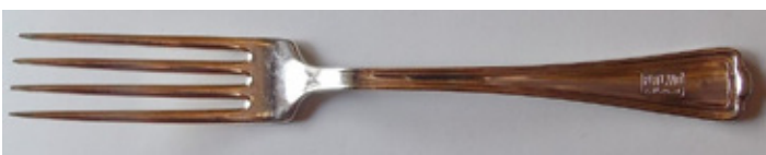
Dining car silverware from the Rutland Railroad is fairly scarce, and this salad fork with a Meirden Brita Company hallmark and Rutland box logo sold for $220.