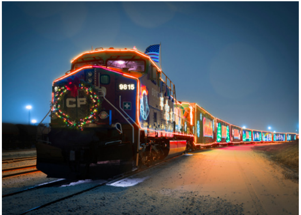
The Canadian Pacific Holiday Train travels across the U.S. and Canada each year, raising money and donations for local food banks.

Details are available on their website: www.cpr.ca/holiday-train/united-states or on the Holiday Train Facebook page at: www.facebook.com/HolidayTrain . Submissions are due by December 28th, so don't delay in checking out the contest guidelines!