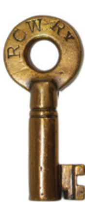
Rio Grande Western Key