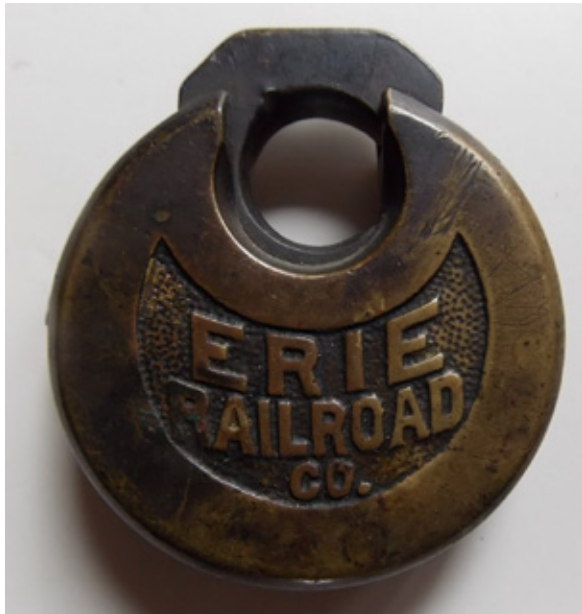
This nice example of an Erie Railroad brass "pancake" style lock sold for a reasonable bid of $190.