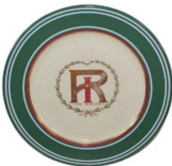
Rock Island Service Plate