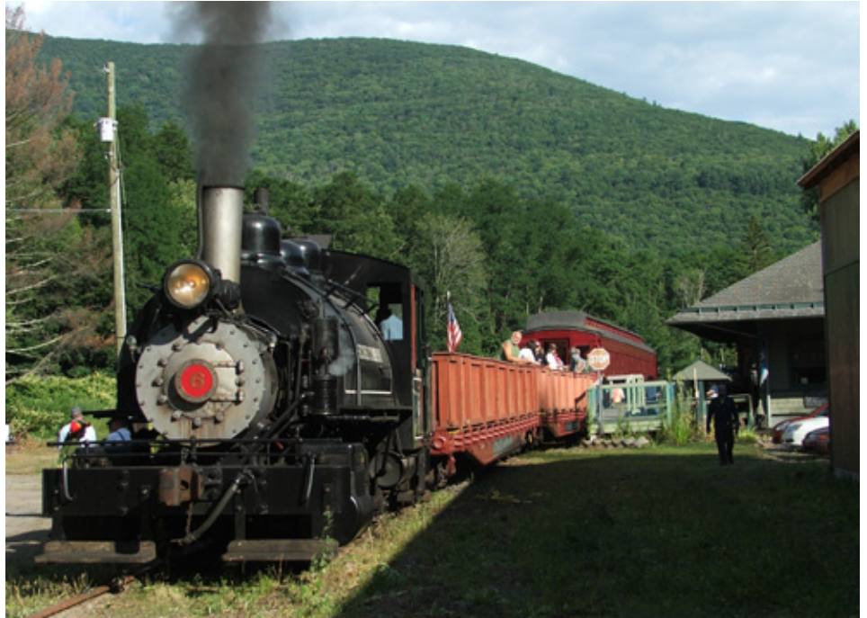
This summer's "Steam in the Catskills" event helped to bolster public support for the continued operation of the former Ulster & Delaware Railroad line.

For updates on the Catskill Mountain Railroad, and the results of the efforts of its volunteers, visit their website at http://catskillintrailroad.com .