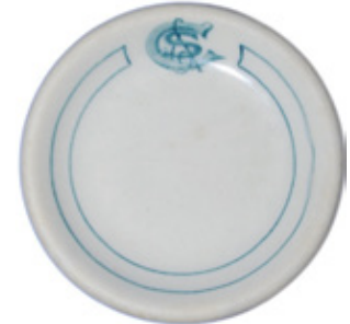
Rare Colorado & Southern Butter Pat