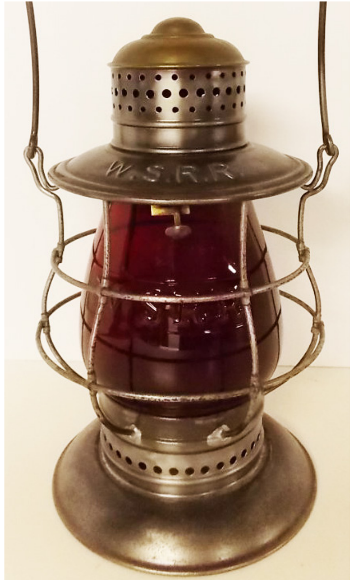
A $1200 bid was needed to purchase this West Shore Railroad brass top by Steam Gauge with red cast globe.