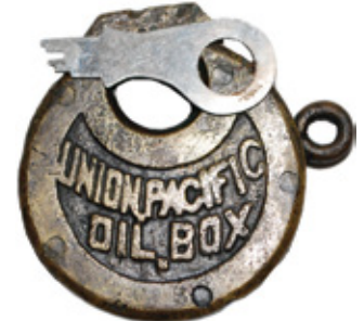
Over 50 brass locks!