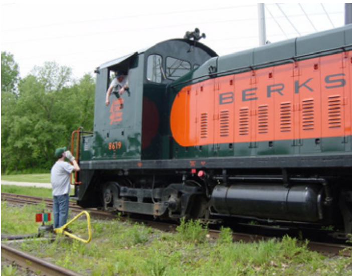
The Berkshire Scenic Railway will have Lenox and North Adams, MA locations operating in 2016.

Prior to 2012, a popular feature of the Berkshire Scenic Railway Museum in Lenox, MA was its scenic train ride over the Housatonic RR to West Stockbridge, MA. When the railroad failed to renew its operating agreement (See KL&L News #16), the museum began seeking a new line on which to run its trains. After three years of hard work, the nearby line from North Adams to Adams, MA has been rehabilitated to permit train operations, equipment has been moved to the new site, and Surface Transportation Board approval was finally issued on December 4, 2015.