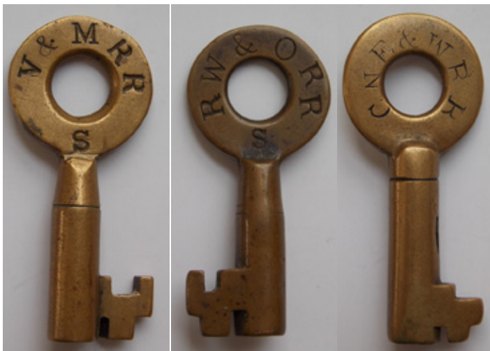
Some of the scarce switch keys in the sale: Vermont & Massachusetts ($375), Rome Watertown & Ogdensburg ($190), Central New England & Western ($350).