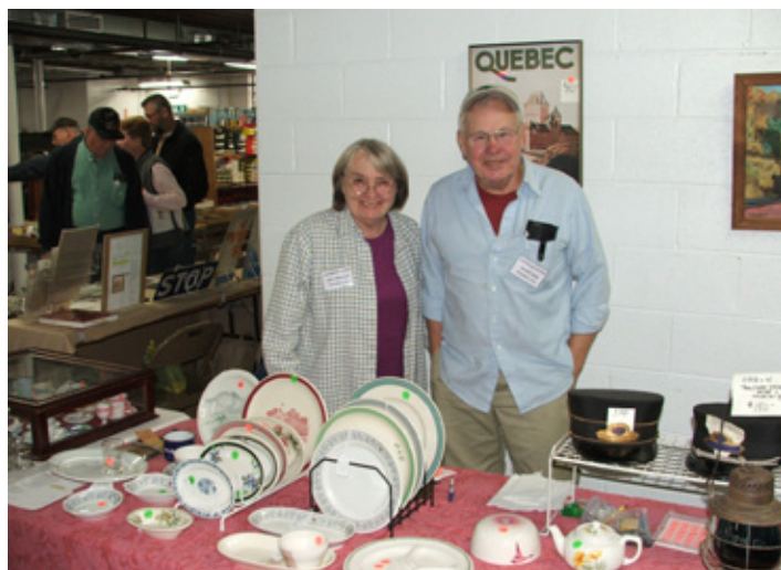
From china to lanterns and timetables, there was something for every collector at this year’s big Gaithersburg railroadians show.