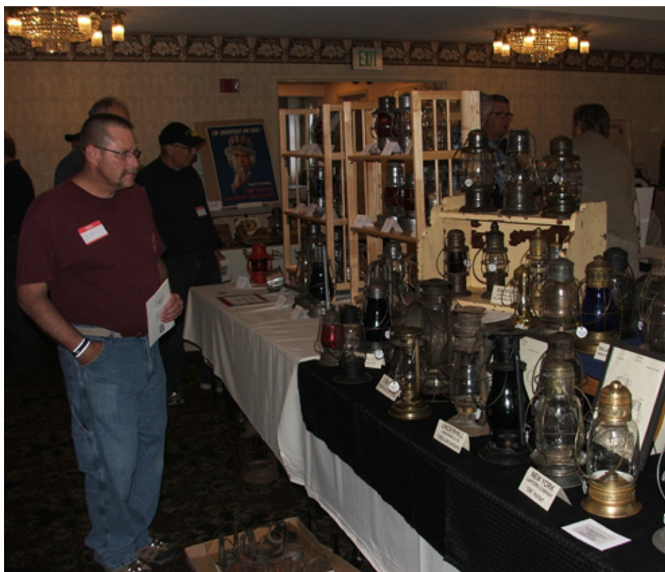
The “main event” at the annual Key, Lock & Lantern Convention is the Railroad History Exposition, with displays of transportation memorabilia, a collectors marketplace, and the popular & entertaining KL&L fundraiser sale.

following the conclusion of Railroad History Expo activities. Guest speakers and another open slide show are again planned, following dinner.