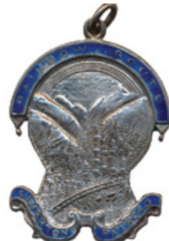
Otto Mears Fob Pass