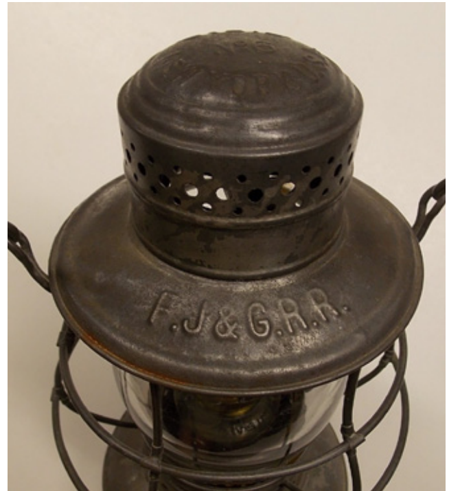
Two scarce Fonda, Johnstown & Gloversville lanterns with unmarked globes: a Dietz No.6 (above) sold for $475, and a slightly rarer Star Headlight brought $650.