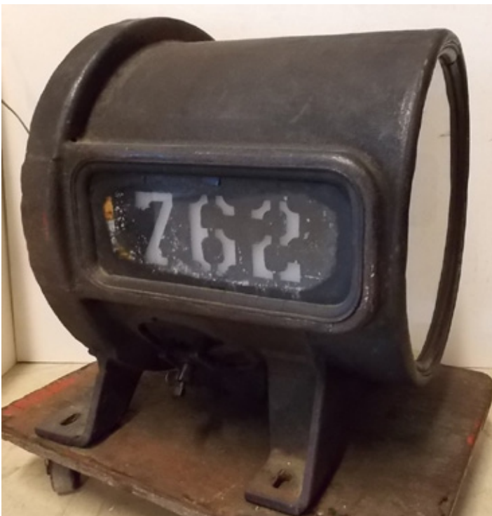
A $3200 bid took home this headlight from Pennsylvania Railroad 2-8-2 Mikado steam locomotive #762.