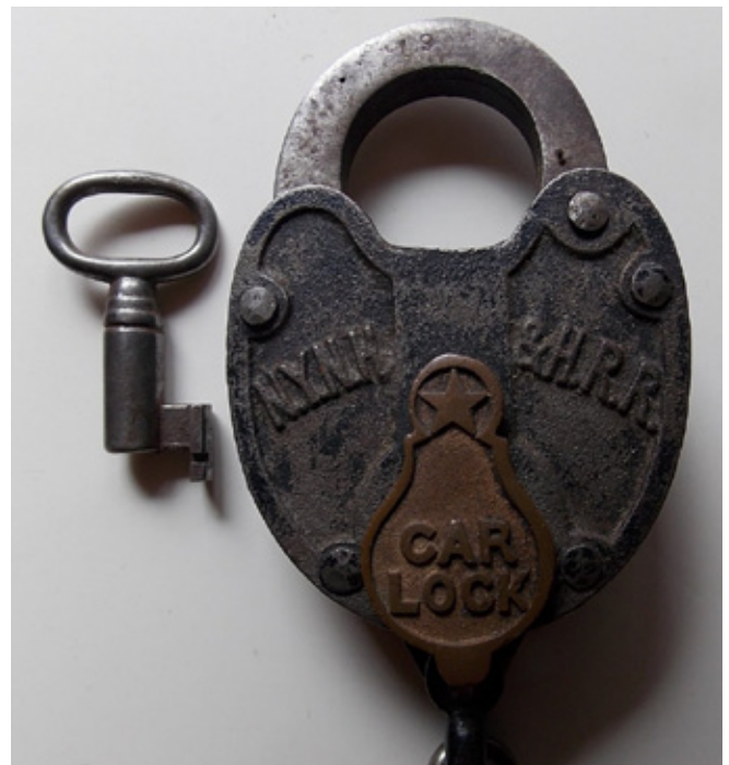
New York, New Haven & Hartford car locks are always popular, with this one with matching key selling for $190.