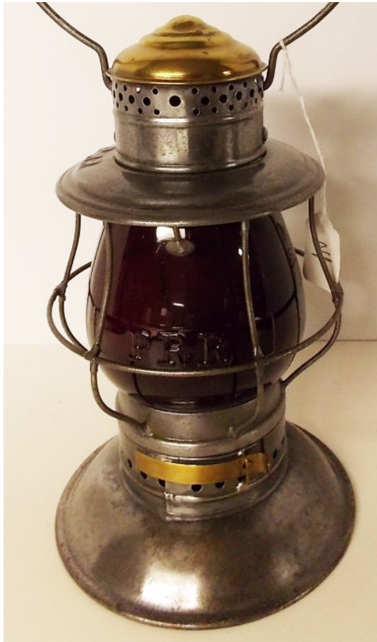
One of the many nice Pennsy lanterns in the sale, this Kelly brass top with red cast globe brought a $1600 bid.