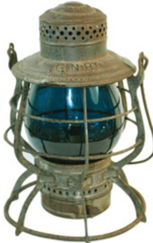
Green Cast GNRy Lantern