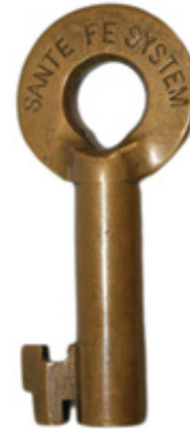
Sante Fe System Key