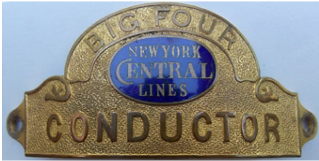
An unusual Conductor badge by J.R. Gaunt, made for the New York Central's Big Four Route sold for $160.