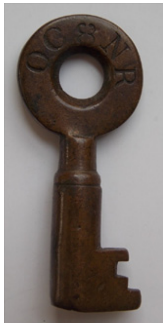
A Pittsburgh & Western key sold for $300, while a rare Old Colony & Newport key brought a high bid of $750.