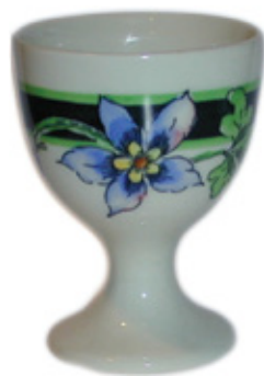
Colombine Egg Cup