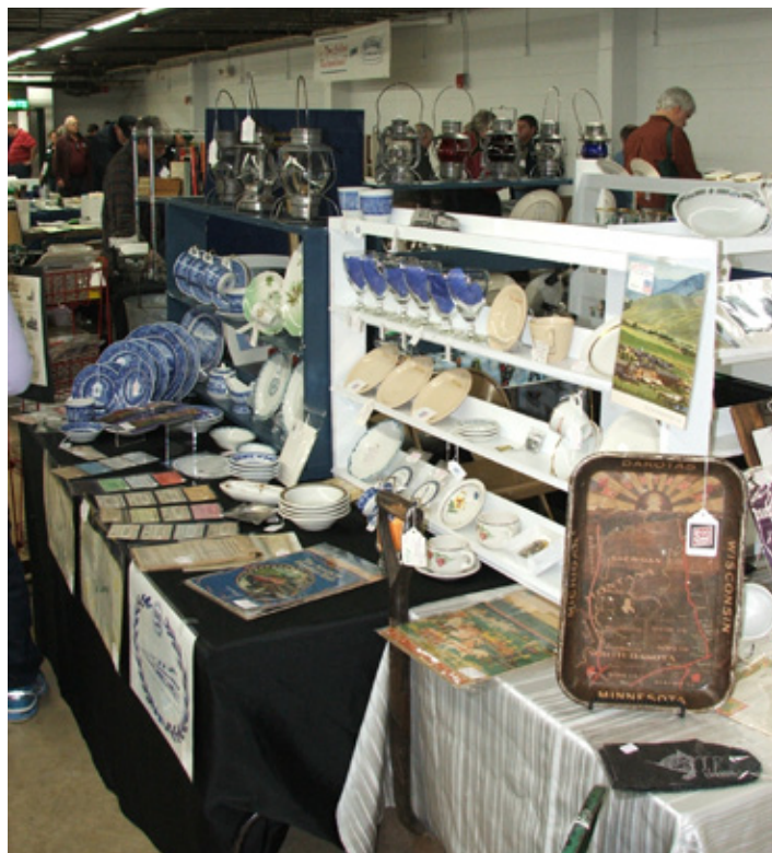
The annual Gaithersburg show is known for its “one stop shopping” opportunity for all types of transportation and railroad memorabilia.