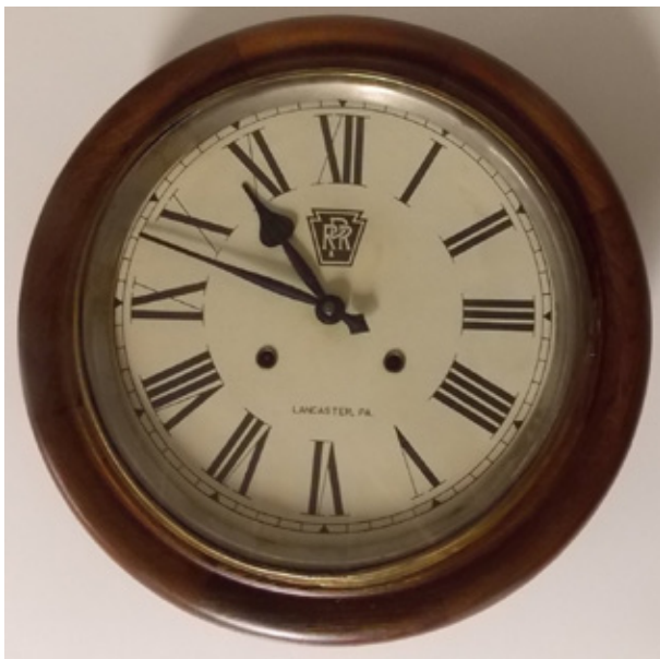
A $2000 bid was needed to purchase this Pennsylvania Railroad clock, marked with the keystone logo on the face.