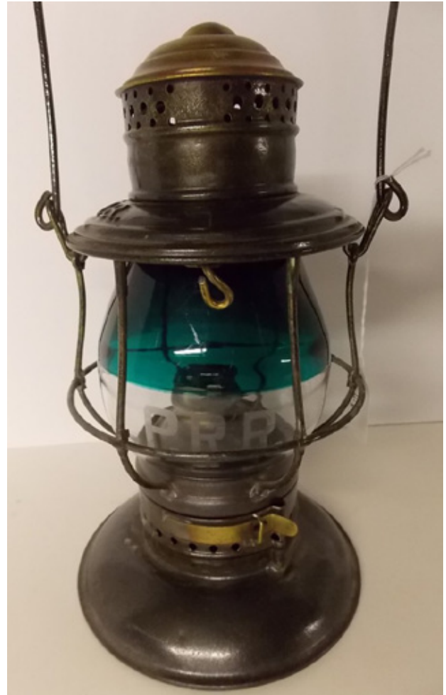
An Adams & Westlake brass top bell bottom marked PRR with a green over clear etched globe brought $1050.