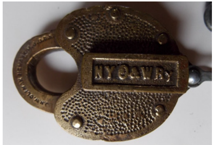
One of several rare locks in the sale, this New York Ontario & Western Railway by Climax sold for a $475 high bid.