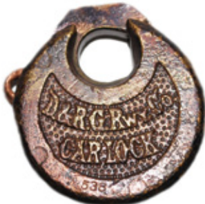
Rare D&RG Car Lock

Announcing Auction 94 Closing January 10, 2015. An amazing offering with 80 lanterns, over 100 keys, china, silver, books, builders plates, depot pieces, locomotive bell, wax sealers, cap badges, butter pats, passes, early paper and so much more. This one promises to be one of the best auctions I have had the pleasure of offering. Take a look at some of the highlights below. Printed catalogs are available for $20 each and include a complete prices realized list. Auction is hosted on my website with live on line up to date bidding as well as multiple photos of each of the pieces. Remember I guarantee authenticity on everything I sell. Website will be posted in December so if you are not already a registered bidder be sure to sign up now. Any questions don't hesitate to contact me.