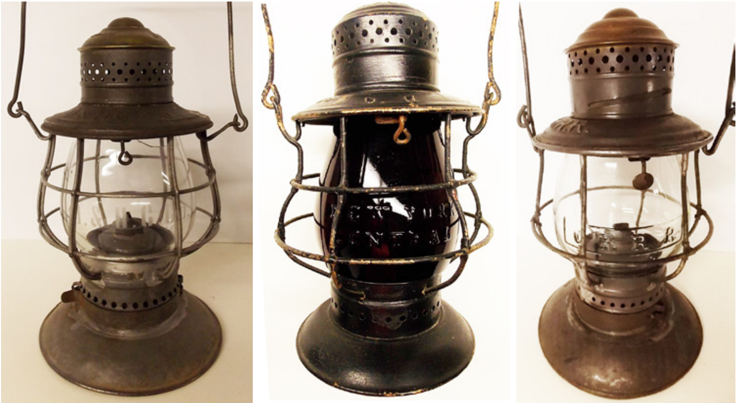
Some of the scarce lanterns: a Delaware & Hudson Canal Company C.T. Ham with cracked globe ($400), a New York Central Stock Yards No.6 with red cast globe ($600), and a Connecticut River RR A&W with clear cast globe ($850).