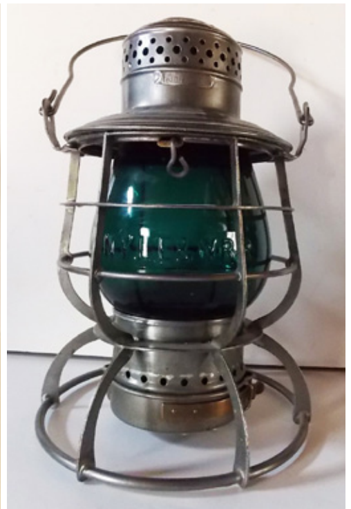
A Pennsylvania RR brass top by RR Signal Lamp & Lantern with blue cast globe ($2300), A&W New York Chicago & St. Louis with clear cast globe ($450), and a New York Lake Erie & Western with a cracked green cast globe ($375).