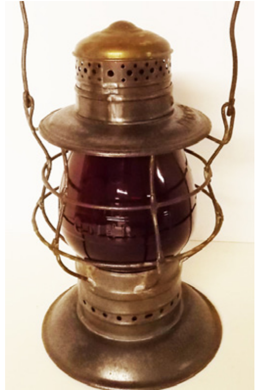
An Adams & Westlake marked RRR with red cast Rutland globe ($450), New London Northern by RR Signal Lamp & Lantern with clear cast globe ($850), and Hartford & Connecticut Western with red Central New England globe ($1300).