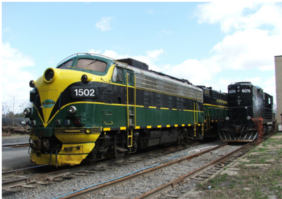
Railroad excursions were a popular event at the 2014 & 2015 Key, Lock & Lantern Conventions, and are once again planned for the 2016 meeting.