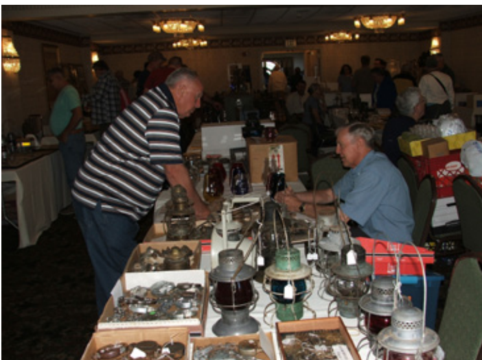
Two KL&L members who have been attending conventions for the last forty years discuss railroad history & collecting.