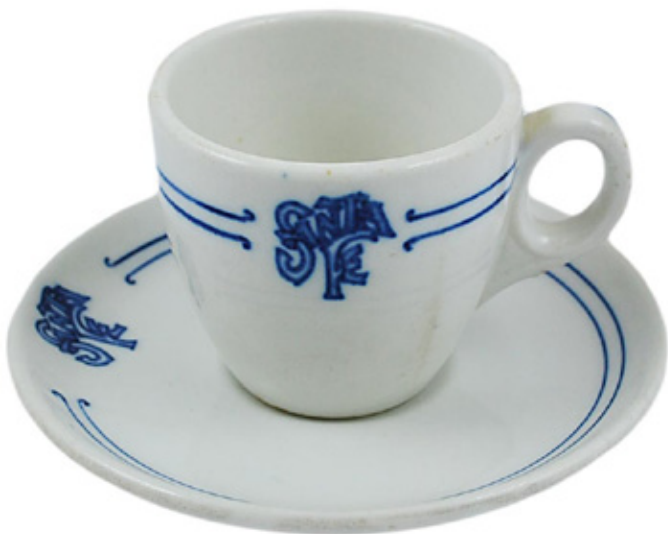
This Atchison Topeka & Santa Fe "Bleeding Blue" pattern demitasse set by Lamberton sold for a high bid of $800.

The recent Railroad Memories catalog and online auction which closed on May 10, 2015 included scarce railroadiana from eastern railroads, but as usual, it was artifacts from the popular western lines that stole the show. While collectors may be spread thin west of Chicago, there is no doubt that they are passionate about acquiring memorabilia from the railroads that opened the nation. From lanterns to china and rare paper, the Railroad Memories catalog contained plenty of material to get the attention of serious collectors. The following is a sampling of some of the more popular lots. All photos, descriptions, and prices courtesy of Railroad Memories Auctions.