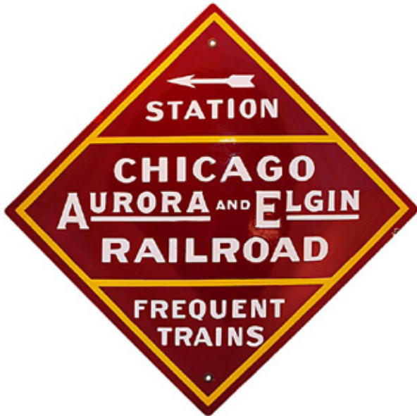
A high bid of $1100 took home this excellent condition Chicago Aurora & Elgin Railroad 24" enameled station sign.