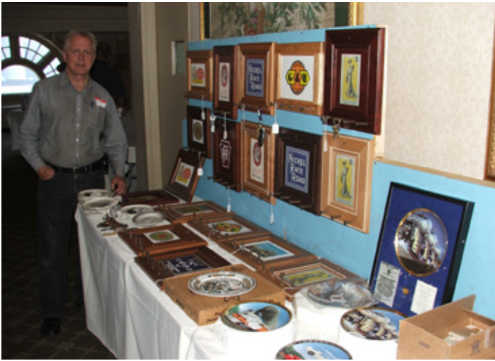
The Medina Railroad Museum was one of several railroad historical groups that exhibited at this year's convention.