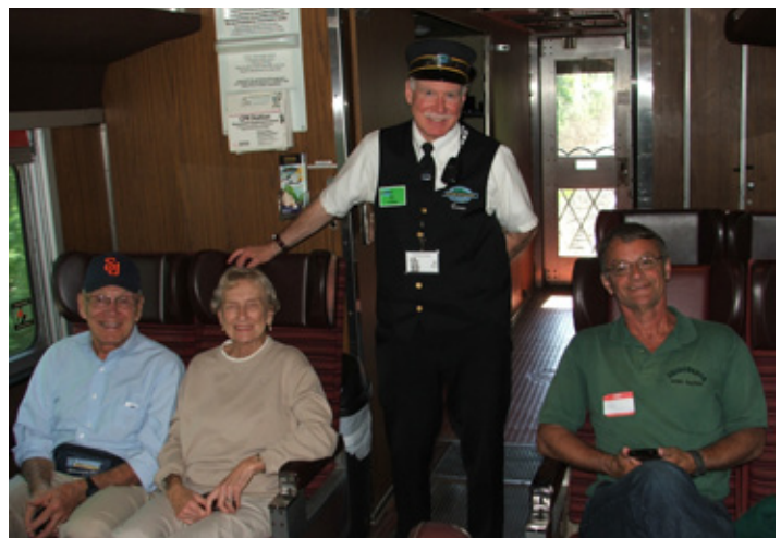
Passengers on the KL&L Dinner Express train enjoyed the trip on the Adirondack Scenic Railroad to Boonville, NY