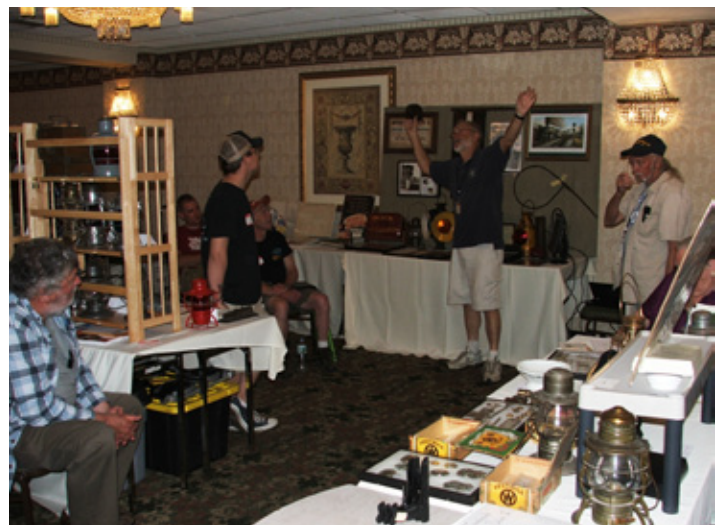
The annual fundraiser auction was an entertaining event, with over $700 donated to Key, Lock & Lantern.