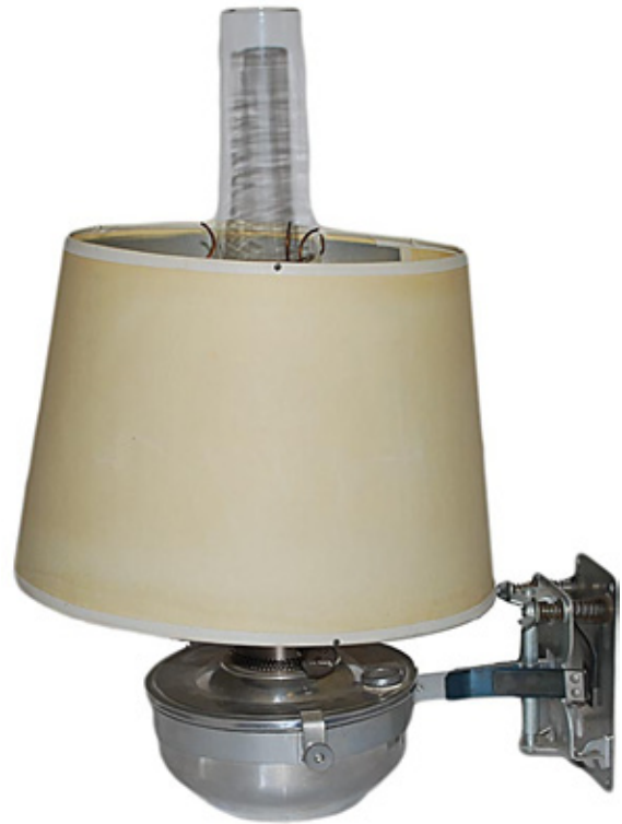
Aladdin caboose lamps are often missing one part or another. This one in complete condition sold for $140.