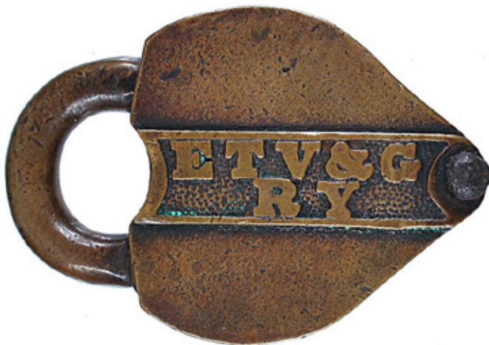
On of the artifacts from eastern roads in the sale, this lock from the East Tennessee, Virginia & Georgia Railway made by Dayton is exceptionally rare, and brought a $1150 bid.