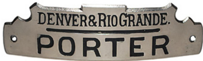
This Denver & Rio Grande Porter badge with the American Railway Supply hallmark brought in a high bid of $725.