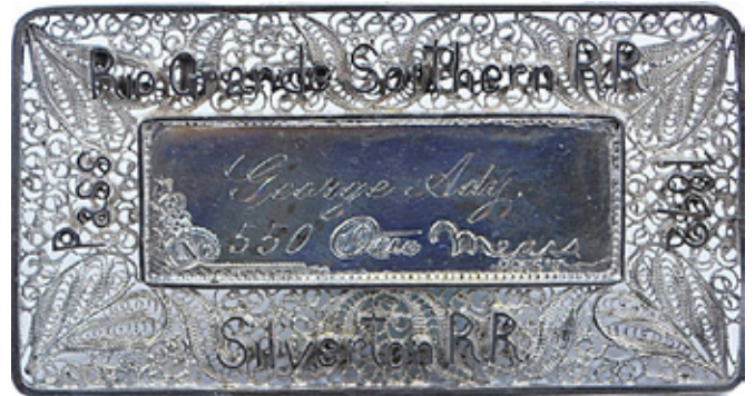
Several interesting passes were included in the sale: the 1893 Silverton RR sold for $1350 and the rare Rio Grande Southern / Silverton RR 1892 Otto Mears silver filigree issued to George Ady went to a new home for $10,500.