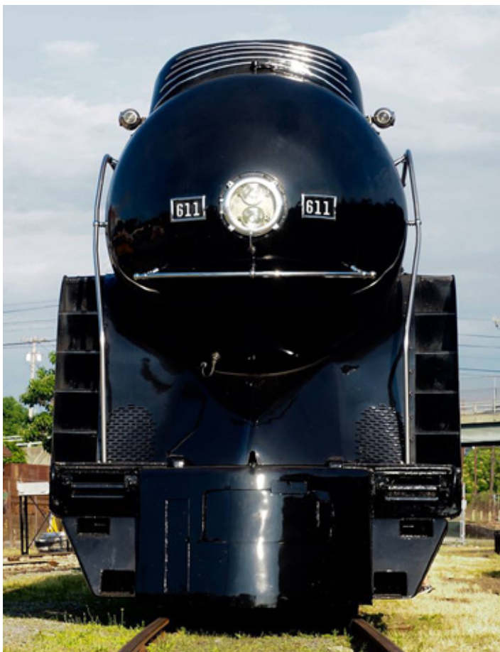
Following an overhaul at the North Carolina Transportation Museum, Norfolk Western No. 611 has returned to excursion service.

After its initial shakedown run, the 611 pulled excursions from Manassas to Riverton Jct, VA, and from Lynchburg to Petersburg, VA in June, and then between Roanoke, VA and Lynchburg in July. The historic locomotive has now concluded the 2015 season, and is back on display at the Virginia Museum of Transportation until it is fired up again for next season.