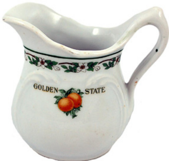
A $525 bid was needed to purchase this Chicago Rock Island & Pacific Golden State creamer by Bauscher.