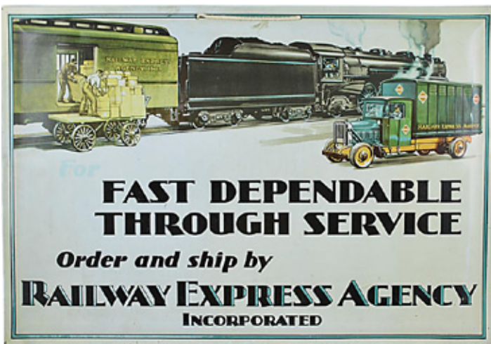
This nice example of the well-known Railway Express Agency "Fast Dependable Through Service" tin lithograph advertising sign by H.D. Beach of Coshocton, Ohio with only light discoloration & scratches brought at $320 bid.