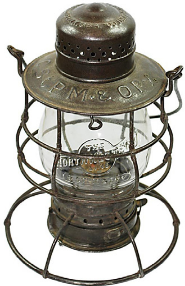
This Chicago St. Paul Minneapolis & Omaha Ry lantern by Star Headlight with a Northwestern Line globe sold for $875