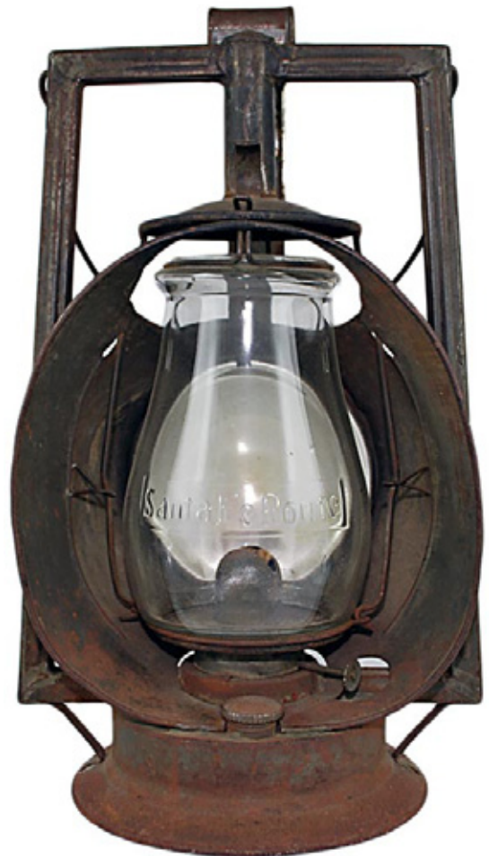
A $2300 high bid for a rusty Santa Fe Dietz Acme inspector lamp? Its all about the "Santa Fe Route" cast globe!