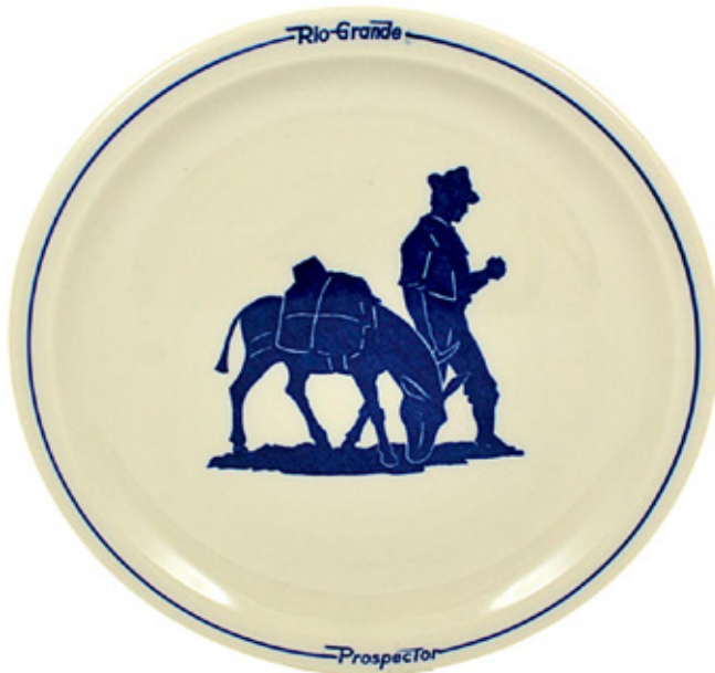
This Denver & Rio Grande Prospector 9" dinner plate is fairly rare, so the $4000 high bid isn't too surprising.