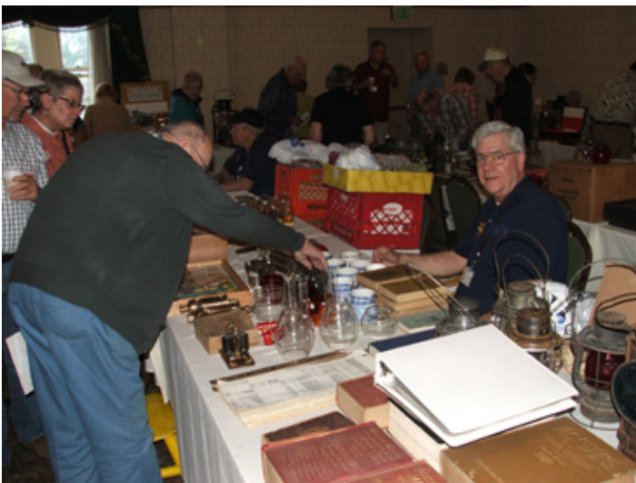
The Railroad History Exposition is the “main event” at the KL&L Convention, with over fifty tables of displays and railroiana for sale or trade in the exhibit hall this year.