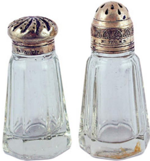
A high bid of $440 was needed to purchase this nice pair of Northern Pacific Railroad salt and pepper shakers.