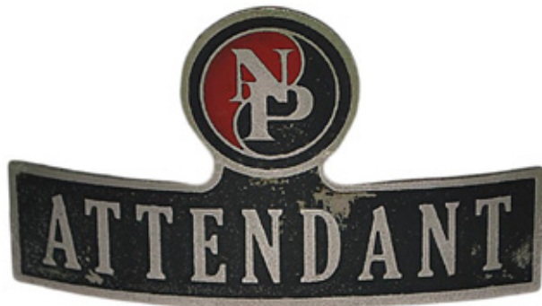
A nice Northern Pacific monad logo Attendant cap badge with some wear to the enamel still sold for $480.