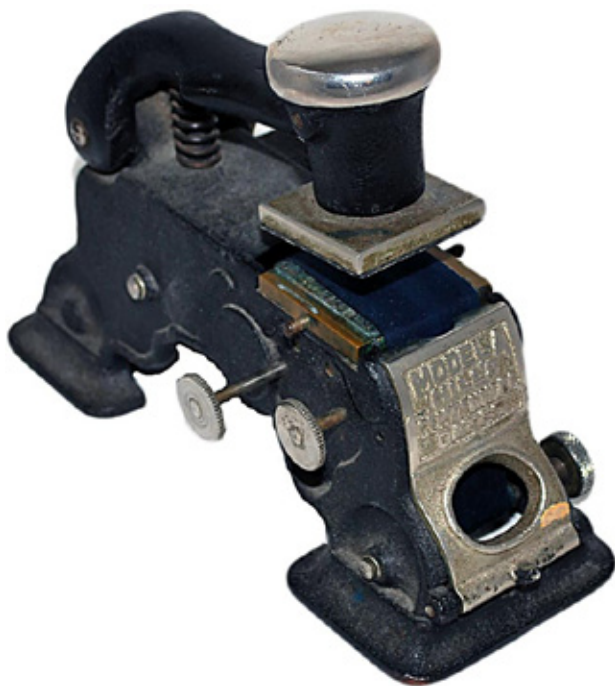
This Centennial ticket dater with a marked Wabash shoe and Grand Trunk / CN Kansas City die sold for $250.