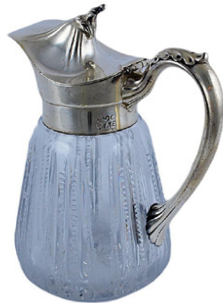
A $400 bid took home this beautiful cut glass syrup pitcher with an engraved Soo Line "Dollar" logo on the top.