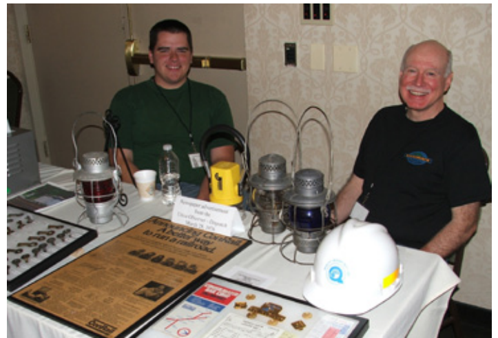
The KL&L Convention provides an excellent opportunity to visit with fellow railroad historians and collectors.