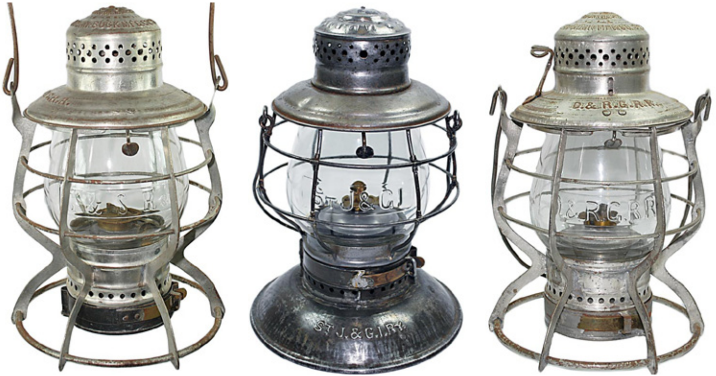
Some of the lanterns in the sale: Colorado & Southern Handlan Buck with clear cast globe ($2350), St. Joseph & Grand Island MM Buck with clear cast globe ($3200) and Denver & Rio Grande Handlan Buck with clear cast globe ($2600).