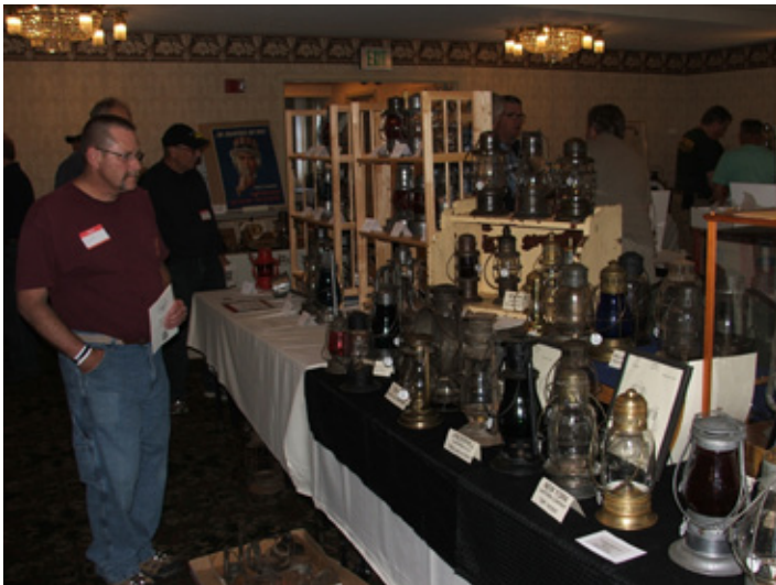
Visitors to the KL&L Railroad History Expo enjoy one of the many museum quality displays of lanterns and railroadiana.

Prior to departure, the Leatherstocking Railway Historical Society, operator of the railroad, arranged a display and demonstration of rolling stock at their Milford, NY depot museum, including a Jordan Spreader, former Delaware & Hudson wrecking crane, and track speeders.