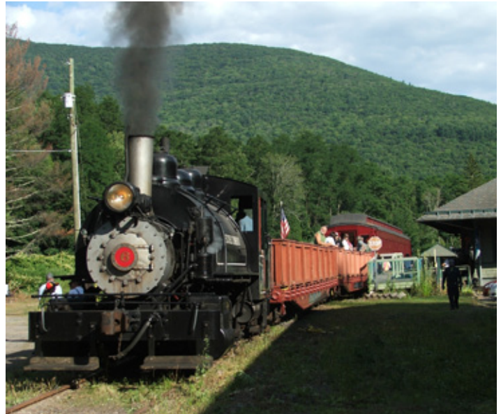
Steam returned to the Catskill Mountains in August 2015, with Viscose #6 pulling Catskill Mountain Railroad trains into the Phoenicia, NY station.

Regular diesel hauled trips will now return to the Phoenicia to Mt. Tremper run for the fall foliage season, while the Kingston trips will operate for the remainder of September. Popular "Polar Express" trains will once again be offered in Kingston during this upcoming holiday season, as well. For more information about Catskill Mountain RR schedules, and how we can help to stop the misguided plan to abandon the railroad, visit www.catskillmtrailroad.com .