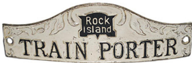
Another nice Rock Island artifact, this "Train Porter" uniform cap badge with logo and vine design sold for $500.