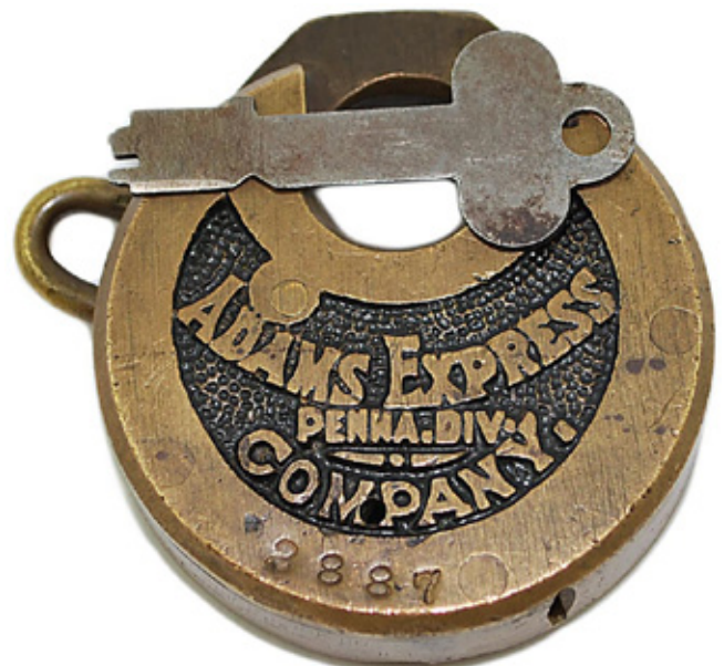
This nice Adams Express Pennsylvania Division pancake lock by Miller, with key, went to a new home for $1500.