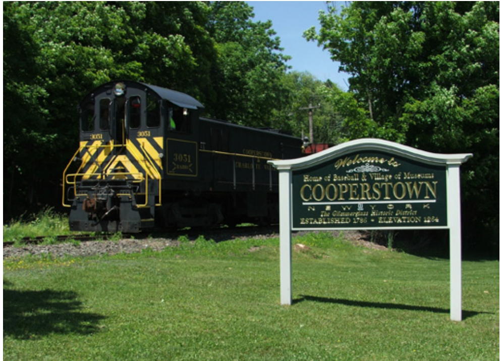
The Key, Lock & Lantern railfan charter train on the Cooperstown & Charlotte Valley RR operates over some rare mileage on the recently restored section of track into the village of Cooperstown, NY on June 7th.

A number of organizations exhibited as well, including the NRHS Utica & Mohawk Valley Chapter, the Medina Railroad Museum, the National Association of Timetable Collectors, and the Adirondack Scenic Railroad. Of course, there were dozens of tables of railroiana for sale or trade, with a diverse selection of hardware, china, paper, and parts available. Most everyone who attended went home with something new for their collection.