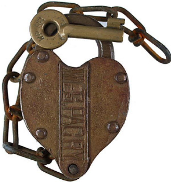
A $1200 bid purchased this Western Pacific Railway brass heart lock with matching WPRR Adlake switch key.