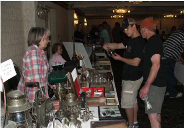
In addition to the many displays, there were dozens of tables of interesting railroad artifacts for sale or trade.