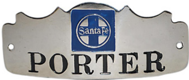
Another nice Porter badge, this one with an enameled Santa Fe logo, went to the high bidder for $340.