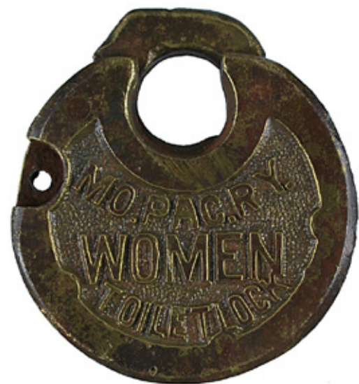
A $575 bid was needed to purchase this unusual Missouri Pacific Railway brass pancake "Women Toilet Lock."