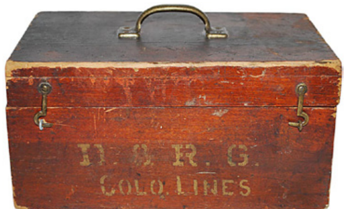
An interesting item, this Denver & Rio Grande Colorado Lines wooden conductors box sold for a reasonable $180.