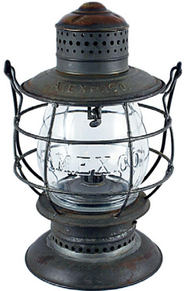
A bid of $1700 was needed to take home this American Express Company lantern with a clear cast globe.