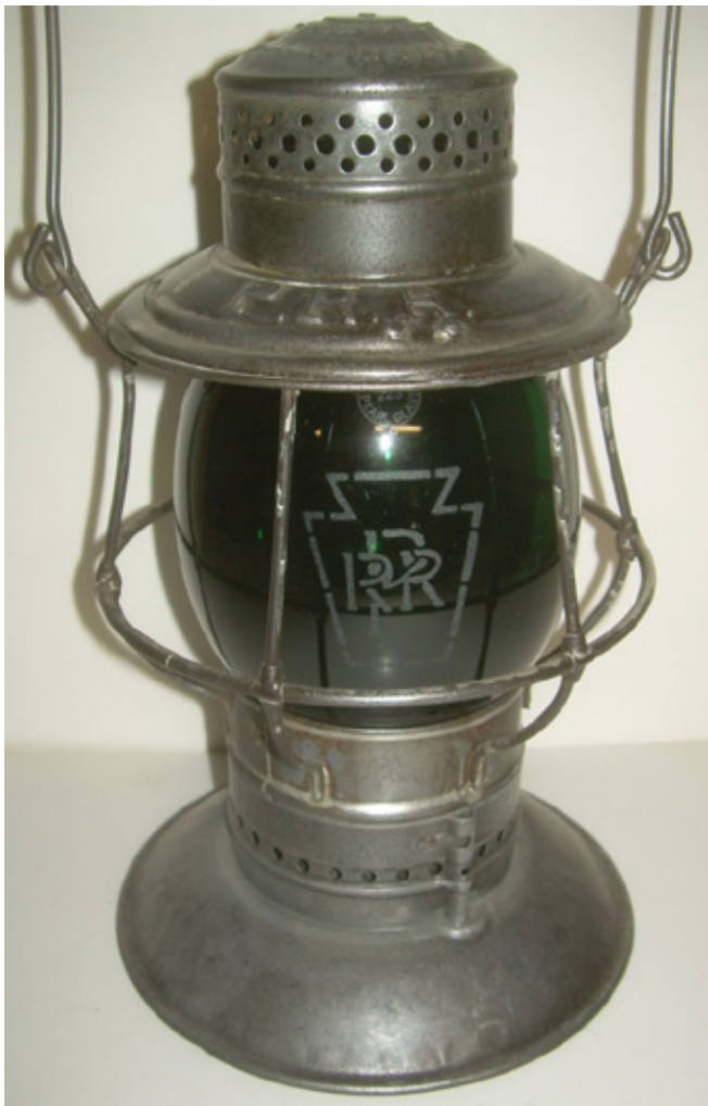
A nice PRR Adams & Westlake with a green keystone logo etched Macbeth mellon style globe sold for $650.