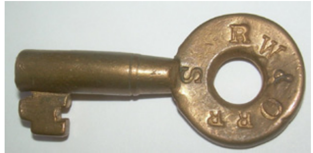
A $140 bid was needed to purchase this scarce switch key from the Rome Watertown & Ogdensburg Railroad.