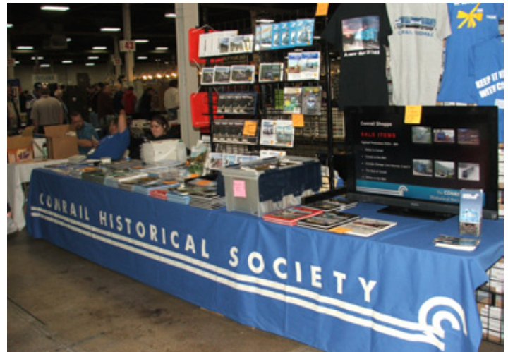
The Conrail Historical Society offered a variety of souvenirs and some good deals on authentic Conrail memorabilia.

The Amherst Railway Society is a non-profit organization with about 450 members who share an interest in the many aspects of the railroad hobby. Proceeds from the show not only support the activities of the organization, but are also donated to other railroad preservation projects. Overall, there was an excellent mix of dealers and exhibitors this year, representing every segment of the railroad hobby. Introducing the excitement of railroading to new participants has always been an important goal of the event sponsors, and the Springfield show certainly succeeds at it.