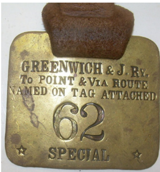
A $110 bid was needed to purchase this baggage tag from Delaware & Hudson affiliate Greenwich & Johnsonville RR.