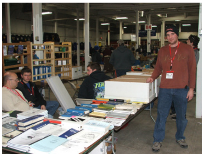
While most vendors offered model supplies, a number of railroadiana dealers set up tables at the Springfield show.

On Sunday, the usual family crowd returned to the show, viewing the over two dozen huge model train layouts and