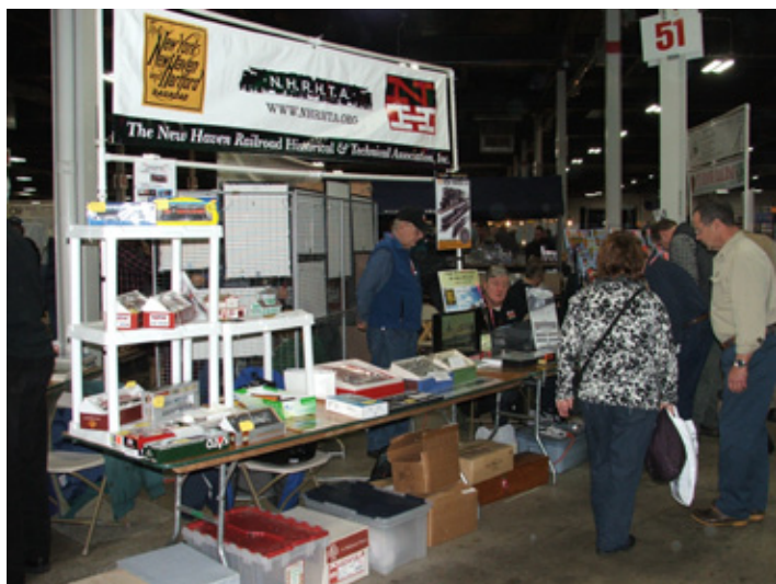
The New Haven Railroad Historical & Technical Association was one of many historical societies exhibiting at the show.

when the show opened, a foot of snow already covered the parking lots. Those who braved the treacherous roads found only a short line of cars at the entrance to the fairgrounds, where there is usually a mile-long traffic jam. Despite the storm, about 5000 of the most serious railroad fans made their way through the snow to attend the show on Saturday.