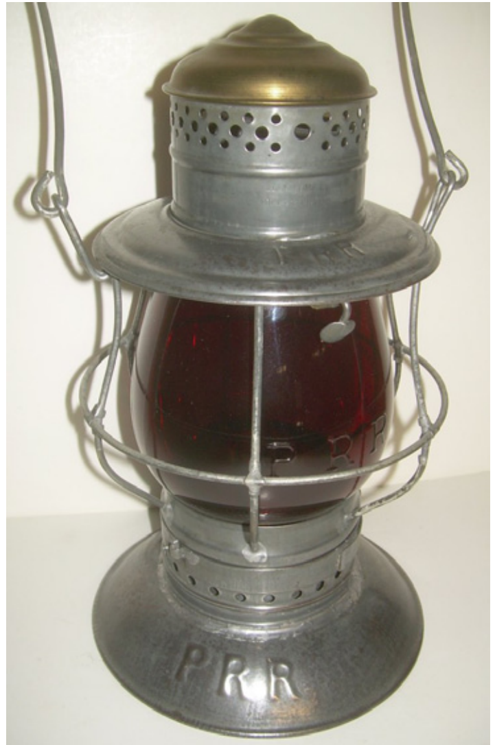
A nice triple marked Pennsylvania Railroad brasstop by Kelly, with a red cast Macbeth globe sold for $850.