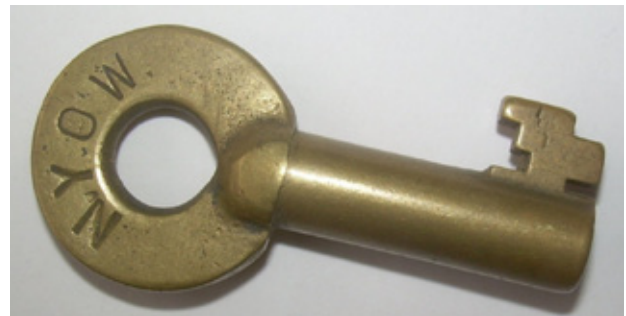
A $110 high bid took home this Adlake switch key marked for the popular New York Ontario & Western Railway.