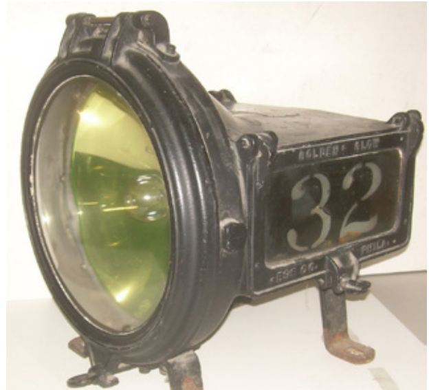
A $1700 bid was needed to purchase this Golden Glow headlight from Bangor & Aroostook locomotive #32, which was a first generation diesel off the New Haven RR.