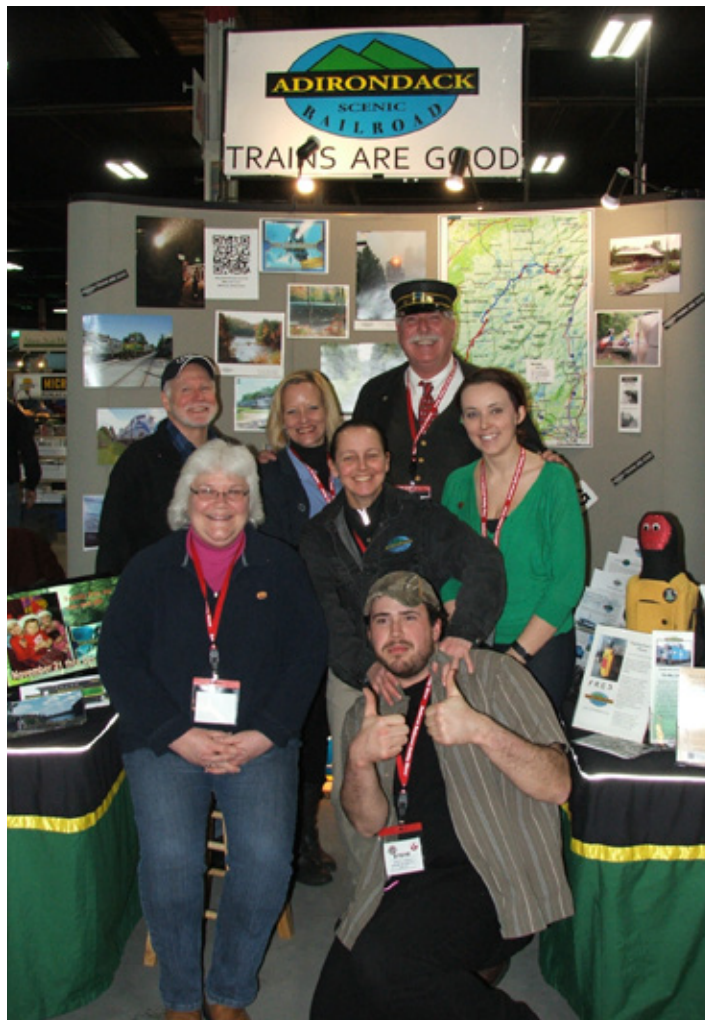
The Adirondack Scenic Railroad was one of many tourist railroads and museums exhibiting at the show. The 2015 Key, Lock & Lantern Convention will include a rare mileage excursion on this line from Utica to Boonville, New York.