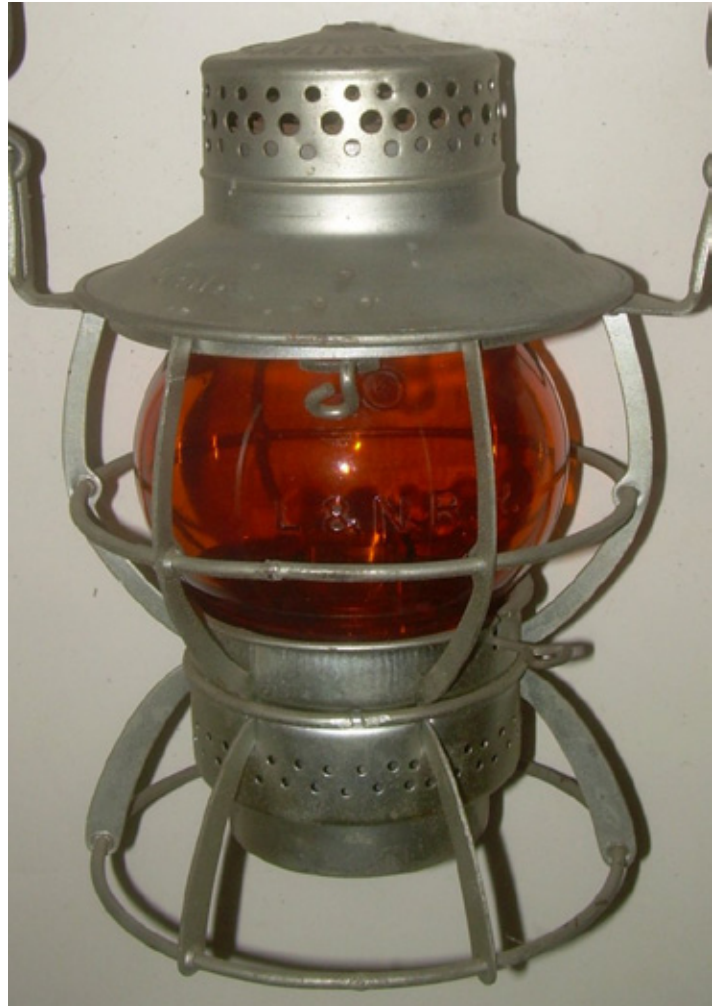
A Louisville & Nashville Dressel short globe lantern with a cast "L&N RR" amber globe sold for a high bid of $180

With internet bidding, the sale prices of railroadiana from southern and western roads rivaled that of local memorabilia from New England. While there were a few deals, most lots brought relatively high bids. The sale of the lantern and pass collections will continue in the next installment in April. Photos, descriptions, and prices are courtesy of Brookline Auction Gallery and do not include buyers premium.