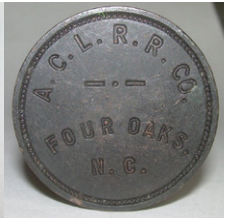
Providing a direct connection with a specific location on the railroad, dater dies and wax sealers are highly sought after by collectors. The New Haven wax sealer from Winsted, Connecticut sold for $1100, while the Boston & Maine dater die from Beverly, MA brought $100, and the Atlantic Coast Line Four Oaks, NC sealer $375. Photos continued on Page 14.