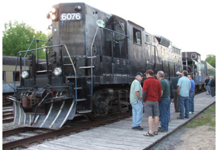
Key Lock & Lantern members inspect the Adirondack Scenic Railroad locomotive during the layover at Remsen depot on the 2014 KL&L Convention excursion.

Registration information will be sent to KL&L members in the next issue of the magazine, and will be posted on the KL&L website when the convention schedule is finalized over the next week or two. Online registration will once again be available, with payment through Paypal. Complete information about the various activities will be available at www.klnl.org and an announcement will be made on the Key Lock & Lantern Facebook page when registration is open.