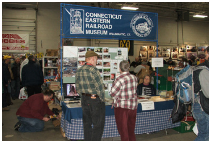
Railroad museums from around the northeast introduced themselves to potential visitors at the Springfield show.

As the weekend of the show approached, a small weather system that was expected to bring light snow to the region combined with an area of low pressure to form a classic nor'easter storm. By the morning of Saturday, January 24th,