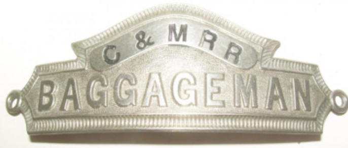
A "Baggageman" uniform cap badge from Boston & Maine predecessor Concord & Montreal Railroad sold for $160.