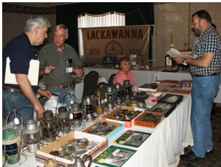
In addition to displays, the Railroad History Expo includes a railroadiana collectors market, with a variety of authentic railroad memorabilia offered by members for sale or trade.

will retrace the route of last year’s trip to Remsen, and will then continue up the freight-only former New York Central line to the canal town of Boonville, NY. The train’s arrival time of approximately 5:30 pm will allow passengers to dine in one of the town’s historic inns. Following dinner, the train will return to Utica, arriving by 9:00 pm.