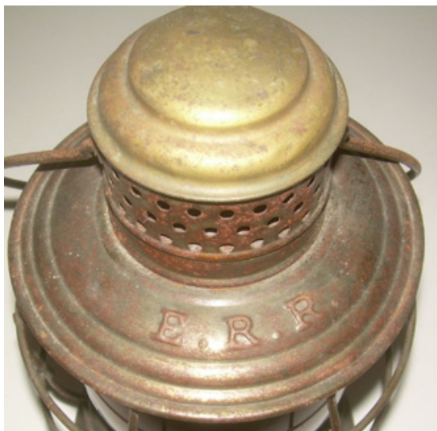
A nice Parmelee & Bonnell brass top bellbottom marked "ERR" for the Eastern Railroad, with an unmarked red barrel globe went to a new home for a $700 high bid