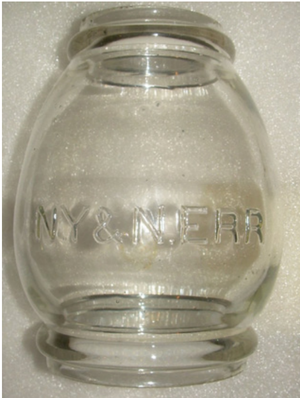
This clear cast New York & New England Railroad barrel globe went to a new home for a high bid of $210