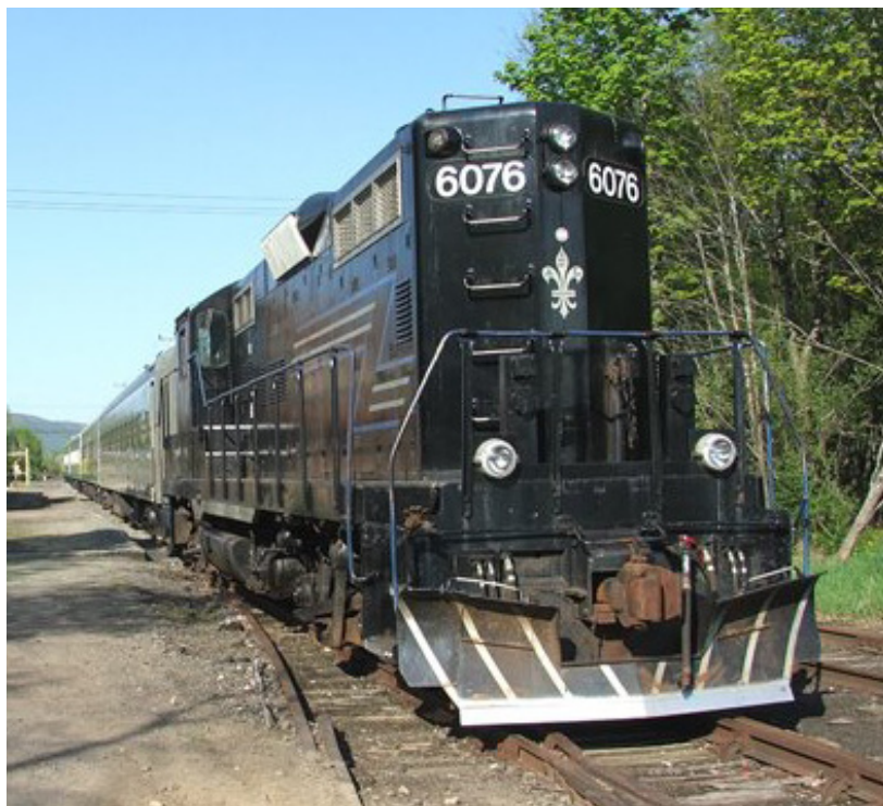
A specially chartered Adirondack Scenic Railroad train will take convention attendees on a round trip excursion on the former New York Central line to Boonville, NY for dinner on Saturday evening.

On Saturday, June 6th, the Railroad History Exposition will open to KL&L members for setup in the Saranac Room at 8:00 am. From 10:00 am to 2:00 pm, the exhibit hall is open to all interested railroad history buffs and collectors, with