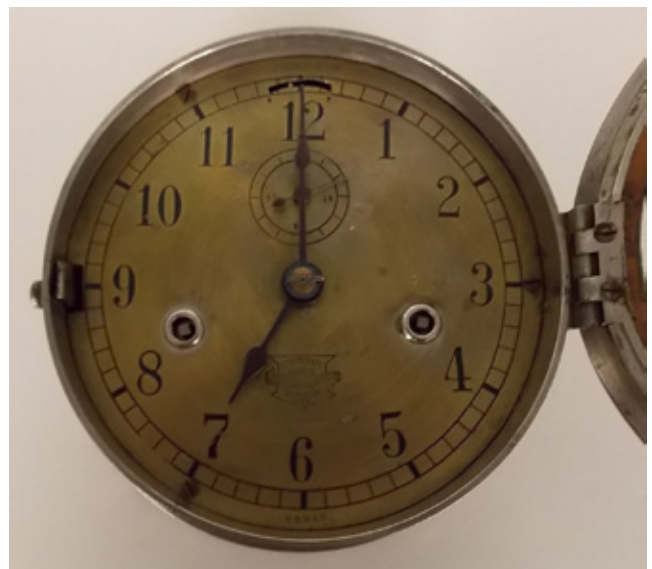
A $550 bid took home this New York Central & Hudson River Railroad marked Seth Thomas clock.