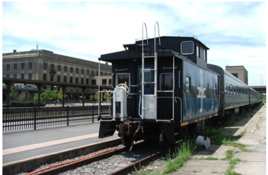
The KL&L excursion train will depart from Utica Union Station, located only a few blocks from convention headquarters at the Hotel Utica.

At 4:00 pm, a specially chartered Key, Lock & Lantern excursion will depart from Utica Union Station, which is conveniently located a few blocks from the hotel. The train