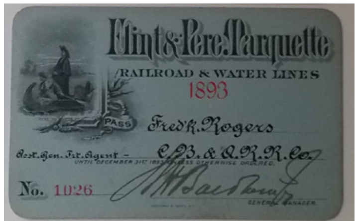
A set of 1892 & 1893 annual passes from the Flint & Pere Marquette Railroad (and related water lines) sold for $80.