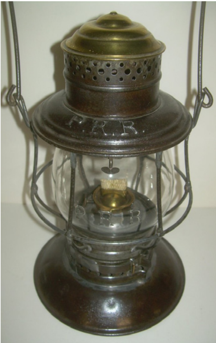
This Pennsylvania RR brass top bellbottom lantern with a clear cast MacBeth globe went to a new home for $350.