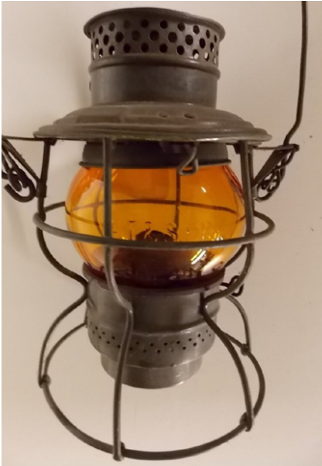
Adlake short globe lanterns usually don't command very high prices, but this example from the Santa Fe included an amber "AT&SF RY" cast globe, selling for $700.