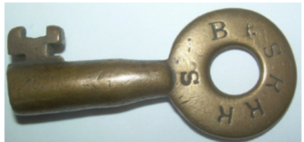
A switch key from Maine narrow gauge Bridgton & Saco River Railroad by Williams Page & Co. sold for $300.