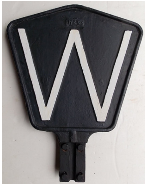
A nice cast iron "W" whistle post sign from the Norfolk & Western Railway sold for a reasonable bid of $120.