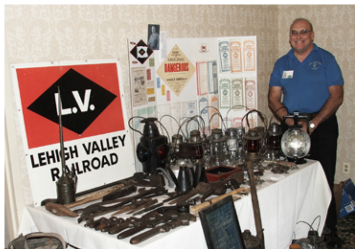
The Railroad History Expo features displays of railroad artifacts arranged by Key, Lock & Lantern members.

a $7 registration fee collected at the door. As in the past, members will have arranged a variety of railroad history exhibits with original railroad artifacts on display. Collectors of railroadiana will also find a variety of memorabilia for sale or trade, including lanterns, dining car china, and timetables. All attendees will have the opportunity to vote for the “Best in Show” award to be presented to the member with the best overall display.