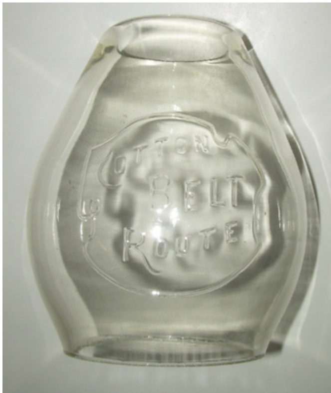
This superb Cotton Belt Route logo globe came in an Adlake reliable "StL&SWRy" lantern for a bid of $650.