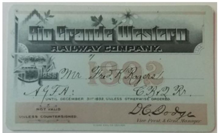
A $160 bid was needed to take home this nice Rio Grande Western Railway 1892 annual pass with a tiny vignette.