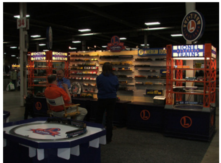
Springfield is part trade show, with displays by major national suppliers such as Walthers, Kalmbach, and Lionel.