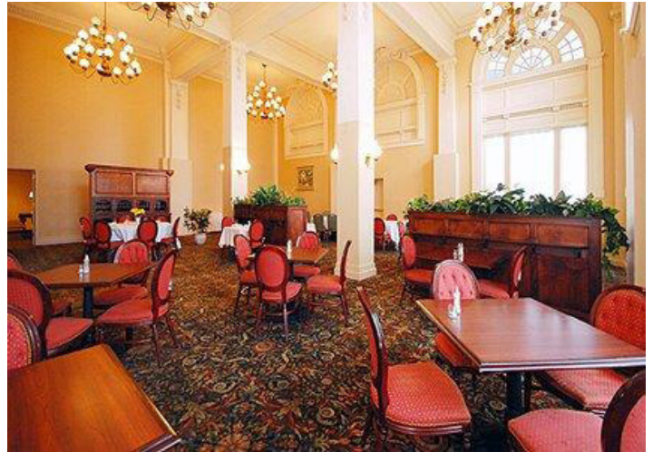
The 2015 KL&L Convention will once again be held at the luxurious 1912 Hotel Utica in downtown Utica, NY.

Utica is still an important railroad junction today, with CSX trains dropping cars for the regional Mohawk, Adirondack & Northern and New York, Susquehanna & Western lines. The MA&N operates the old Utica & Black River route, that once stretched to the shores of Lake Ontario, while the "Susie Q" heads south over a former Delaware, Lackawanna & Western Railroad branch that once connected to the