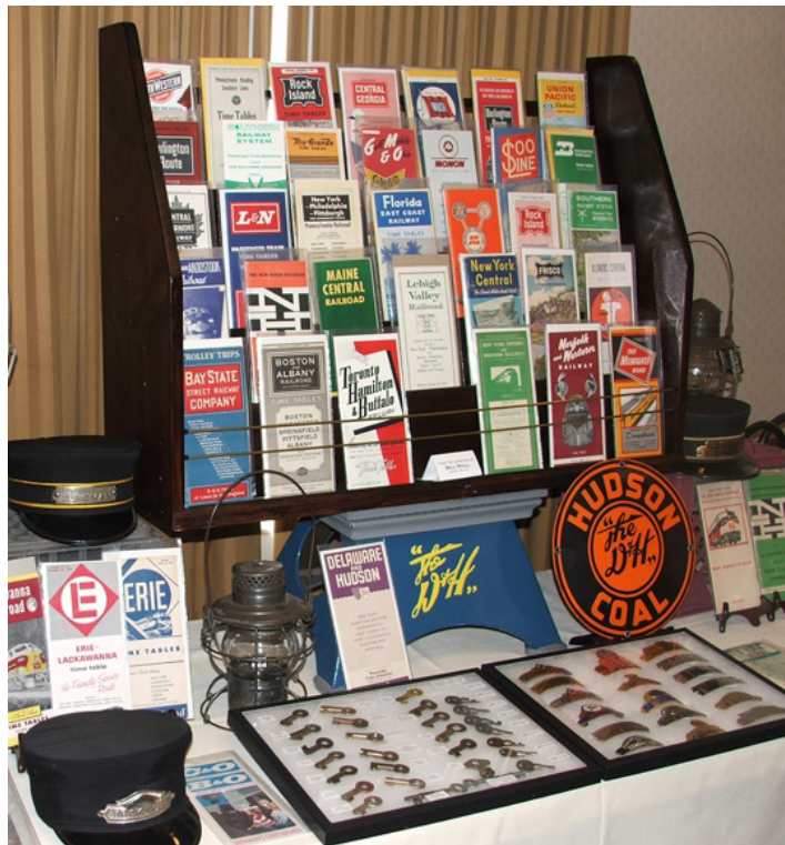
Exhibits at the KL&L Convention include a variety of memorabilia, from hardware to paper and photos.

DL&W mainline in Binghamton. Passengers can still make a cross platform transfer from Amtrak's Empire Service trains to the vintage equipment of the Adirondack Scenic Railroad, for a trip to Old Forge or Big Moose. While the days of wood burners in the Utica roundhouse are long gone, the city has retained much of its "railroad town" atmosphere.