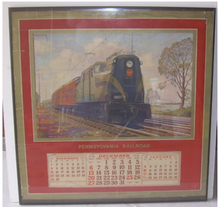
The auction included a large collection of framed PRR calendars, which sold in the $60 to $120 price range.