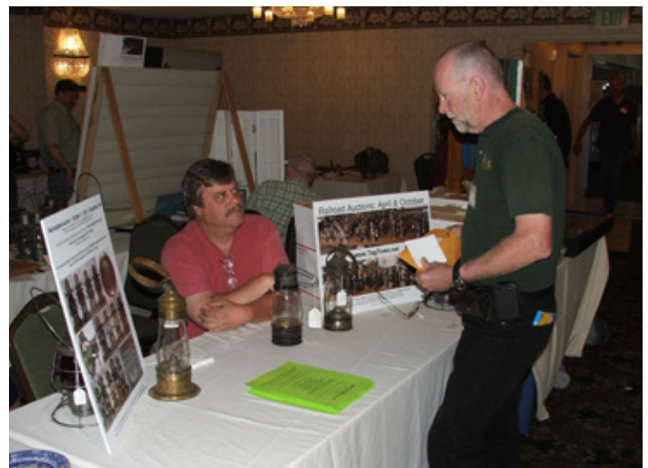
Meeting fellow railroad historians and collectors, and sharing information is an important part of the convention.