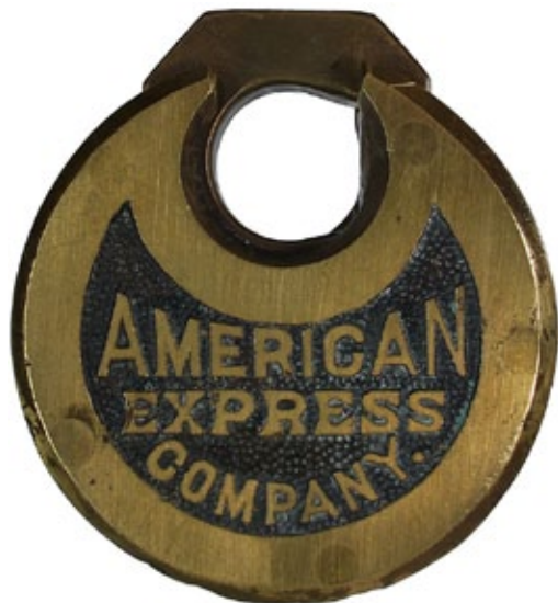
A $1650 bid was needed to take home this rare six lever brass lock marked "American Express Company."

Railroad Museums & Historical Societies Send in news & photos to KEY LOCK & LANTERN