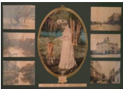
Depot Print Titled 'Katy at San Antonio' with MK&T logo