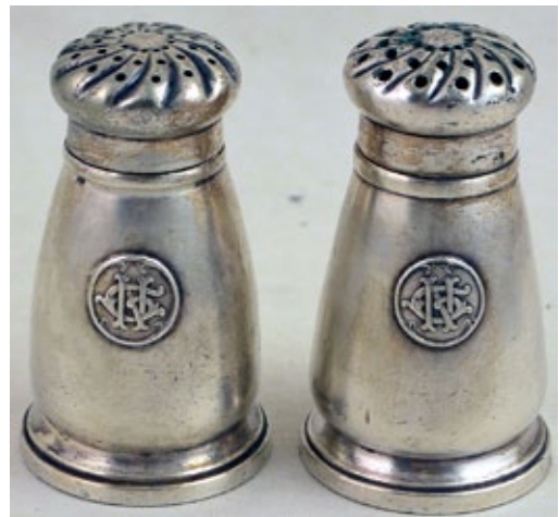
A nice pair of Great Northern Railway salt and pepper shakers by International Silver sold for $400.