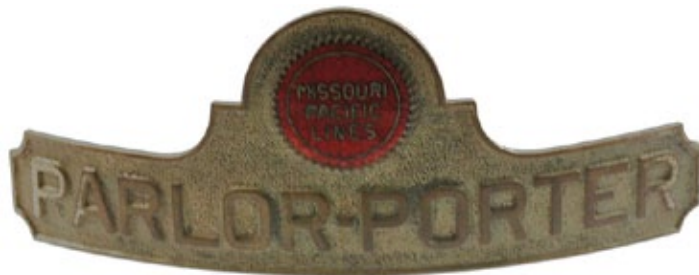
The scarce occupation of Missouri Pacific Lines Parlor Porter brought a $900 high bid for this Robbins badge.