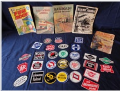
Railroad Comic Books/Collector Tins

Early 1900's through 1970's railroad memorabilia including railroad magazines, catalogs, time tables, comic books, photographs, booklets, pamphlets, newsletters, collectibles, newspaper clippings, VHS tapes, buttons, books & MORE!