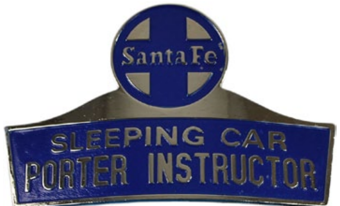
A $2300 bid was needed to purchase this rare and unusual Santa Fe Sleeping Car Porter Instructor uniform cap badge.