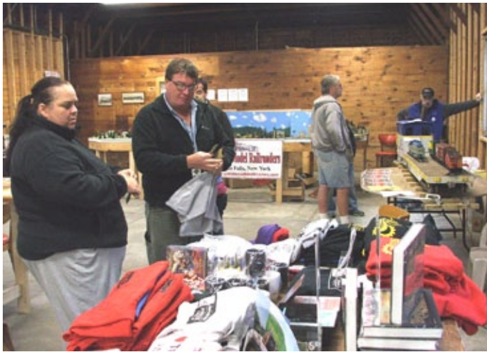
The Alco Historical & Technical Society offered a variety of books and souvenirs for sale at the 2014 D&H Rail Fair.

While the weather didn't cooperate as well as it did for last year's event, it made getting out of the rain and into the train show all the more enjoyable. Everyone who attended is already looking forward to next year's D&H Rail Fair, and additional events are being considered for the spring, as well. For more information about the North Creek Depot Museum, visit their website at www.northcreekdepotmuseum.com , and for excursion train schedules, visit the Saratoga & North Creek Railroad website at www.snccr.com .