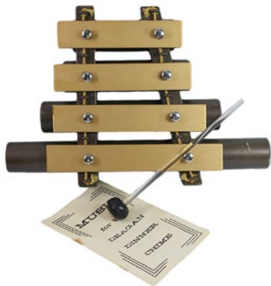
A $625 bid took home this Deagan dining car chime, with mallet and music, hallmarked J.C Deagan, Inc., Chicago.