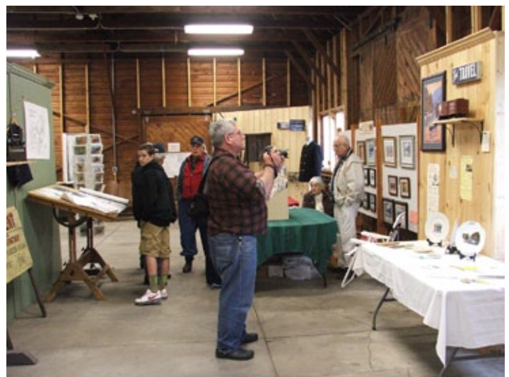
The train show at the North Creek Rail Fair gets bigger and better every year. Here, visitors enjoy the railroadiana displays and make purchases from the vendors.