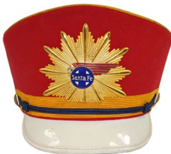
A $2050 bid was needed to purchase this unusual Santa Fe warbonnet logo marching band cap, made by Oswald Uniform of Staten Island, NY, with owner's name inside.