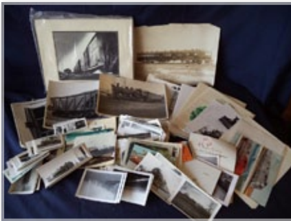
Vintage Post Cards & Photographs