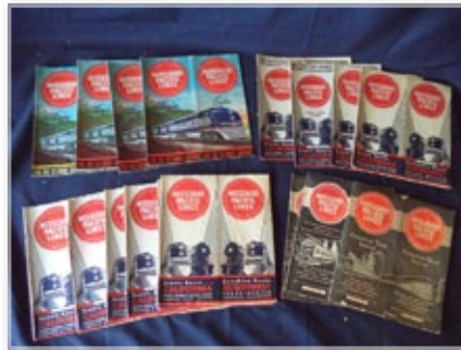
Missouri Pacific Line Time Tables