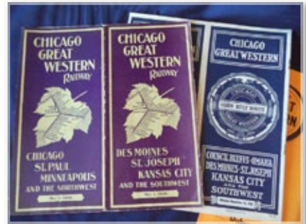
Chicago Time Tables