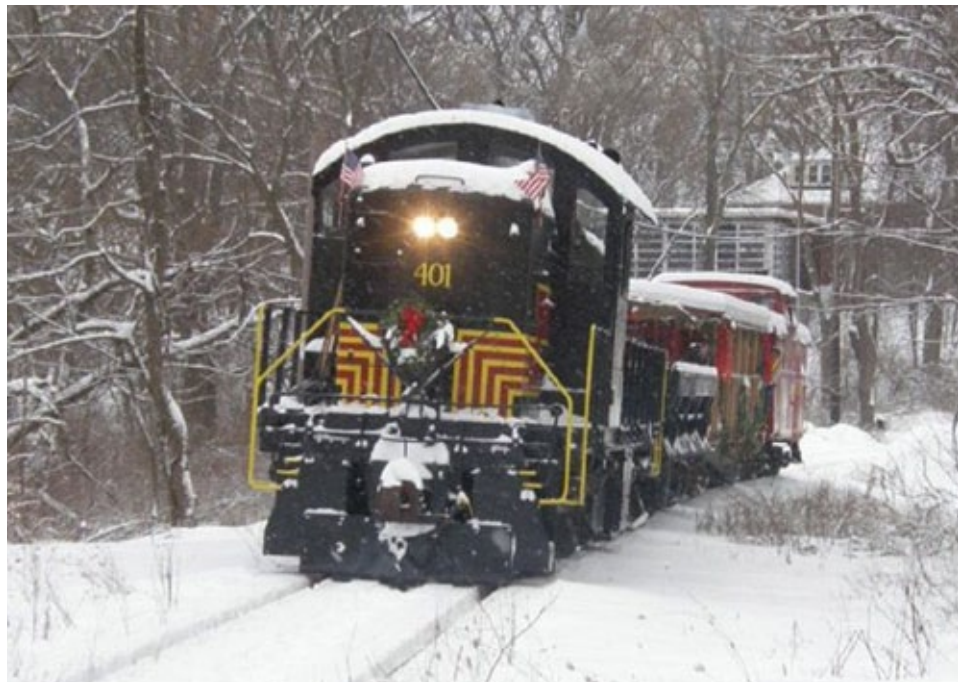
An Alco RS-1 provides motive power for Kingston trains, including the Polar Express and other special holiday runs.

On the east end, work is progressing to reopen the railroad from Kingston to West Hurley, and an eventual link with the Phoenicia segment. Trains currently depart from Westbrook station, at the Kingston Plaza, for a 45-minute ride to the outskirts of the city at the edge of the mountains. A full schedule of special trains for families are operated out of Kingston, including "Great Pumpkin" and "Polar Express" runs.