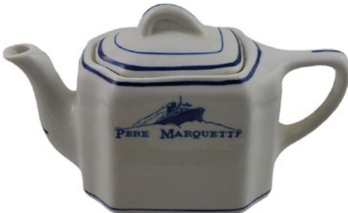
A nice Pere Marquette Ferry teapot by Buffalo, side marked with a ship logo went to a new home for a high bid of $280.