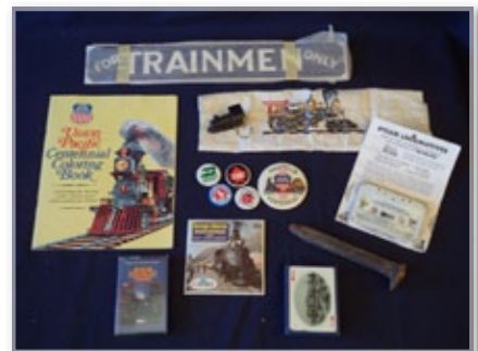
Various Railroad Collectibles