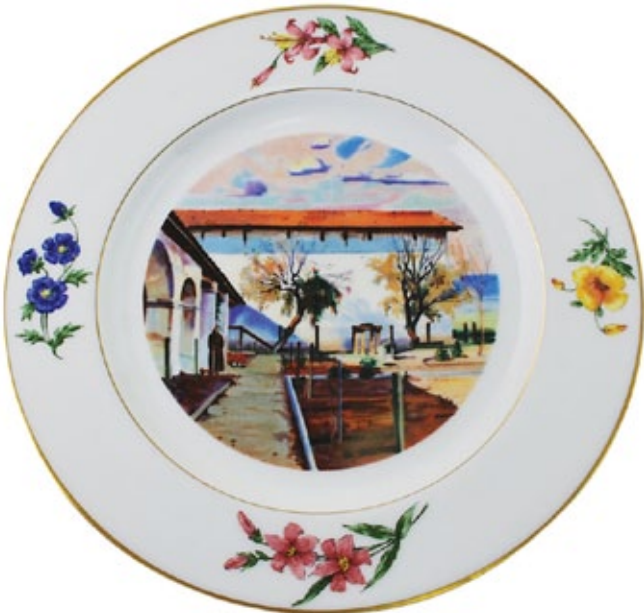
A Southern Pacific Company service plate depicting the Mission San Miguel Arcangel went for a high bid of $3100.