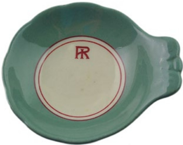
A $1550 bid purchased this scarce top marked Chicago Rock Island & Pacific Sage Green ice cream shell.