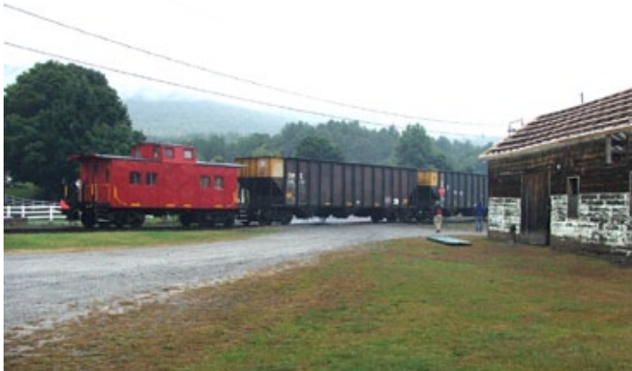
Saratoga & North Creek Railroad photo runby freight for railfans attending the Rail Fair passes the D&H Coal shed.

After detraining, some passengers headed into town for a bite to eat, while many crossed the tracks to visit the Rail Fair's train show. Held in an old industrial building adjacent to the museum, the train show has grown from a few displays of railroadiana to include a variety of vendors and exhibitors.