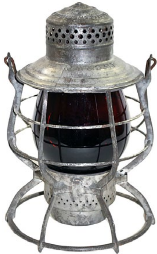
A scarce Adams lantern marked for the Montana, Wyoming & Southern with unmarked red globe sold for $1750.