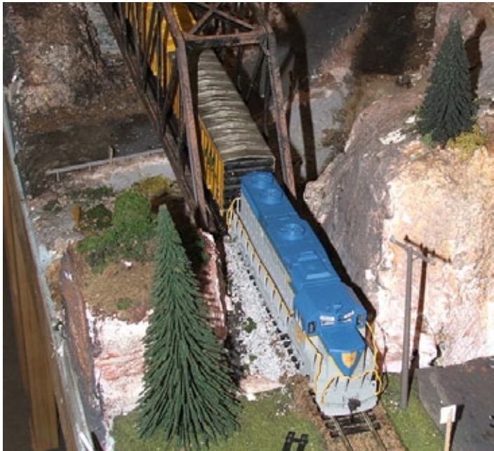
The Delaware & Hudson Railway continues to exist in HO Scale on the Upstate Model Railroaders modular layout.