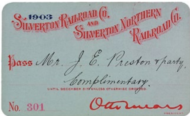
A 1903 annual pass for the Silverton Railroad Company and the Silverton & Northern Railroad sold for $1600.