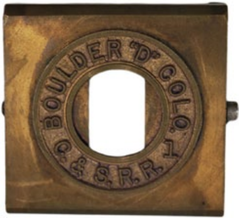
A Colorado & Southern Railroad ticket validator die marked "C&SRR 1 - Boulder "D" Colo." sold for a $380 high bid.