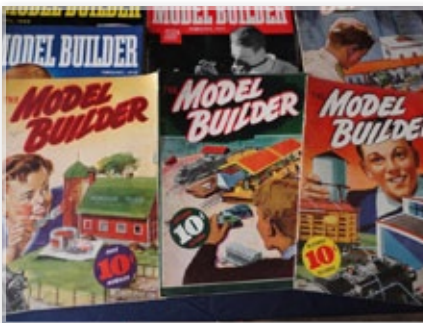
Model Builder Magazines