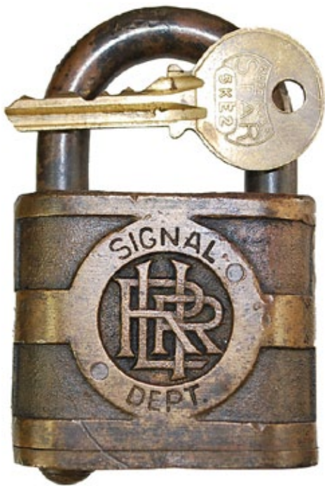
A scarce "LIRR Signal Dept" Long Island Rail Road brass Yale lock with key sold for a high bid of $340.