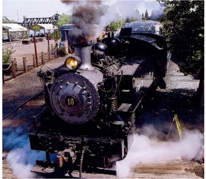
Granite Rock steam locomotive at the California State Railroad Museum.

White River Productions, the publisher of Passenger Train Journal and a variety of publications for railroad historical societies, has acquired the Railfan & Railroad and Railroad Model Craftsman magazines from Carstens Publications, which ceased doing business this summer. Also included in the sale is Carsten's book division, including the inventory of recently published railroad books. Current subscribers to those magazines will receive the remaining issues from the new publisher. For more information, visit the White River Productions website at www.whiteriverproductions.com .