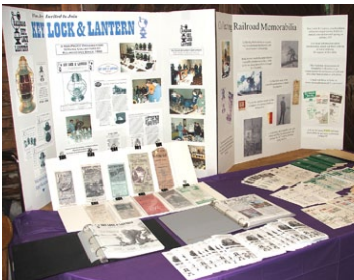
The Key, Lock & Lantern display introduced Rail Fair visitors to the wonderful world of collecting railroadiana.