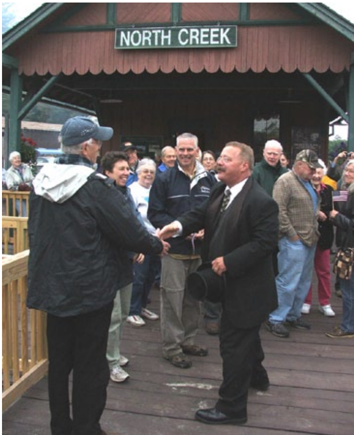
Theodore Roosevelt greets visitors on the platform of the North Creek, NY railroad station, where he received the telegram that he had become president in 1901.