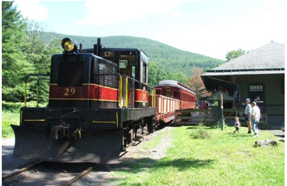
A Catskill Mountain Railroad excursion train arrives at the Empire State Railway Museum in the Phoenicia depot. Train rides have been temporarily relocated to nearby Mount Tremper, due to a washout, but the museum remains open at this location, with displays and a miniature train ride.

Fortunately, while many light density Conrail routes were abandoned, the east end of the Ulster & Delaware route was preserved. Today, tourist lines operate trains on four different segments of the railroad, and several of its stations now house railroad historical museums. The