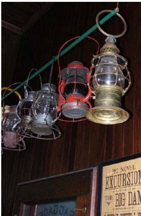
Railroadiana displays at the Empire State Railway Museum in Phoenicia.

West of Roxbury, the old Ulster & Delaware Railroad has been abandoned, and traces of it are slowly fading away. It is truly fortunate that the section that remains intact from Kingston to Roxbury has been preserved by Ulster County, and the A. Lindsay and Olive B. O'Connor Foundation in Delaware County. It is not only an important part of the region's history, but it continues in its role of supporting tourism in the local communities along the line, no longer as a mode of transportation, but as a tourist attraction in itself. In the future, we may once again see through trains running over the entire length of the remaining line, when efforts to bridge the gap in the Catskill Mountain Railroad and long-term plans to repair washouts on the east end of the Delaware & Ulster are successful. In the meantime, it is certainly worth a trip this fall to visit Ulster & Delaware country!