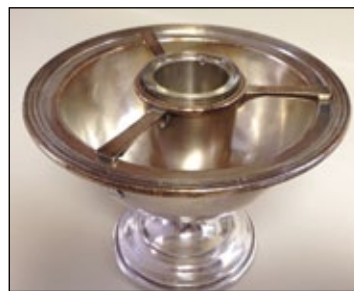
MK&T Silver Hollow Ware

This will be a complete single-owner offering with no additions and nothing held back. There is a strong emphasis on the Missouri-Kansas-Texas line with many hard to find items and many unlisted items still to be discovered as we begin our inventory and cataloging. Please check our web site for updates and additional information.