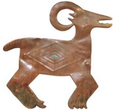
A $1200 bid was needed to purchase this 24x24 inch copper antelope decoration from the Santa Fe car Bayview.