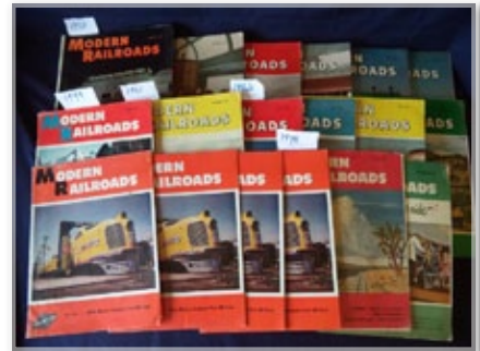
Modern Railroad Magazines