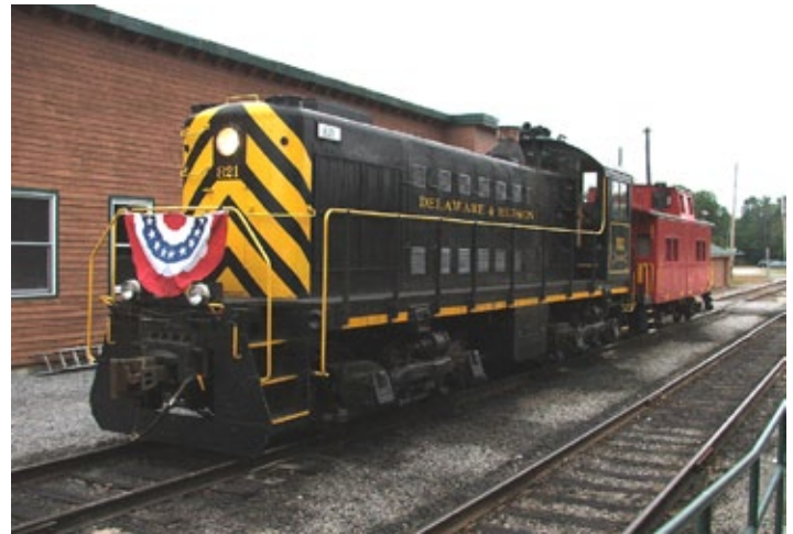
The 2014 version of Teddy Roosevelt's special train consisted of Saratoga & North Creek Alco #821, in Delaware & Hudson colors, and a red caboose.

After taking a few minutes to visit with Teddy Roosevelt, most people headed into the museum to see the displays about the Adirondack Railway and the nearby ski resorts. Located at the end of a branch operated by the Delaware & Hudson Railroad, North Creek, NY was an important gateway to the Adirondack resorts. During World War II, when the line was