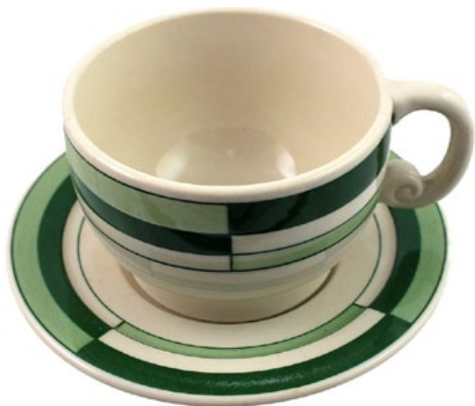
This rare Chicago, Milwaukee & St. Paul Railway Dulaney coffee cup and saucer by Buffalo had a small hairline crack on the side, but still commanded a $1000 high bid.