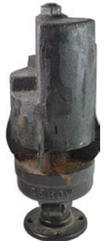
A Union Pacific number plate from Challenger locomotive No. 3939 sold for $6250, while an $1800 bid took home a five chime cast iron whistle marked D&RGW on the base.