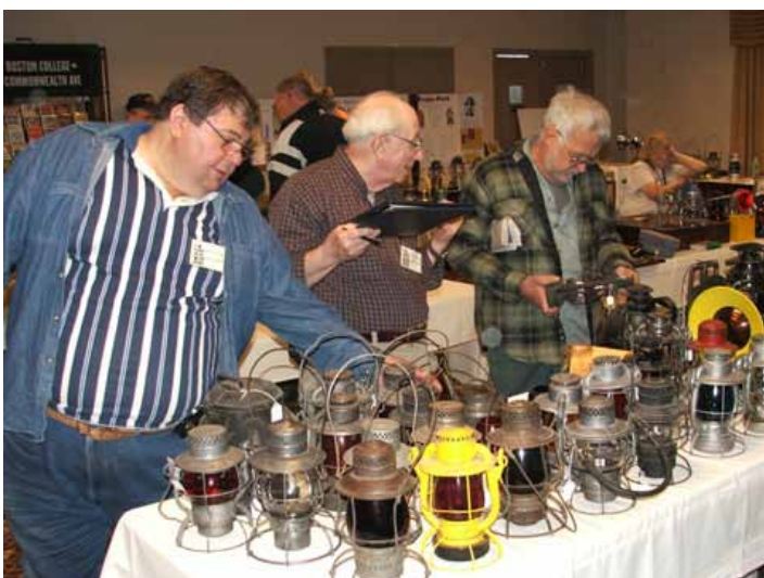
There were plenty of items for trade at the swap meet.