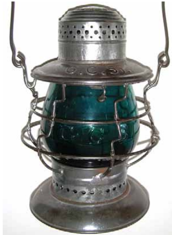
The curious Grand Central Station lantern with the green No.39 globe in a “bent” No.6 frame brought $3100.