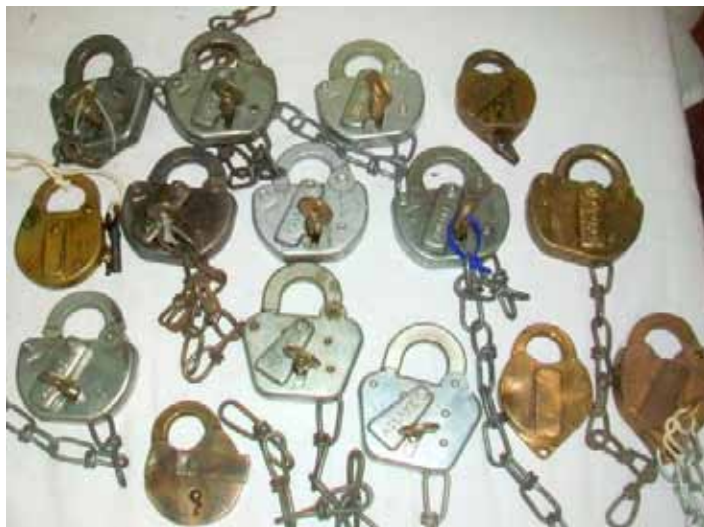
Switch locks & keys to be sold by Jon Lee Auctions.