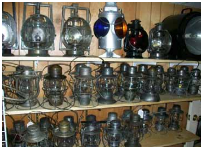
Some of the lanterns to be auctioned in Latham, NY.