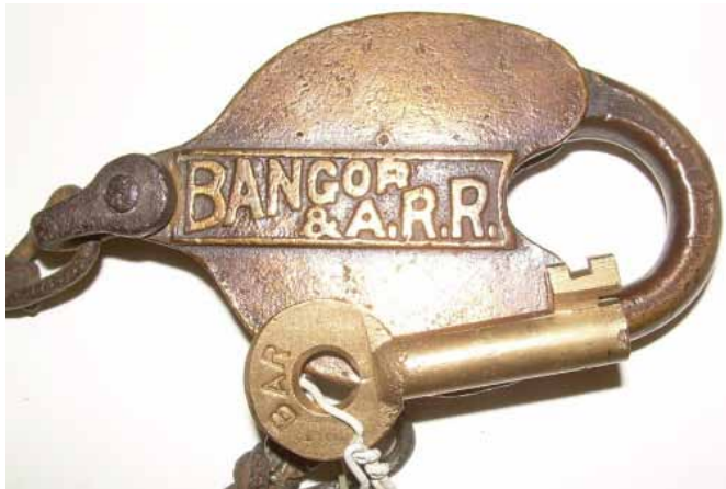
A nice Bangor & Aroostook lock & key set brought $480.

More photos from this auction will be published in a future edition of the Key, Lock & Lantern magazine. The next installment of items from these collections is scheduled for October, and it promises to be an interesting sale. All prices reported are "hammer prices" and do not include buyers premiums.