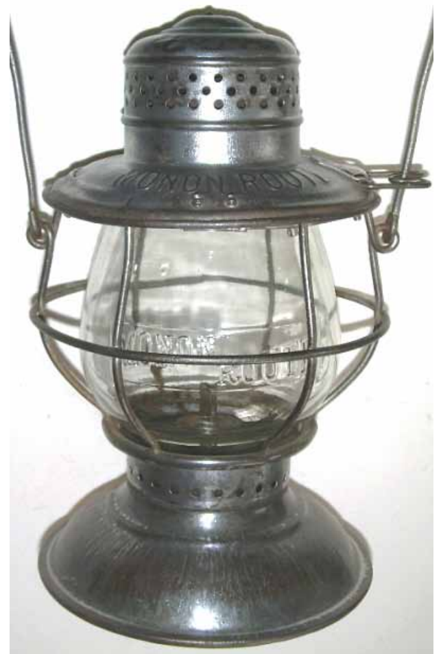
One of several lots from outside of New England, this Monon Route bellbottom lantern brought $750.