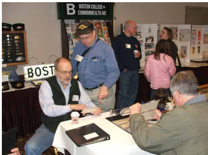
Collectors examine a nice selection of railroad postcards.