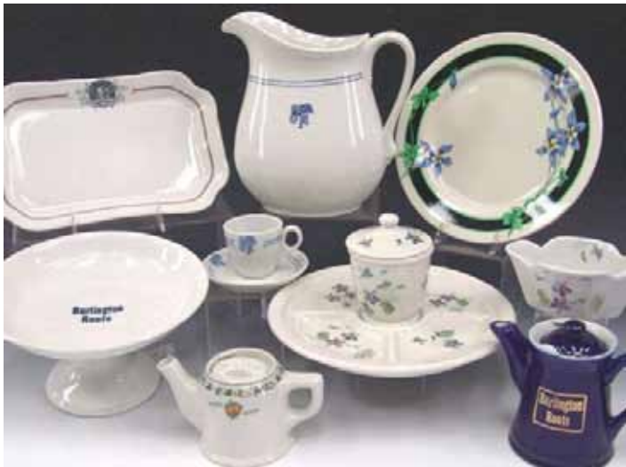
Dining car china from the collection of Steve & Sherri Stich.