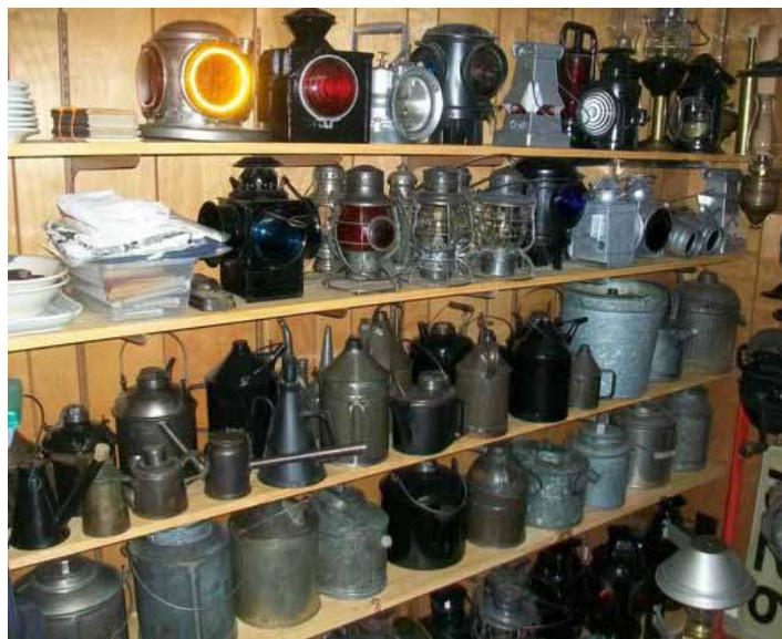
Part of the collection to be sold by Jon Lee Auctions.