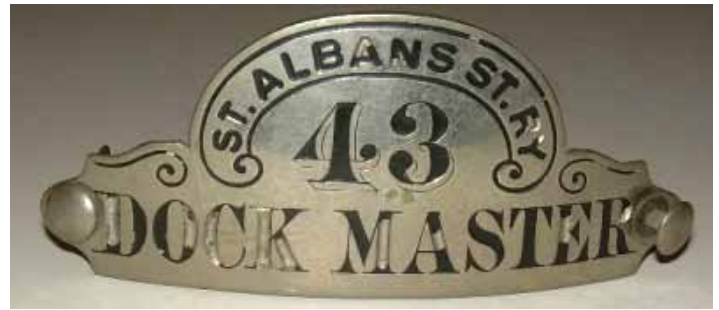
A street railroad hat badge with the unusual occupation of “Dock Master” sold at auction for $265.

A number of locks and keys, also in very good condition, were offered at the sale. The rarer locks were sold individually, while the more common ones were grouped in lots of two or more pieces, with most lots selling in the $100-200 range. A few signs, books, paper and other items completed the 100 or so lots of railroadiana at this auction. Another installment is planned for later in the year.