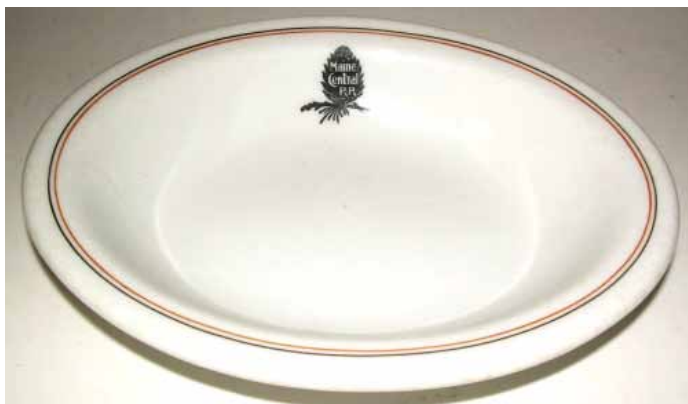
A 6 1/4 x 5 inch oval dish, one of several pieces of Maine Central RR "Pinecone" dining car china, sold for $525.

There was plenty of memorabilia from outside of New England in the sale, as well. Several nicely restored lanterns from western and midwestern railroads were sold, along with some rare items from upstate New York trolley lines.