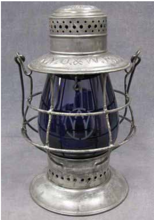
This NYO&W Dietz bellbottom with a blue logo globe brought $2600.