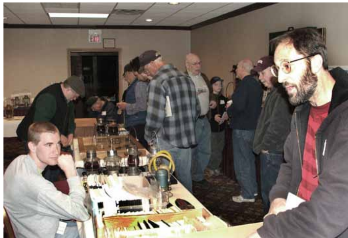
A variety of memorabilia at the KL&L convention.

Early bird admission during dealer set-up hours on Friday afternoon is available, along with group discounts. The HOST Resort is located on Route 30, in Lancaster, Pa, which is only a short drive from the various railroad museums in nearby Strasburg. For more information, visit the show web site at www.lancasterlockshow.com .