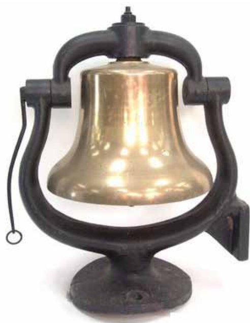
The Stich collection includes several bells & other rolling stock fixtures.

Another large collection is scheduled to be sold over the weekend of June 19th, by Jon Lee Auctions of Latham, NY. This collection includes a large number of lamps, lanterns, oil cans, and other hardware, mostly from eastern railroads. There are also many books, timetables, and paper items. With over 800 lots, this auction is planned to take place over two days.